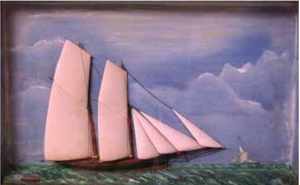
62. SHADOW BOX WITH GAFF-RIGGED SCHOONER , late 19 th Century, half model with carved wooden sails and hull, painted background with cutter. 19 ½ in. x 30 ¾ in.