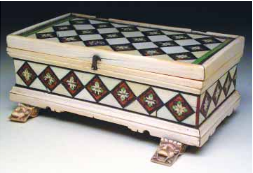
42. IVORY INLAID MINIATURE JEWEL CASKET, Continental, 18 th Century, marquetry inlaid with dyed ivory, tortoise-shell & various woods. Comprising 2761 pieces. Height 3 ¼ in. Length 8 ¼ in. Width 4 ¼ in.