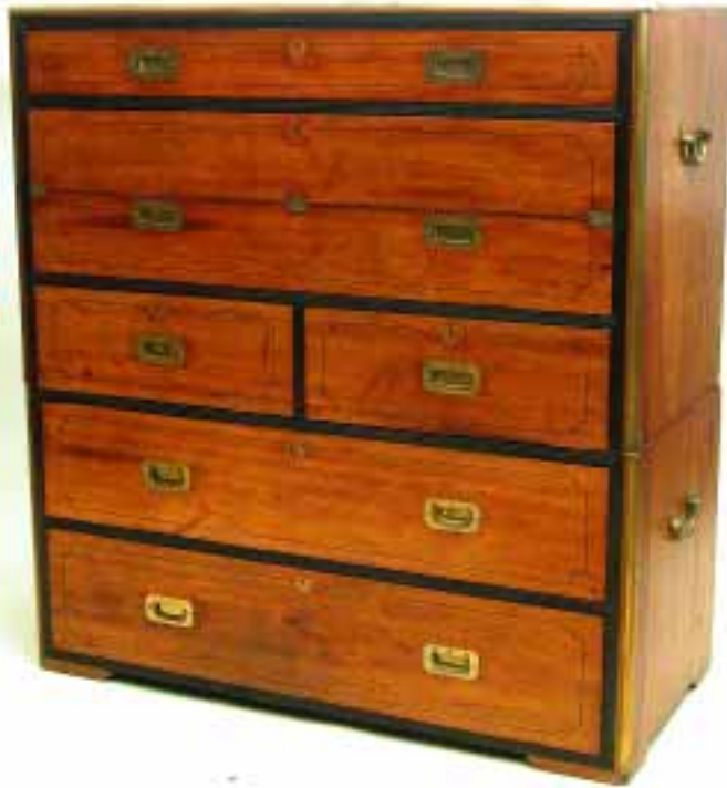
31. ANGLO-INDIAN CAMPHORWOOD CAMPAIGN CHEST, 2 nd half of 19 th Century , with ebonized drawer surrounds, inset brass pulls and side bail handles. Height 46 ½ in. Width 43 ½ in. Depth 20 in.