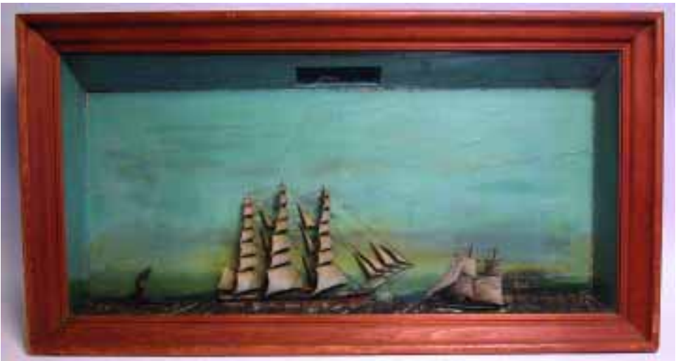
59. MARINE SHADOW BOX, 19 th Century , ship and brig with carved wooden sails and hull, with steam tug on moulded ocean, painted background with headland and a barque. 29 in. x 55 in.