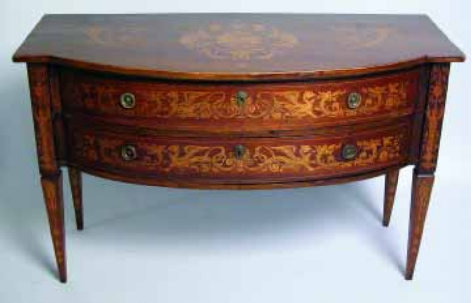
41. ITALIAN MARQUETRY INLAID WALNUT TWO DRAWER COMMODOE, 19 th Century, Height 30 ¾ in. Width 48 ½ in. Depth 22 in.