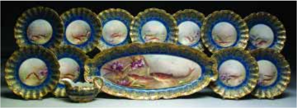
39. LIMOGES HAND PAINTED THIRTEEN PIECE FISH SERVICE, early 20 th Century , comprising eleven plates, platter and sauce boat, each with a unique painting of fish signed Mulville . Platter: Length 24 in. Width 10 ½ in. Plates: Diameter 9 ½ in.