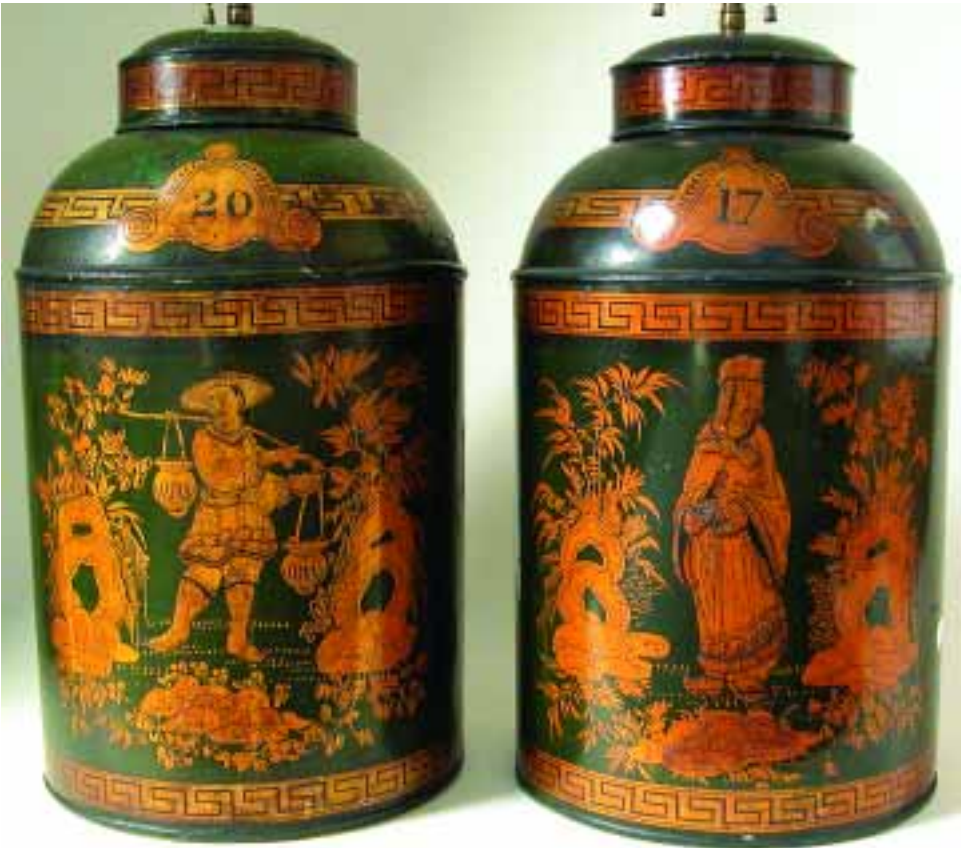
40. PAIR OF CHINESE TOLE TEA CANISTERS, 19 th Century , electrified. Height 18 in. Diameter 10 ½ in.