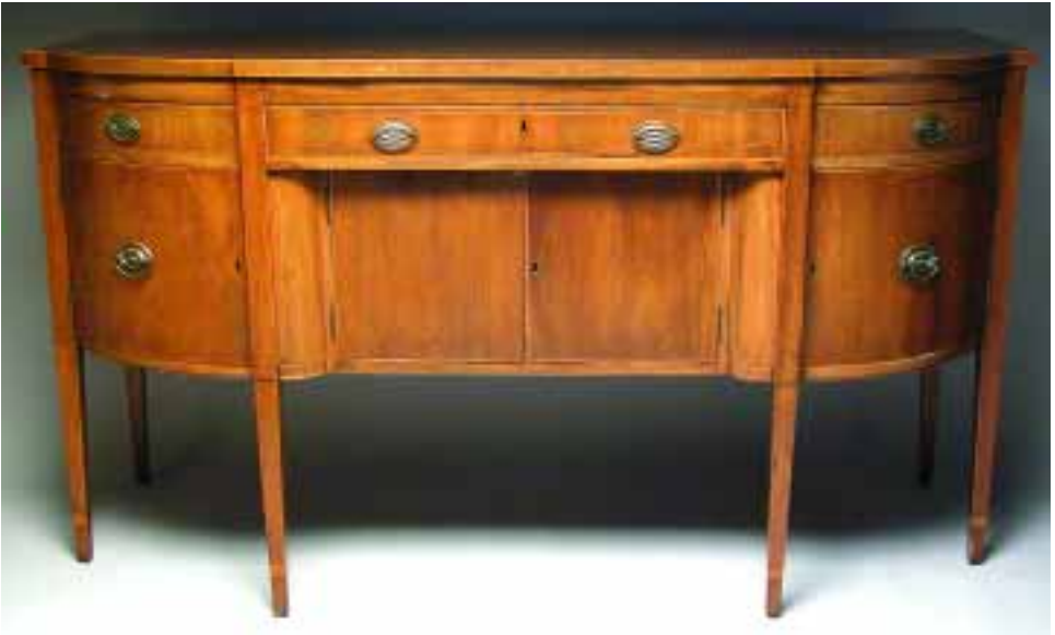
37. NEW YORK HEPPLEWHITE MAHOGANY INLAID BOWFRONT SIDE-BOARD, circa 1790. Height 40 \frac{1}{4} in. Width 72 \frac{1}{4} in. Depth 28 \frac{1}{2} in.