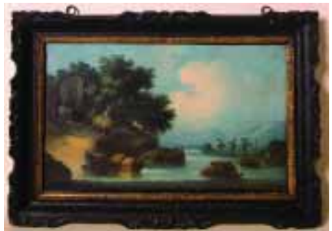
53. PAIR OF CHINA TRADE PAINTINGS, SAMPANS IN A RIVER LANDSCAPE , 19 th Century , oil on canvas, unsigned in original carved and ebonized frames. 10 \frac{1}{2} in. x 17 \frac{3}{4} in.