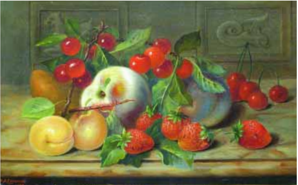
33. PAINTING, STILL LIFE WITH FRUIT AND BERRIES , E.A. CROXON (AMERICAN), 19 th Century, oil on canvas, signed lower left, in period frame. 9 in. x 14 in.