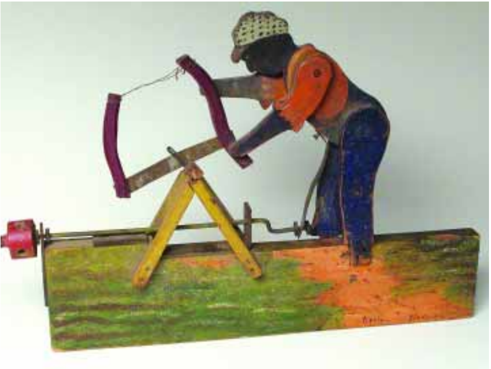
56. EXTREMELY RARE NANTUCKET WHIRLIGIG, LINCOLN CEELY, circa 1900, signed on base, Ceely, Nantucket. Height 12 ¼ in. Length 15 ¼ in.