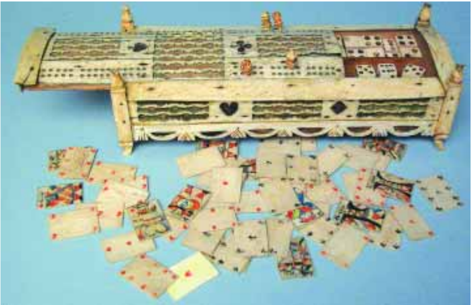
45. PRISONER-OF-WAR BONE GAME BOX, circa 1800 , pierced bone box with domed sliding lid, pineapple finials and cribbage board, containing 55 dominoes, 52 cards, 3 dice, and 4 pegs. Height 2\frac{3}{4} in. Length 8\frac{1}{2} in. Width 3\frac{1}{4} in.