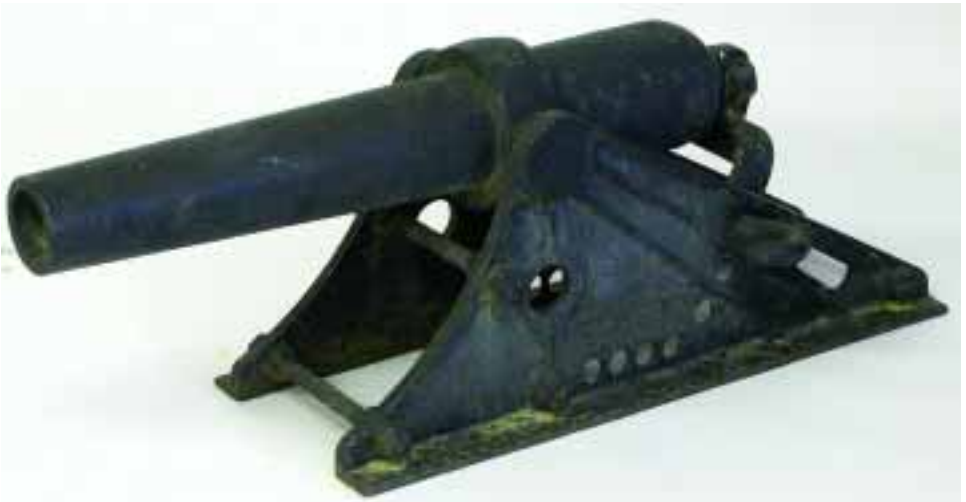
36. COSTON LIFE-SAVING LINE CANNON, late 19 th Century, iron gun and carriage stamped Coston Signal Co., New York, USA . Height 14 ½ in. Length 39 in. Width 11 ¼ in.