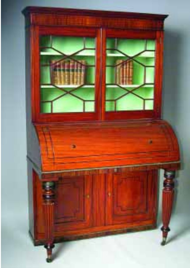
60. REGENCY HARPSICHORD CASE , re-conceived as a secretary bookcase in the 20 th Century. Height 70 ½ in. Width 43 ¼ in. Depth 22 ½ in.