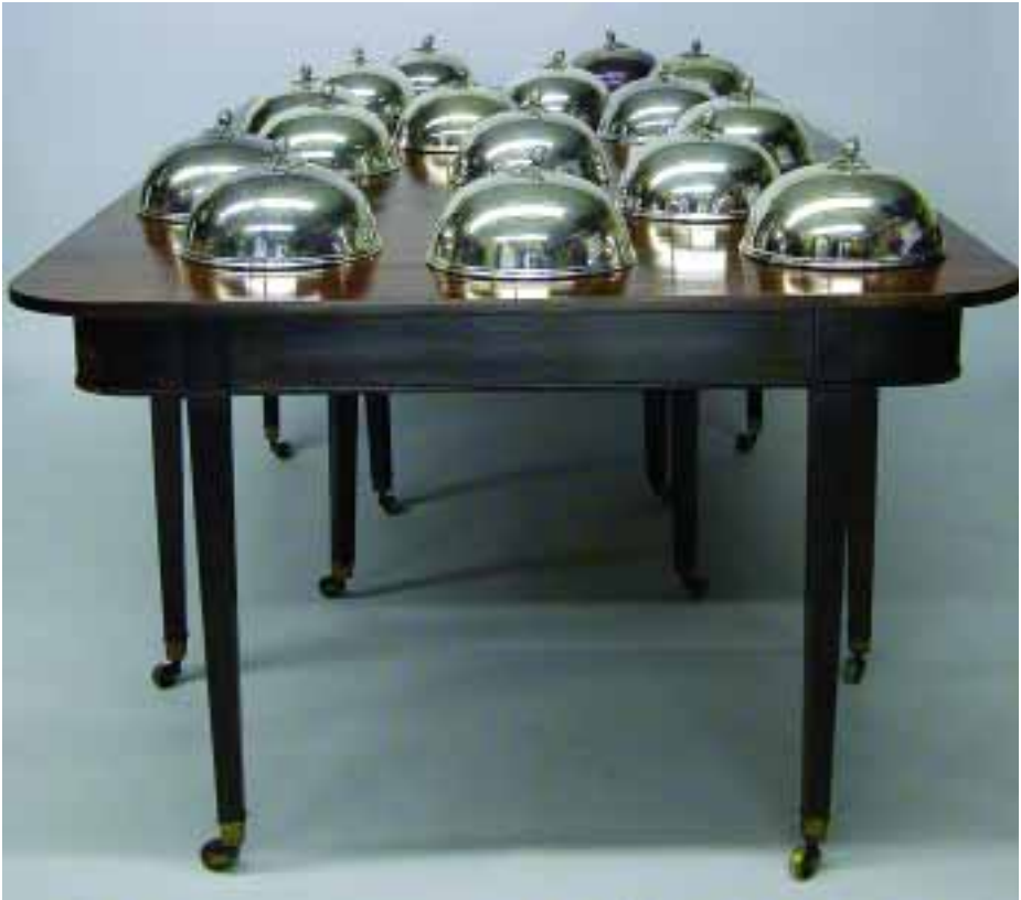
51. SET OF SIXTEEN FRENCH SILVER-PLATED ENTRÉE DOMES, early 20 th Century , with fruit finial, hallmarked. Height 5 \frac{3}{4} in. Diameter 10 \frac{1}{4} in.