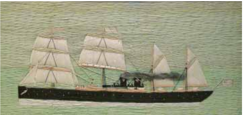
61. SAILOR'S WOOLIE , 19 th Century, four-masted auxiliary barkentine flying American ensigns at masthead and transom. 9 ½ in. x 20 ¼ in.