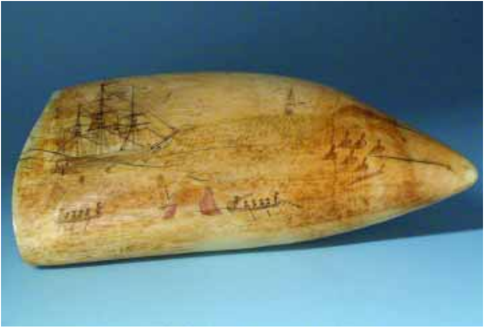
47. IMPORTANT ENGRAVED WHALE TOOTH, mid 19 th Century , view of whale ship with two boats lowered and darted on a whale in a flurry, in background seven sperm whales spouting and another ship. Length 7 ½ in.