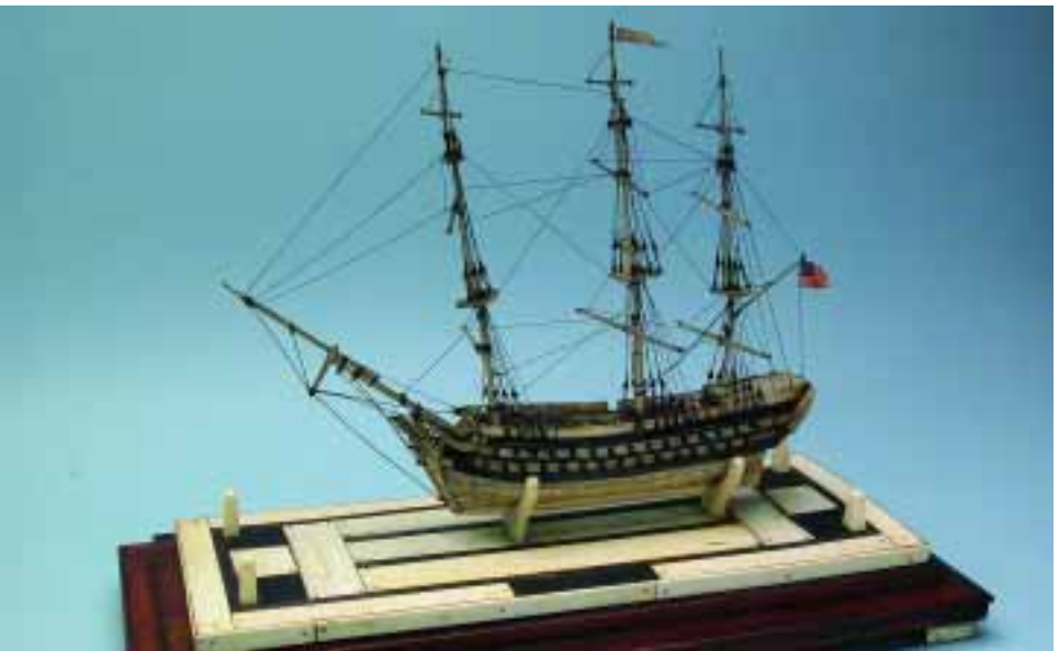
34. PRISONER-OF-WAR BONE MODEL OF AN AMERICAN FRIGATE, circa 1800, double-decker with wooden deck and trim, sixty guns, carved eagle figurehead, female figural sternboard, paper American ensigns flying at masthead and stern; mounted on bone and baleen base. Height 10 ½ in. Length 15 ¼ in. Width 6 in.