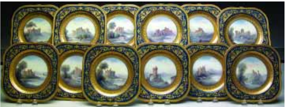
50. SET OF TWELVE ROYAL WORCESTER HAND PAINTED SCOTTISH CASTLE DESSERT PLATES , early 20 th Century, made expressly for Ovington Bros., New York and Chicago, each with a different castle in a landscape, signed by R. Rushton. Three as is. Diameter 8 ¼ in.