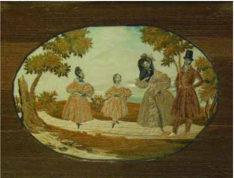
38. SILK EMBROIDERED PICTURE, ELEGANT FAMILY ON AFTERNOON STROLL, 19 th Century, chenille and thread on silk panel with painted features and background. 12 \frac{3}{4} in. x 17 \frac{3}{4} in.