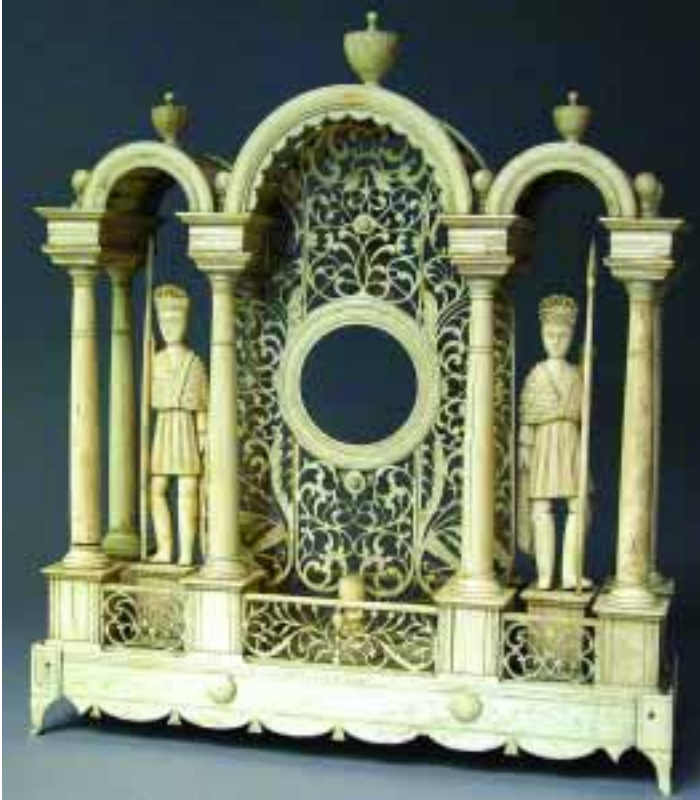
35. PRISONER OF WAR CARVED BONE WATCH TOWER, circa 1800, domed collonade with arabesque screen flanked by "noblemen," on swag base. Height 11 ¼ in. Width 9 ¾ in. Depth 3 in.