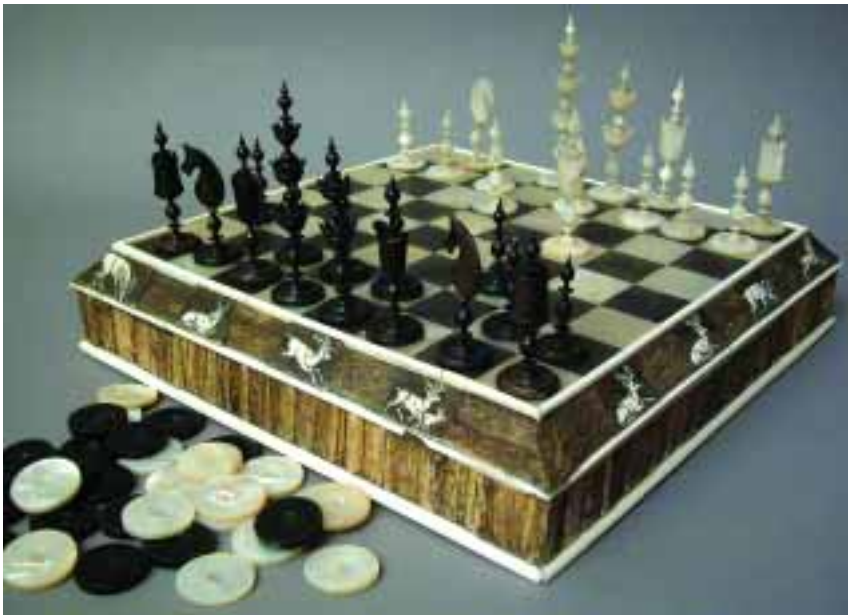
44. NORTHERN EUROPEAN PARQUETRY INLAID CHESS SET, 19 th Century, mother-of-pearl and horn game board framed in ivory and carved antler; interior with conforming trays holding chess and checker pieces. Height 2 ½ in. Width 12 in.