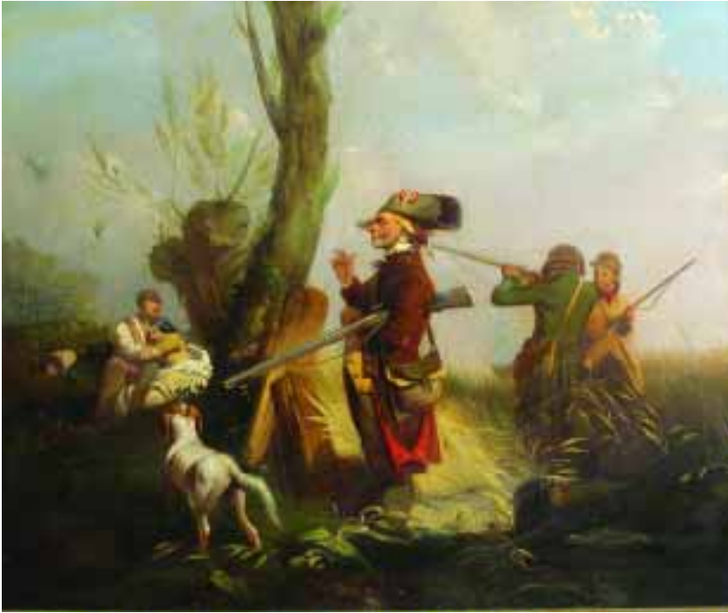
43. PAINTING, WHIMSICAL HUNTING SCENE , 19 th Century, oil on mahogany panel, unsigned. 18 ¼ in. x 21 ¼ in.