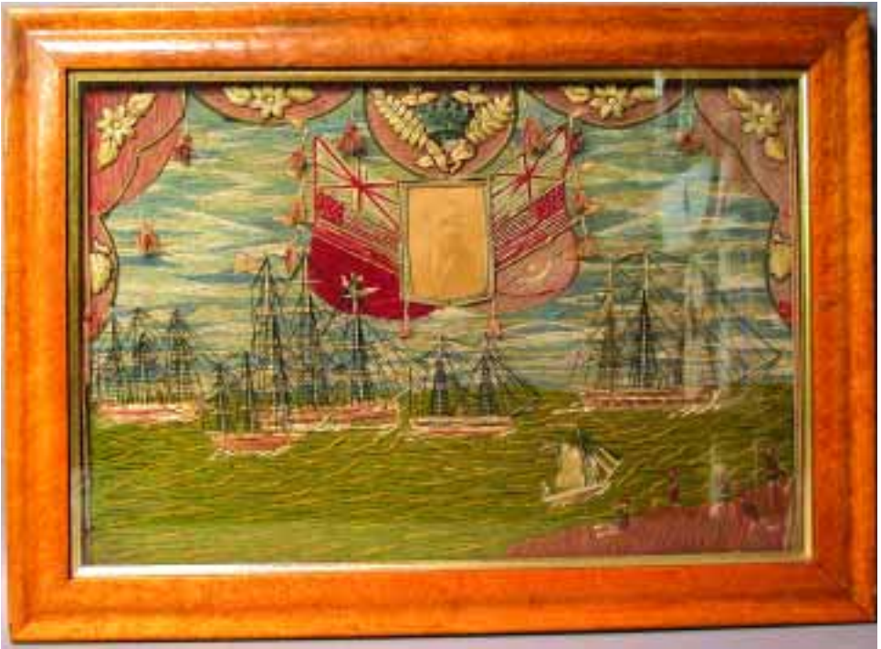
58. ENGLISH WOOLIE VIEW OF NAVAL FLEET ACTION, circa 1880s , wool embroidered scene from the bombardment of Alexandria on 11 July 1882, with photograph of Admiral Lord Alcester beneath a baron's coronet which he received for this command; note Egyptian Regulars firing from quay in foreground. 14 ¼ in. x 21 ¼ in.