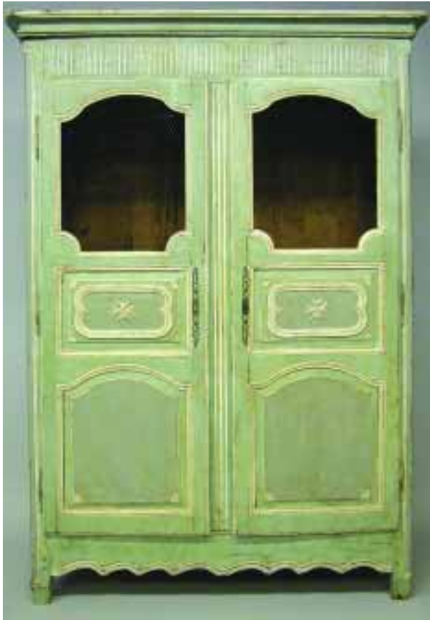
144. FRENCH PROVINCIAL DECORATED GRILL DOOR CUPBOARD, 19 th Century. Height 85 ½ in. Width 61 in. Depth 26 in.