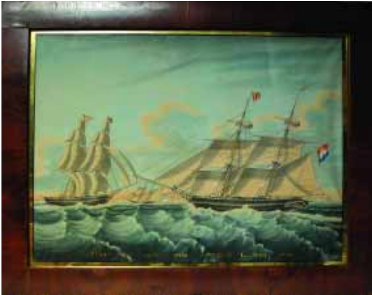
162. PAINTING, DIRK ANTOON TEUPKEN (TOPKE) JR. (DUTCH: 1828 – 1859) ACTIVO VAN AMSTERDAM, KAPITEIN L. HUS. 1846 , unusual water-color on paper double view of the brig Activo , signed lower left ... D.A. Teupken...Amsterdam 1846 , retaining artist's paper label on reverse. In original frame with gilded border glass panel. Height 21 in. Width 28 ¼ in.