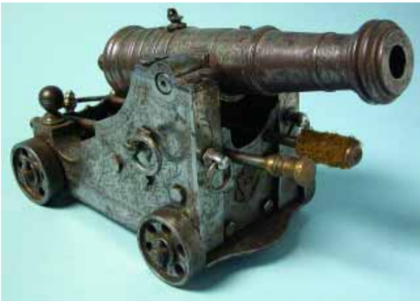
163. AMERICAN ENGRAVED STEEL SIGNAL CANNON, 19 th Century , adjustable elevation barrel on wheeled carriage, engraved throughout, with 13 star shield and patriotic eagle clutching banner inscribed "E Pluribus Unum," accompanied with ram rod and swab. Height 6 ½ in. Length 13 ¼ in. Width 6 ½ in.