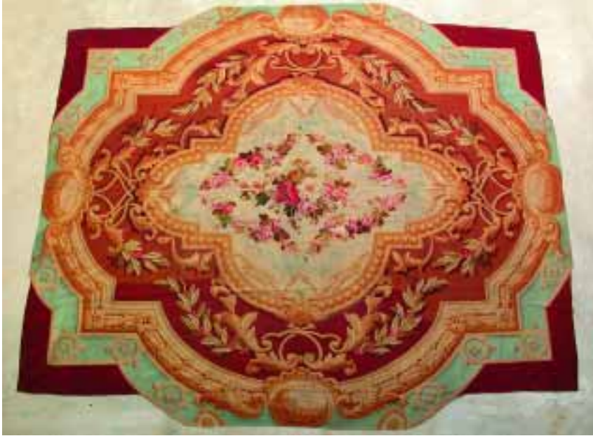
150. 19 th CENTURY FRENCH AUBUSSON CARPET. 12 ft. 8 in. x 15 ft. 5 in.