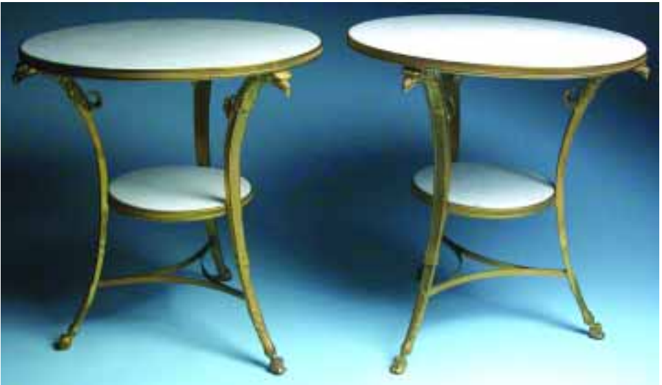
154. PAIR OF LOUIS XVI STYLE ORMOLU MARBLE-TOP GUERIDONS, 20 th Century. Height 26 ¼ in. Diameter 24 in.