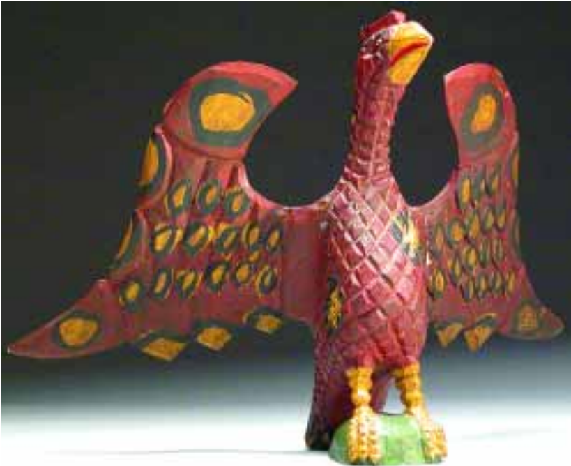
160. WILHELM SCHIMMEL CARVED AND POLYCHROMED EAGLE, (PENNSYLVANIA GERMAN, d. 1890), in original surface. Height 8 \frac{1}{4} in. Width 12 \frac{1}{2} in.