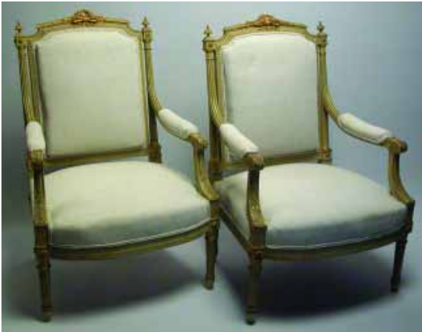
152. PAIR OF LOUIS XVI STYLE CARVED AND DECORATED FAUTEUILS, circa 1890's. Height 40 in. Width 27 in. Depth 23 in.