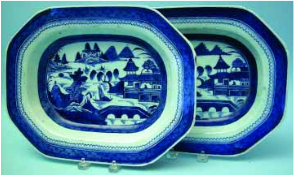
148. PAIR OF CANTON DEEP PLATTERS, 19 th Century. Height 2 ¼ in. Length 14 in. Width 11 in.