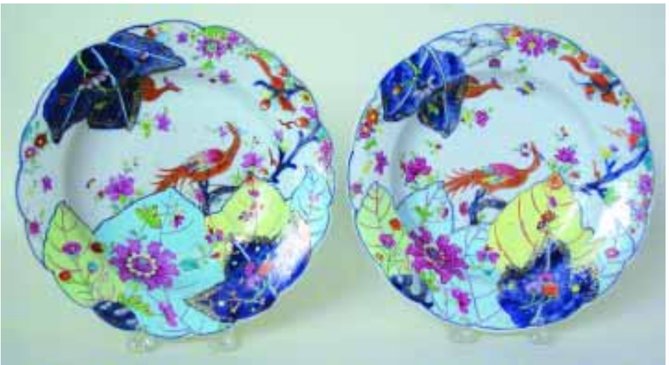
142. PAIR OF CHINESE EXPORT TOBACCO LEAF PATTERN BOWLS, early 18 th Century. Diameter 9 in.