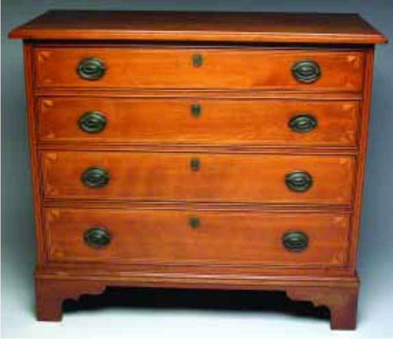
159. NEW ENGLAND CHIPPENDALE CHERRY INLAID GRADUATED FOUR DRAWER CHEST, circa 1780, with quarter fan inlay. Height 36 in. Width 40 \frac{3}{4} in. Depth 19 in.