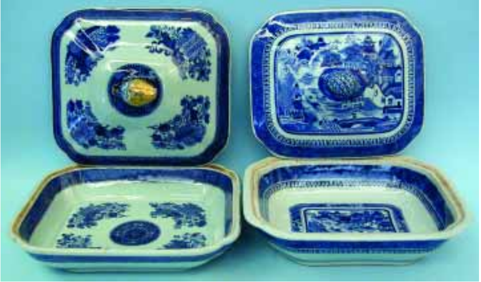
146. FITZHUGH COVERED ENTRÉE DISH, 19 th Century, with gilt highlights. Height 5 ¼ in. Length 9 ¾ in. Width 8 ¾ in.