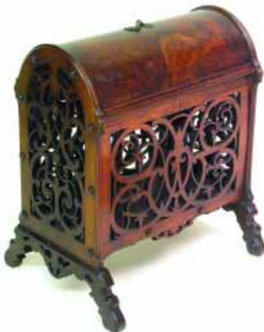
174. ENGLISH BURL WALNUT CARVED AND PIERCED PORCELAIN PLATTER CADDY, circa 1860, bearing porcelain manufacturers registered designed brass plaque for May, 1860. Height 22 ½ in. Width 19 in. Depth 15 ½ in.