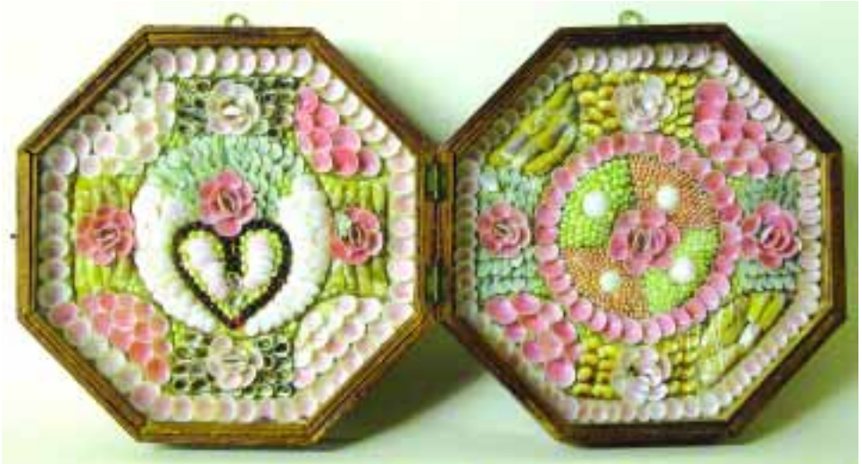
172. SAILOR'S VALENTINE, 2 nd half of 19 th Century, shell collage in double hinged octagonal case. 9 in. x 9 in.