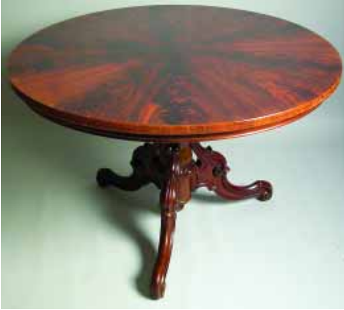
175. AUSTRIAN MATCHBOOK FLAME MAHOGANY VENEERED CENTER TABLE, circa 1840. Height 29 in. Diameter 43 in.