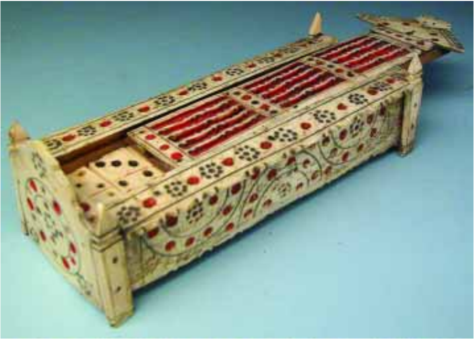
153. PRISONER-OF-WAR BONE GAME BOX, circa 1800 , scribed and polychromed box, sliding wax decorated lid exposes, 36 dominoes. Height 2 ½ in. Length 8 in. Width 2 ½ in.