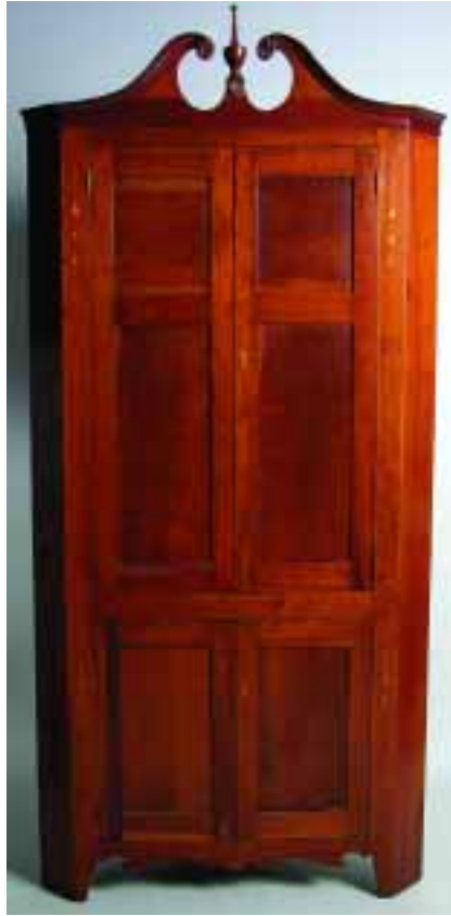
171. CONNECTICUT FEDERAL CHERRY INLAID CORNER CUPBOARD, circa 1800. Height 87 ½ in. Width 41 in. Depth 18 ½ in.