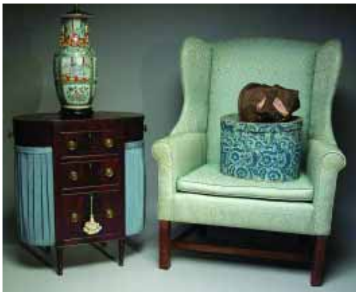
166. CHINESE EXPORT ROSE MEDALLION VASE, late 19 th Century, electrified. Height 17 ½ in.