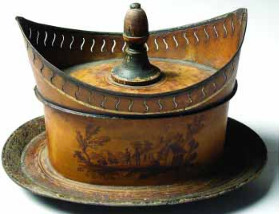
141. TOLE TEA CADDY, 18 th Century , turned and ebonized wooden finial on lid, hand-painted landscapes on body. Height 5 in. Length 8 in. Width 6 in.