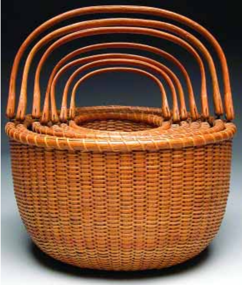
164. NEST OF SEVEN NANTUCKET ROUND OPEN SWING HANDLE BASKETS BY FERDINAND SYLVARO (NANTUCKET 1869–1952), circa 1925, each with oak staves, rim and handles, scribed maple bottom plates, and original paper labels inscribed Made by Ferdinand Sylvaro, 97 Orange St., Nantucket, Mass. Each base inscribed with owner's initials E.L.R. Height 8 in. Diameter 13 in. graduating to Height 4 in. Diameter 5 \frac{3}{4} in.