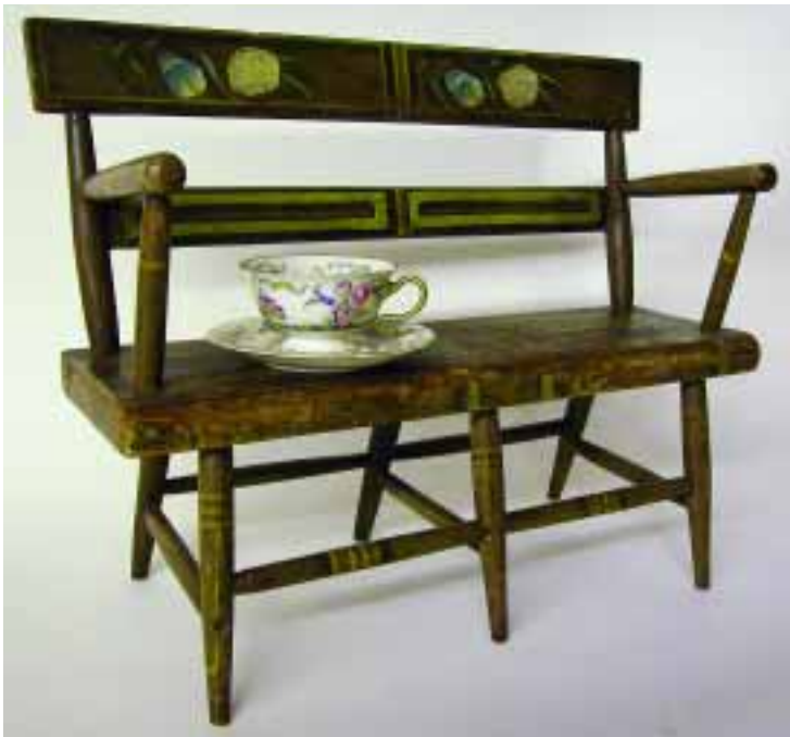
156. RARE PENNSYLVANIA DECORATED SALESMAN'S SAMPLE PLANK SEAT SETTEE IN ORIGINAL PAINT, circa 1820-1840. Height 16 in. Width 20 in.