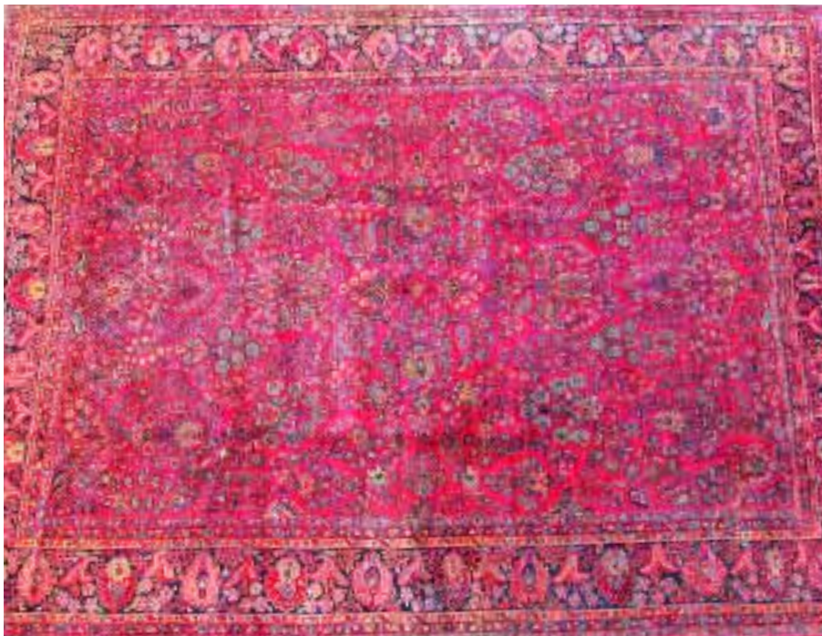
173. VINTAGE SAROUK CARPET. 10 ft. x 13 ft.