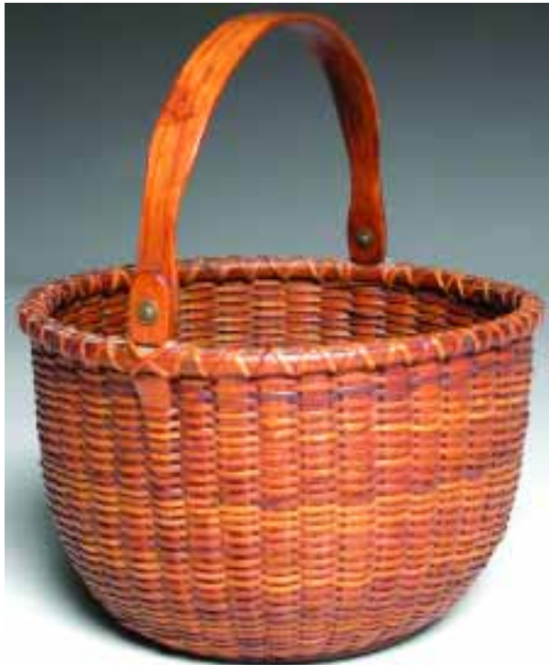
158. NANTUCKET OPEN ROUND SWING HANDLED LIGHTSHIP BASKET, circa 1870s, with oak staves, rim, handle and hand carved ears. Height 5 in. Diameter 8 in.