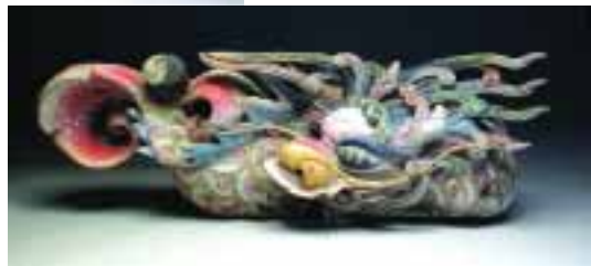
145. CHINESE MING CARVED AND POLYCHROMED SEA DRAGON TEM- PLE CORBELS, circa 1600's. Height 11 in. Length 40 in. Depth 8 in.