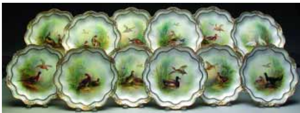
170. SET OF TWELVE SCOTTISH HAND PAINTED GAME BIRD PLATES, early 20 th Century, each with a different scene of birds in a landscape, signed W. Birbeck, marked Ovington Bros. Diameter 9 in.