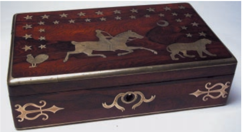
4. ROSEWOOD AND BRASS STORAGE BOX, mid 19th Century, inlaid with engraved horse and rider, tiger, chicken, stars, moon, scrolls and edge trim. Height 5 in. Width 17 ¼ in. Depth 10 ¼ in.