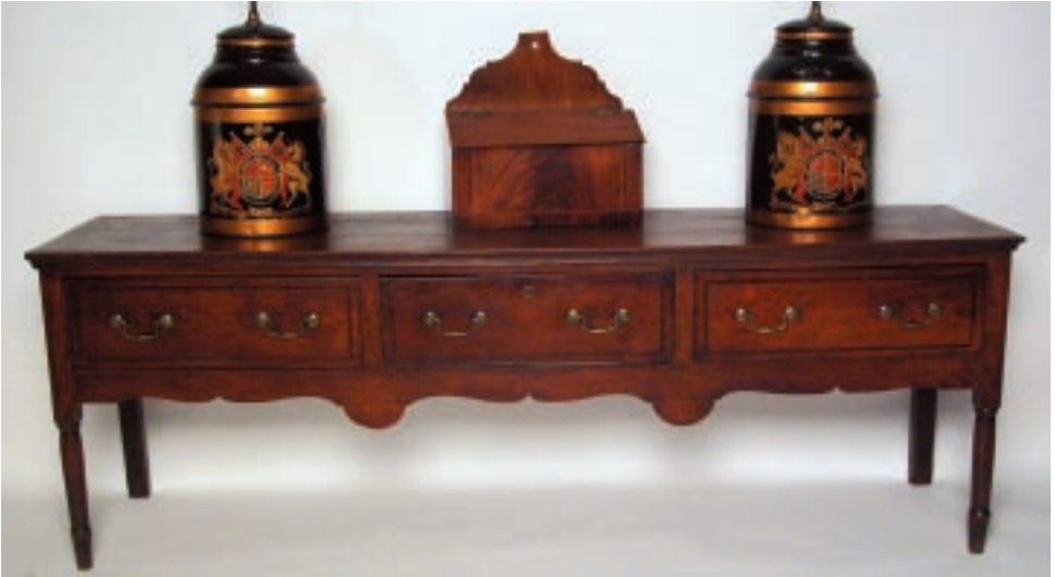
22. PAIR OF ENGLISH GILT AND PAINT DECORATED TIN TEA CANISTERS, mid 19th Century, electrified. Height 18 in.