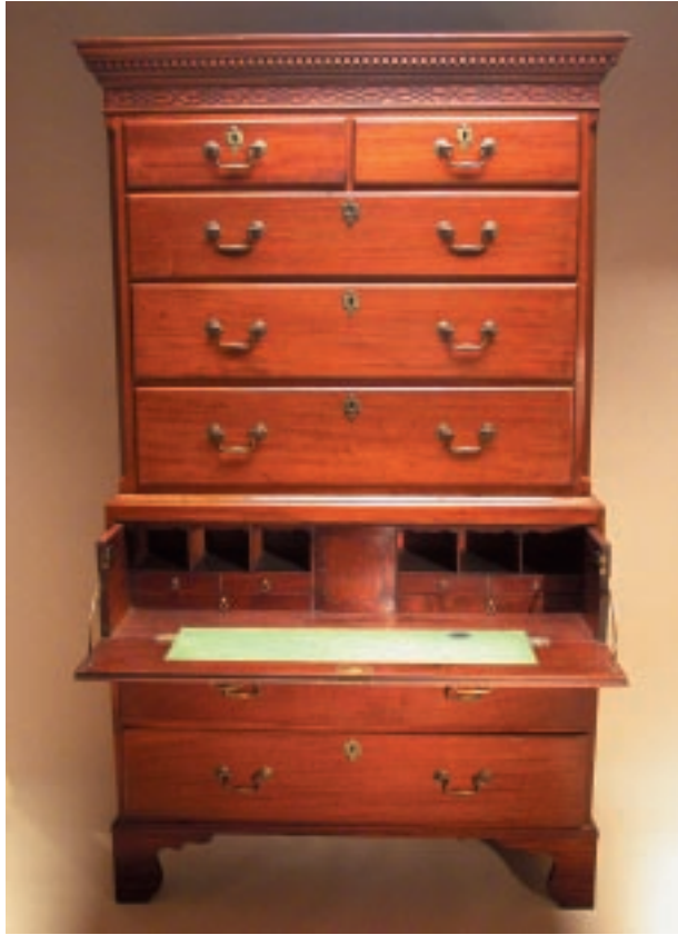
29. GEORGE III MAHOGANY BUTLER'S CHEST ON CHEST, circa 1820, dental and fretwork crown with reeded corners, brass post and bail pulls. Height 73 ¼ in. Width 43 ¼ in. Depth 21 in.