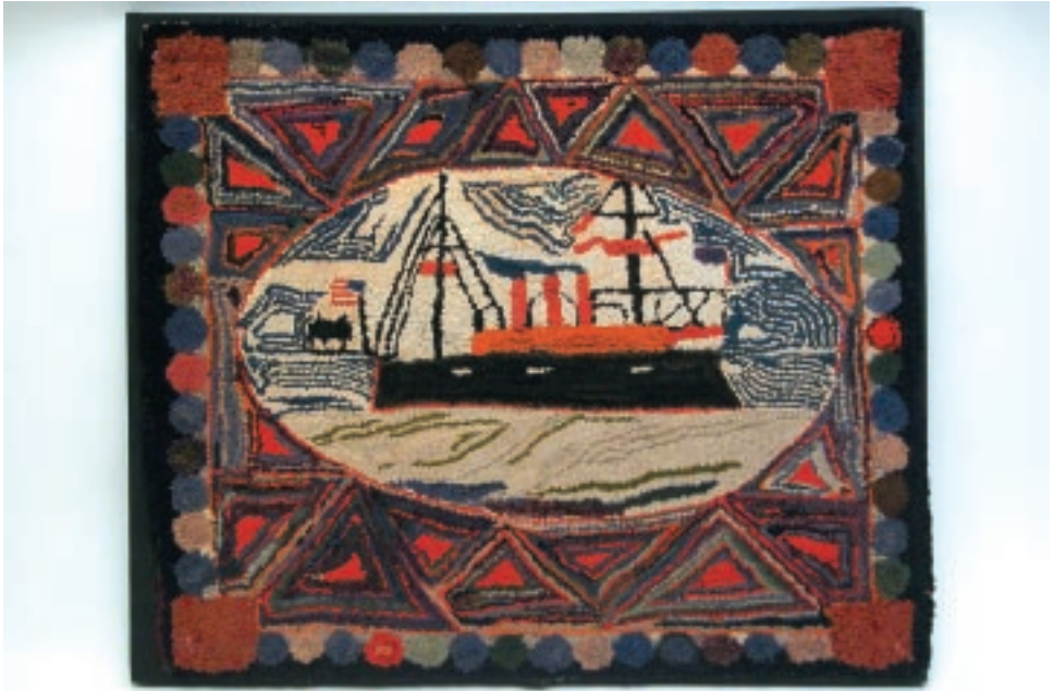
26. VIBRANT AMERICAN FOLK ART RAG AND YARN HOOKED RUG, late 19th Century, depicting a steam-sailor and American flag. Approximately 45 in. x 45 in.