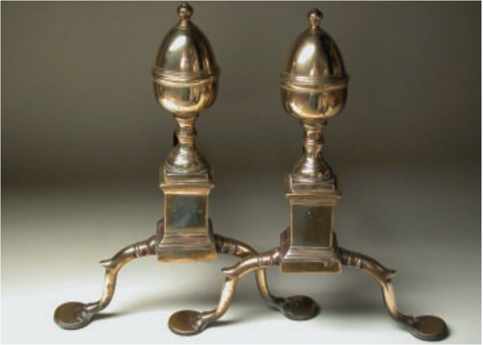
5. PAIR OF PHILADELPHIA OR BALTIMORE BRASS ACORN TOP ANDIRONS , circa 1800, supported on arched spurred legs and penny feet. Height 16 in.