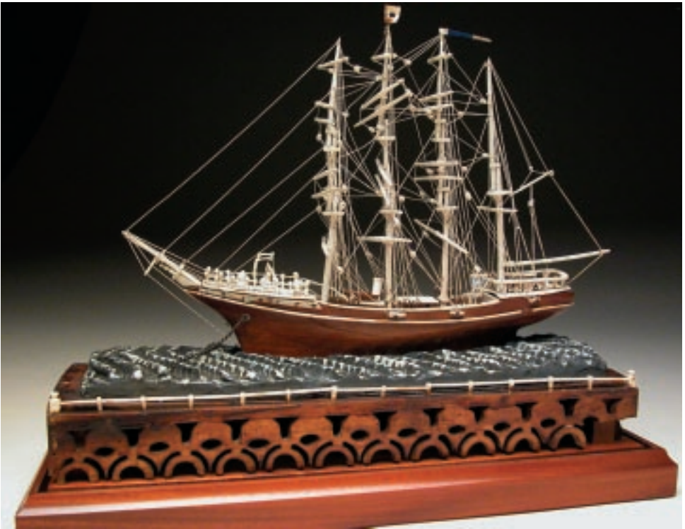
7. CARVED BONE AND WOOD FOUR-MASTED CLIPPER SHIP, circa 1880, with dropped anchor, solid wood hull mounted with bone, set in carved and painted wood ocean caps. Height 9 ½ in. Length 13 ½ in. Width 3 in.