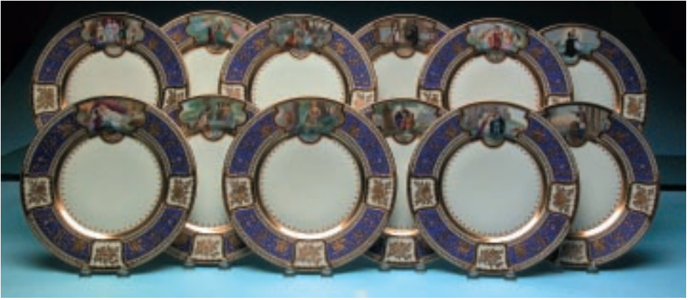
19. SET OF TWELVE COMTE MARRACH KARLSBAD BOHEMIA DINNER PLATES , hand painted depicting twelve various opera scenes, signed by the artist K. Tschapek. Detail: Derflugende Hollander. Diameter 10 \frac{3}{4} in.