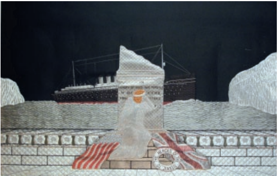
10. ENGLISH SILK NEEDLEWORK, MEMORIAL PICTURE OF THE TITANIC , circa 1912-15 , angel in front of memorial flanked by American and British flags with the Titanic between two icebergs in background. 16 in. x 20 ½ in.