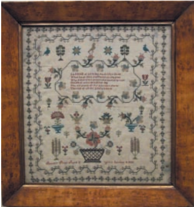
12. ENGLISH SAMPLER , Betsey Rall, her work at the age of 12, 1835, in period bird's eye maple frame. 13 ¼ in. x 12 ½ in.