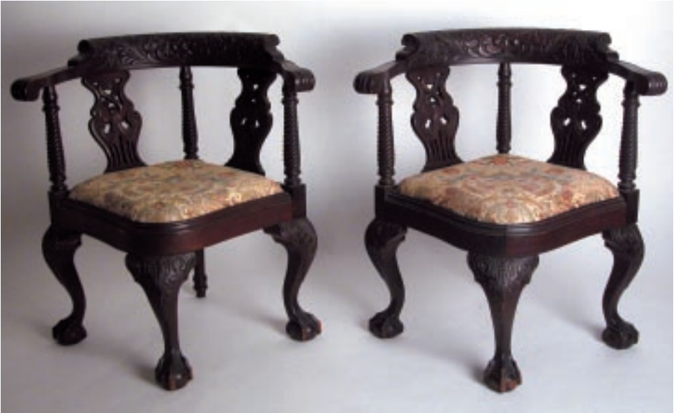
13. PAIR OF AMERICAN CENTENNIAL CHIPPENDALE STYLE CARVED MAHOGANY CORNER CHAIRS , last quarter of the 19th Century, slip seats. Height 31 in. Depth 24 in.