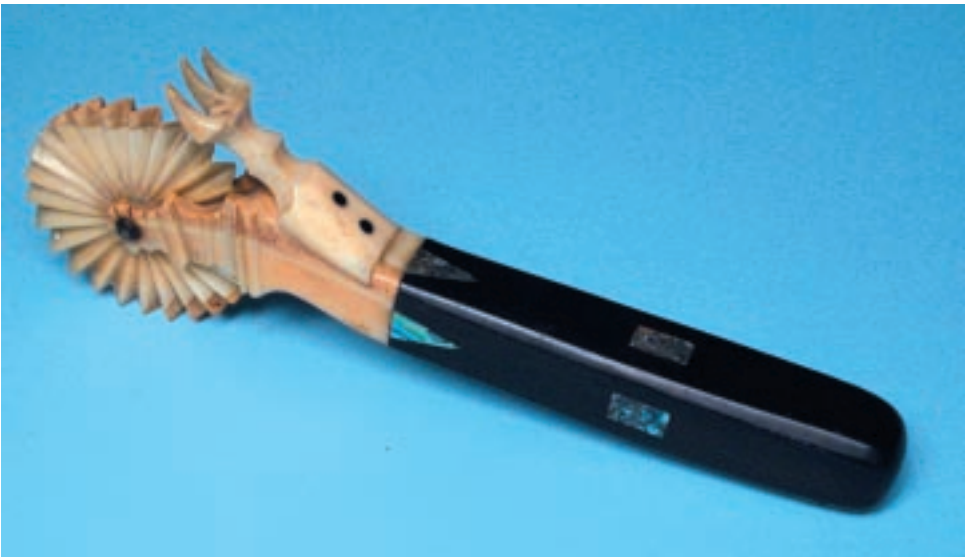
8. IVORY AND EBONY HANDLE PIE CRIMPER, mid 19th Century, with abalone inlaid handle. Length 6 ¼ in.