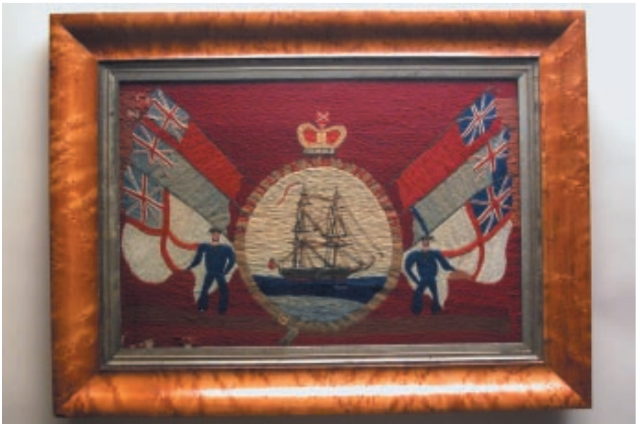
27. ENGLISH SAILOR'S WOOLIE, circa 1860, six flags with sailors and phrase " God Defend the Right " surrounding a ship cameo, in period bird's eye maple frame. 13 in. x 19 in.