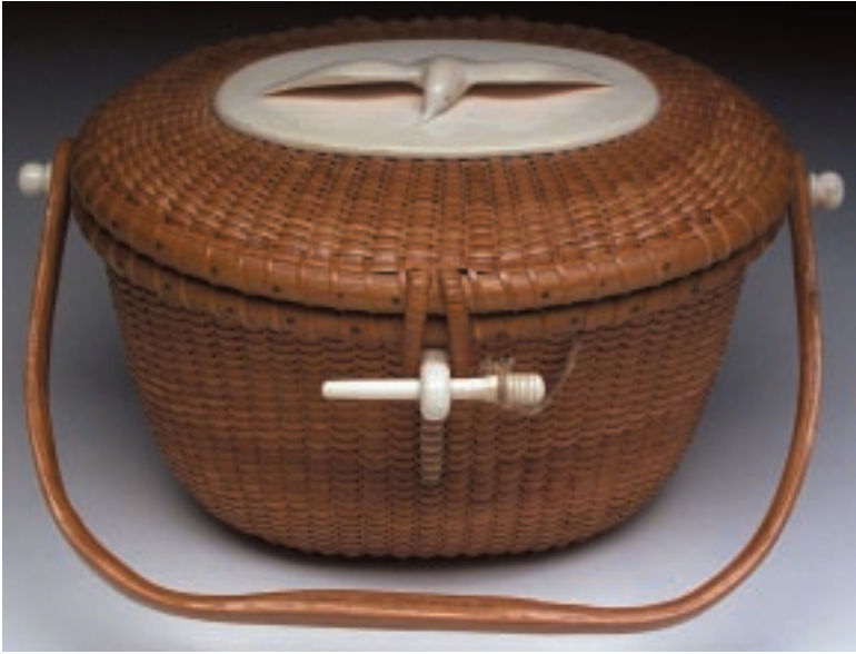
11. JOSE FORMOSO REYES FRIENDSHIP BASKET , circa 1965, evening basket with ivory plaque mounted with flying seagull, ivory peg and knobs, inscribed on bottom, Made in Nantucket, Jose Formoso Reyes. Height 5 ½ in. Width 8 ¼ in. Depth 6 ½ in.