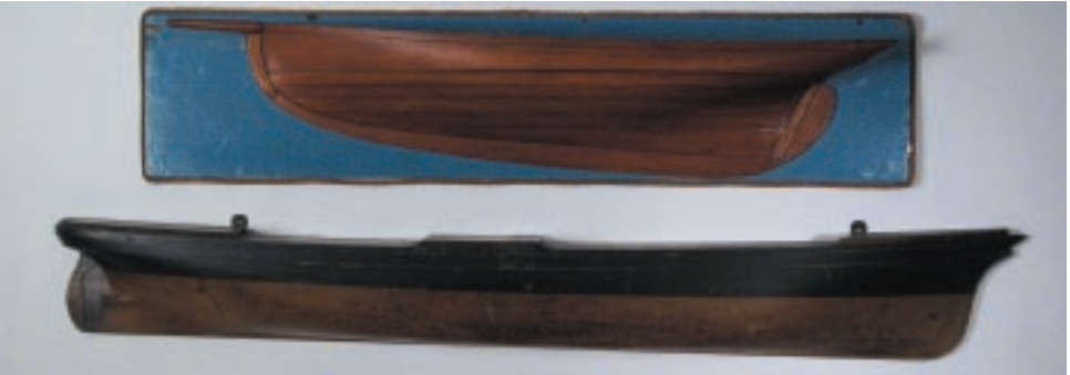
20. THOMAS A. IRVING MADE HALF MODEL OF THE 52' VESTA FISHING SLOOP , built in Gloucester 1898-99, accompanied by Yachting Magazine from 1933. Height 10 \frac{1}{2} in. Width 45 \frac{1}{2} in. Depth 5 \frac{1}{2} in.