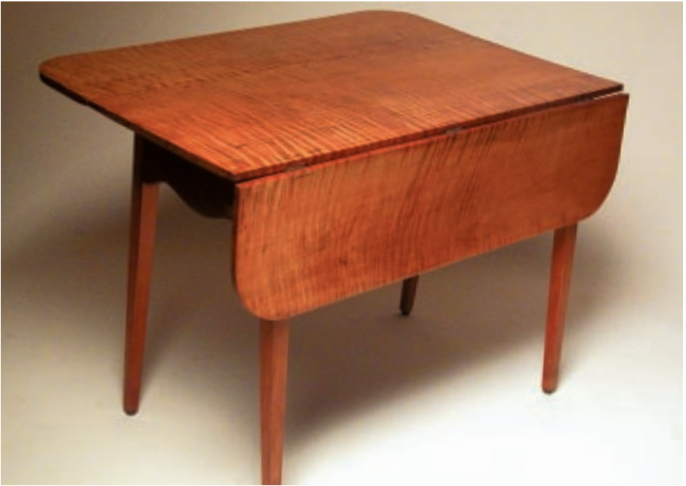
9. AMERICAN TIGER MAPLE DROP LEAF TABLE, circa 1800 , rounded corners and shaped apron. Height 28 in. Width 41 in. Depth 18 ½ in.