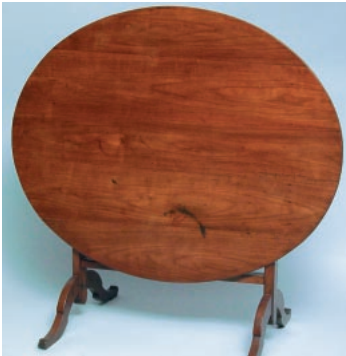
16. FRENCH PEARWOOD WINE TASTING TABLE, mid 19th Century. Height 28 ½ in. Length 46 ¼ in. Width 37 in.