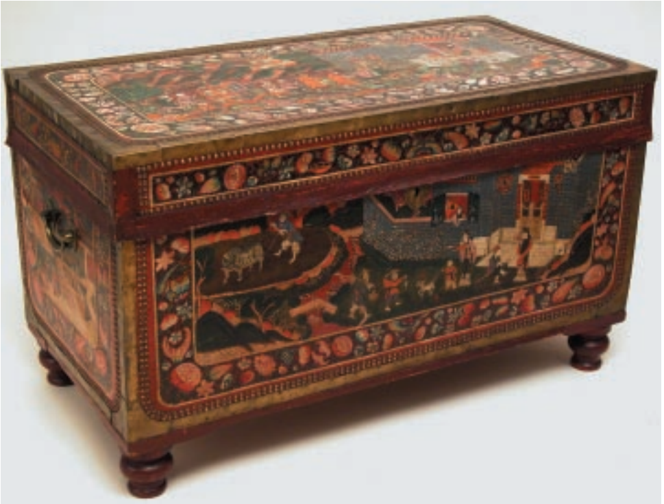
28. RARE CHINA TRADE DECOUPAGE AND PAINTED CAMPHORWOOD TRUNK, circa 1830 , brass bound with carrying handles, leather covered rectangular box on turned feet. Height 26 in. Width 44 in. Depth 22 in.