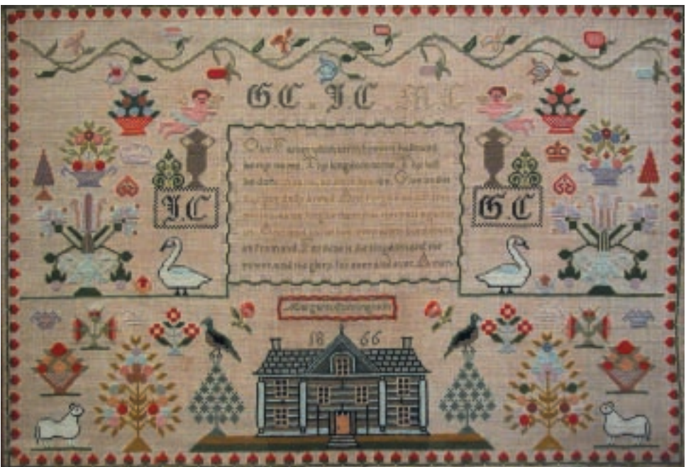
6. ENGLISH SAMPLER , Margaret Cunningham, 1866, in period rosewood frame. 17 ¾ in x 25 ¾ in.