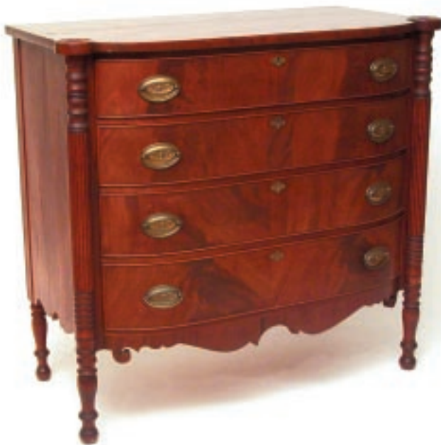
18. MASSACHUSETTS SHERATON MAHOGANY BOWFRONT CHEST OF DRAWERS, circa 1825, with ¾ columns, inscribed on reverse: "H.A. Willard, Nantucket, Mass." Height 40 ½ in. Width 43 ½ in. Depth 21 ¾ in.