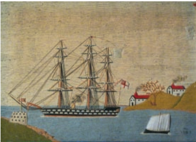
25. ENGLISH FOLK ART WOOLIE OF A BRITISH THREE-MASTED MAN OF WAR, initialed and dated lower right W.L., 1787. 12 ½ in. x 17 in.