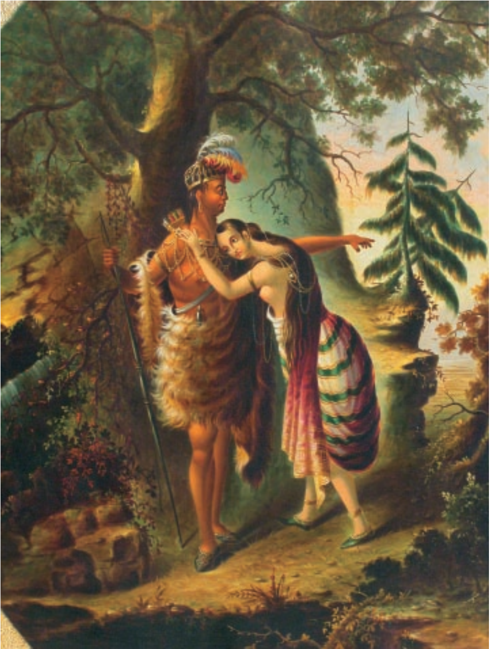
80. PAINTING, INDIAN AND MAIDEN IN LANDSCAPE SETTING , W. SEAMANS (19th Century), oil on canvas, signed lower right W. Seamans, 1875. 36 in. x 29 in.