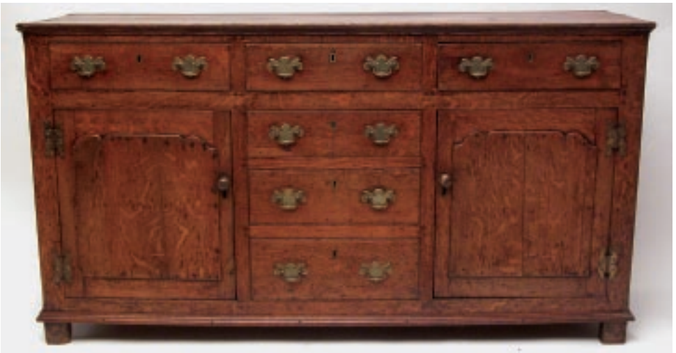
76. ENGLISH CARVED OAK SIDEBOARD, 18th Century, with four drawers over two cupboard doors, original engraved brasses. Height 35 ½ in. Width 66 ¼ in. Depth 20 in.