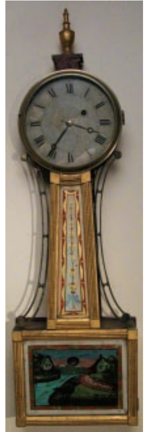
82. AMERICAN MAHOGANY BANJO CLOCK, circa 1820. Height 33 in. Width 10 in. Depth 4 in.