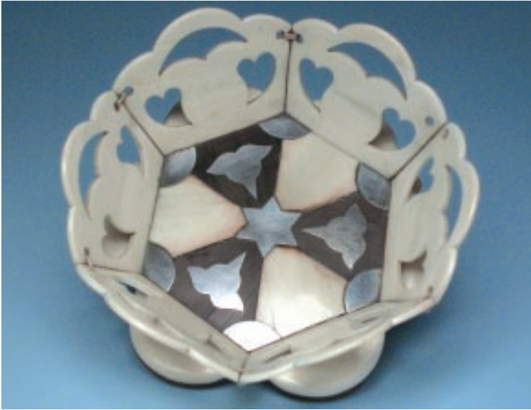
73. RARE SAILOR MADE WHALE IVORY, EBONY AND SILVER SEWING BASKET, mid 19th Century, with heart cutouts. Height 2 ¼ in. Diameter 5 ⅞ in.