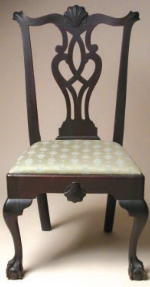
78. PHILADELPHIA CHIPPEN- DALE WALNUT SIDE CHAIR, circa 1760, original finish and matching rail and seat carved shells. Height 40 ½ in. Seat Height 18 ½ in.