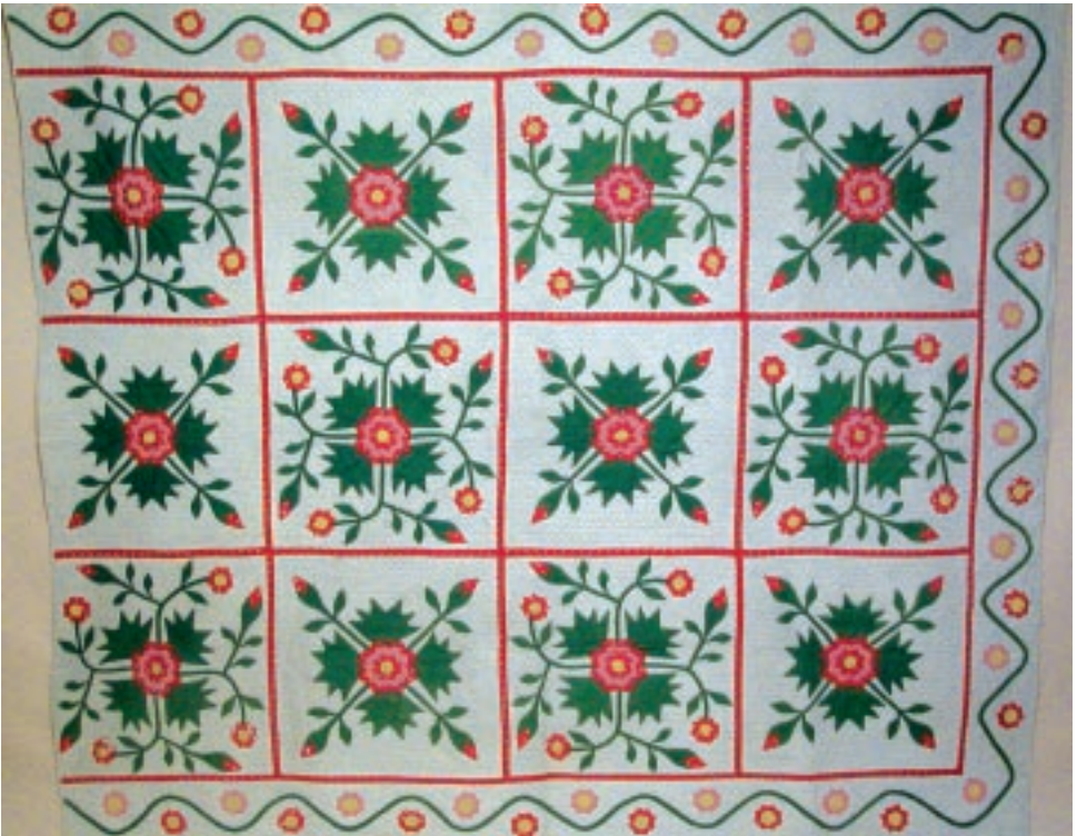
74. PENNSYLVANIA FLORAL APPLIQUE QUILT, circa 1860, in shades of red and green on ivory ground. 90 in. x 76 in.