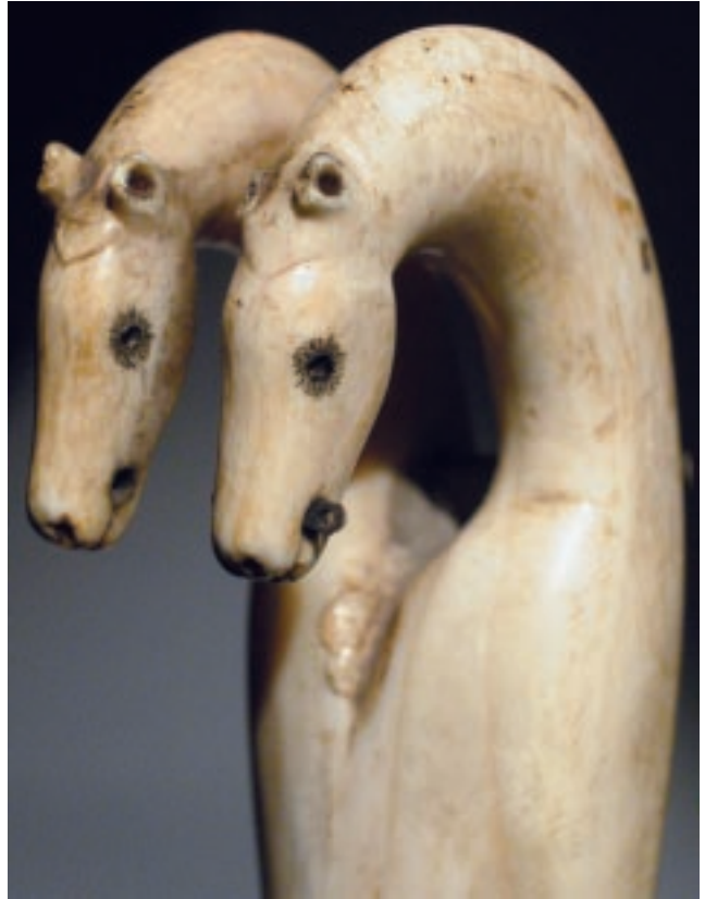
65. RARE SAILOR MADE DOUBLE SEAHORSE HEAD WALKING STICK, circa 1850, hand grip and spacer of whale's tooth, two ebony spacers and tapering turned whalebone shaft.