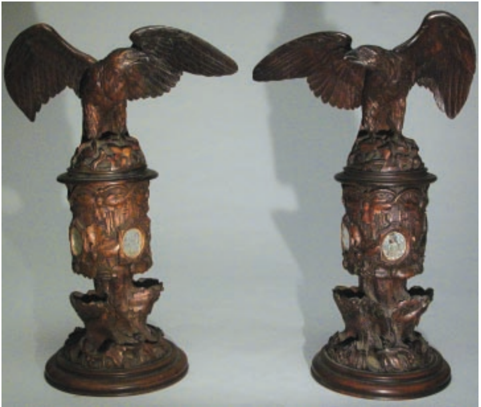
77. PAIR OF FINELY CARVED BLACK FOREST CANISTERS , depicting spread wing eagles on foliage carved and mirrored canisters, circa 1880. Height 23 in. Width 13 ½ in.