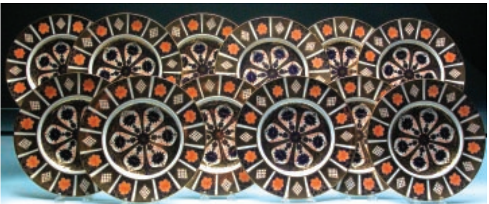
88. SET OF TWELVE ROYAL CROWN DERBY DINNER PLATES, circa 1930. Diameter 10 ½ in.