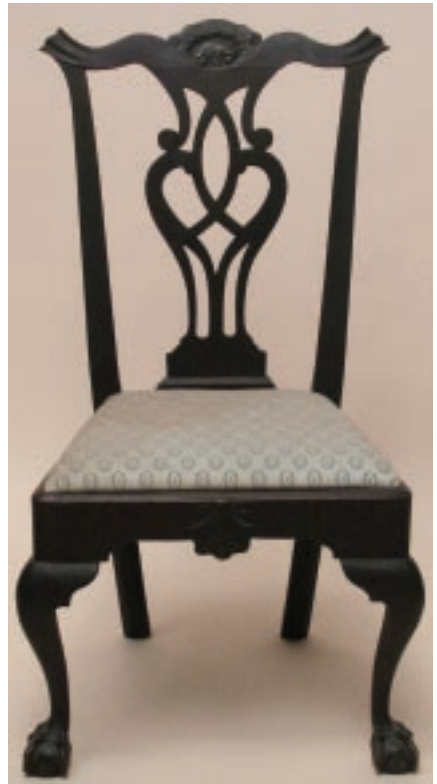
79. PHILADELPHIA CHIPPENDALE WALNUT SIDE CHAIR, circa 1760, original finish and carved seat shell. Height 40 ½ in. Seat Height 18 in.