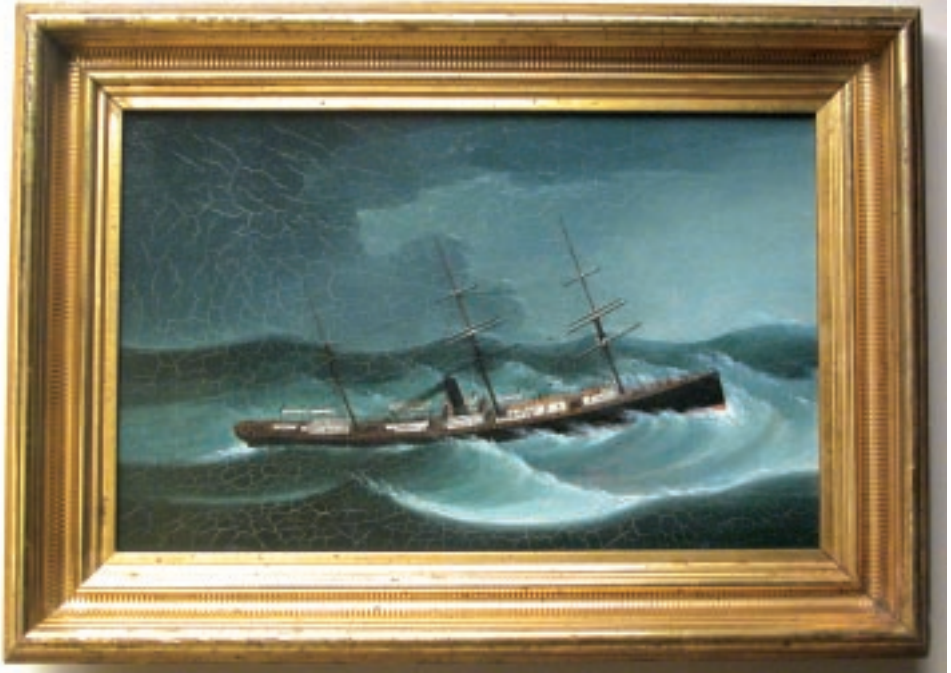
64. FINE PAIR OF CHINA TRADE PORTRAITS OF THE SHIP CITY OF SYDNEY , circa 1875, oils on artist board; The City of Sydney was built by John Roach & Son, Ship Builders in Chester, Pennsylvania. The ship operated between California and the Orient for the Pacific mail line. In original lemon gilt frames. 8 in. x 12 ½ in.