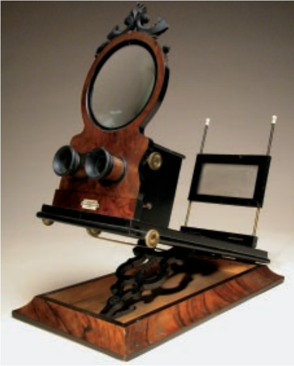
81. FRENCH ROSEWOOD CARD VIEWER BY E. ZIEGLER, R des Capucines 35 Paris, circa 1880, rosewood, walnut and ebony stand with both a stereoscopic and studio card viewer. Base 19 in. x 10 ½ in.