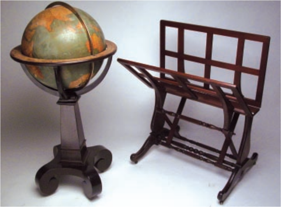
84. 18 INCH TERRESTRIAL GLOBE BY W. & A.K. JOHNSTON, GEOGRAPHERS & ENGRAVERS, EDINBURGH, circa 1870, on mahogany pedestal stand. Height 46 in.