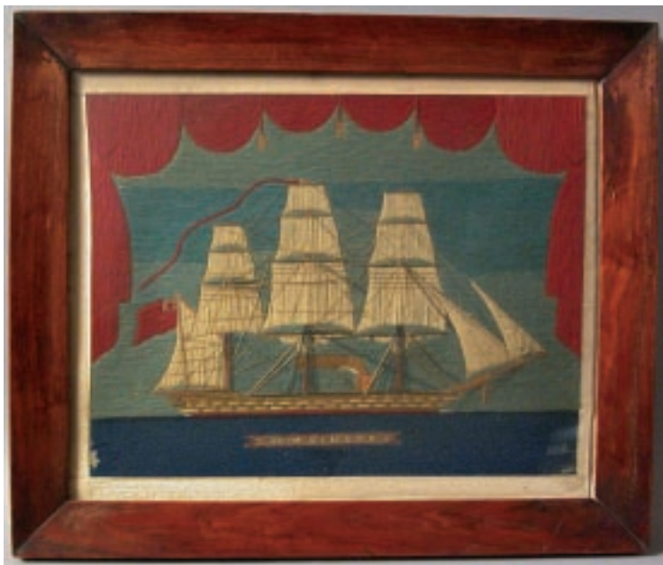
88a. ENGLISH SAILOR'S WOOLIE, 19th Century , portrait of the H.M.S. Hero within curtain swags and tassels. 14 in. x 18 in.