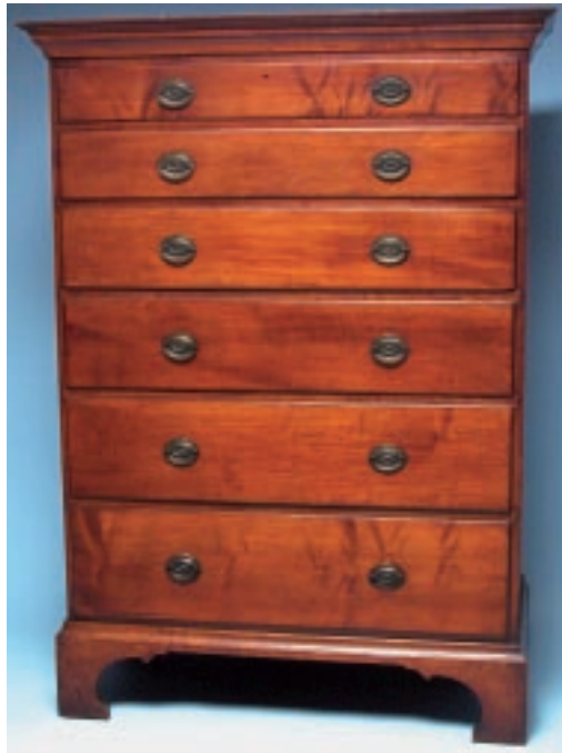
103. AMERICAN CHIPPENDALE CHERRY GRADUATED TALL CHEST OF SIX DRAWERS , circa 1780, with original brasses. Height 55 ½ in. Width 40 in. Depth 20 in.