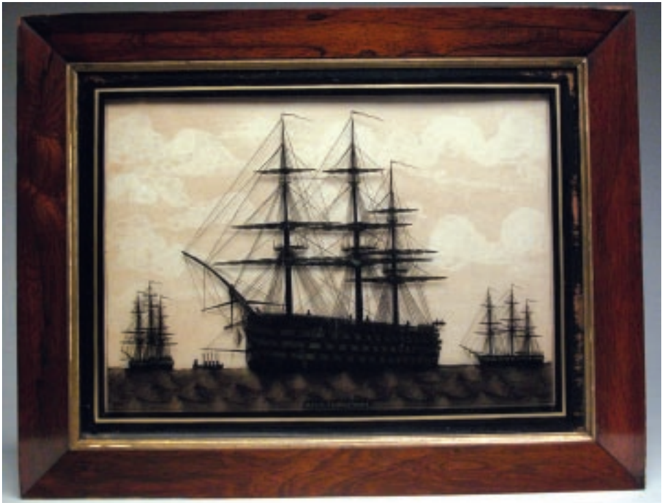
89. REVERSE PAINTING ON GLASS OF THE GUN SHIP "H.M.S. FOUAROY-ANT", early 19th Century, in period rosewood frame. 12 ½ in. x 18 in.