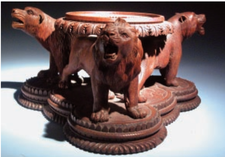
99. BLACK FOREST CARVED WALNUT TRI-ANIMAL BOWL STAND, circa 1890. Height 7 ½ in. Diameter 16 in.