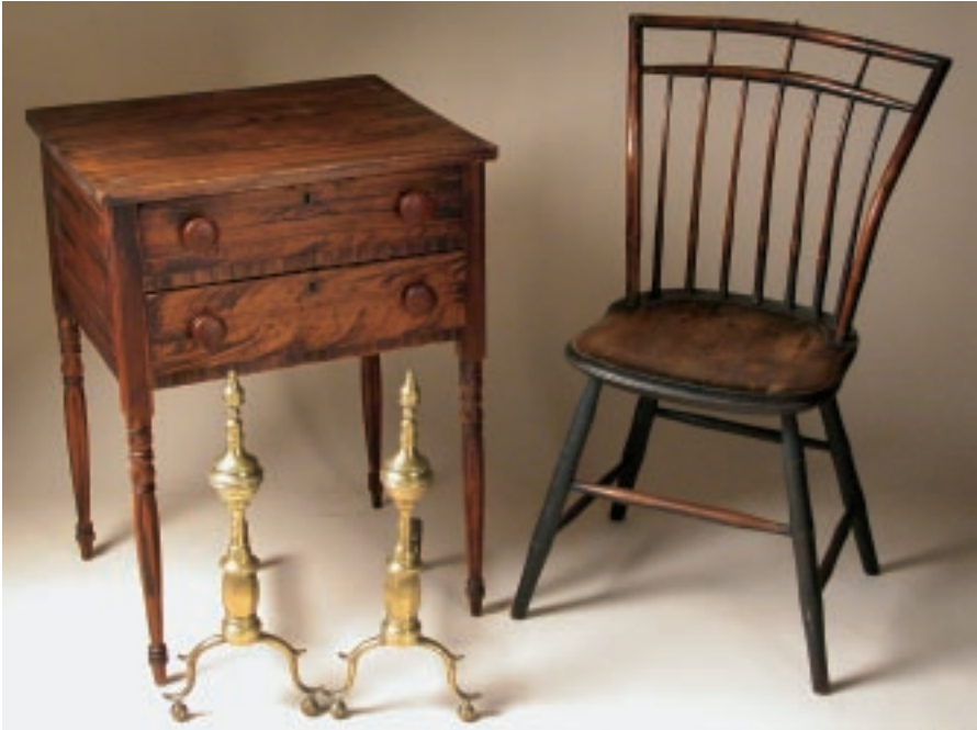
91. AMERICAN SHERATON GRAIN DECORATED TWO-DRAWER WORK STAND, circa 1820-30. Height 29 in. Width 22 in. Depth 17 \frac{3}{4} in.