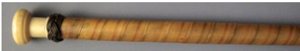
88b. RARE BALEEN WRAPPED CANE WITH WHALE TOOTH TURNED KNOB, circa 1850 , with baleen Turk's turban knot collar.