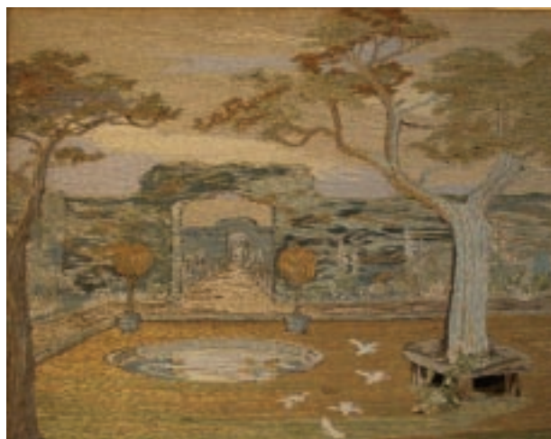
88c. ENGLISH EMBROIDERY ON LINEN "GARDEN ARBOR", 19th Century , initialed lower right. 8 in. x 9 ½ in.