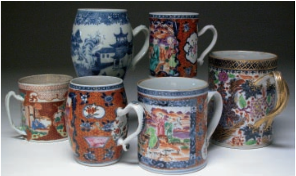
106. COLLECTION OF SIX CHINESE EXPORT MUGS, 18th Century. Smallest: Height 4 ¼ in. Diameter 3 ¼ in. Largest: Height 6 in. Diameter 4 ¾ in.