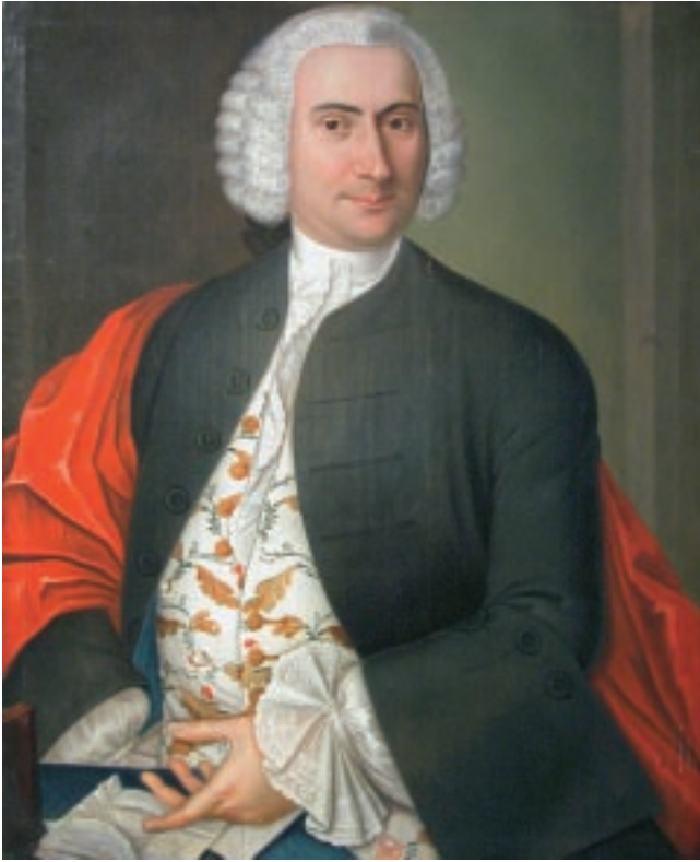
105. PAINTING, PORTRAIT OF AN ARISTOCRATIC GENTLEMAN , CONTINENTAL SCHOOL, dated 1754. 35 ¼ in. x 28 ½ in.