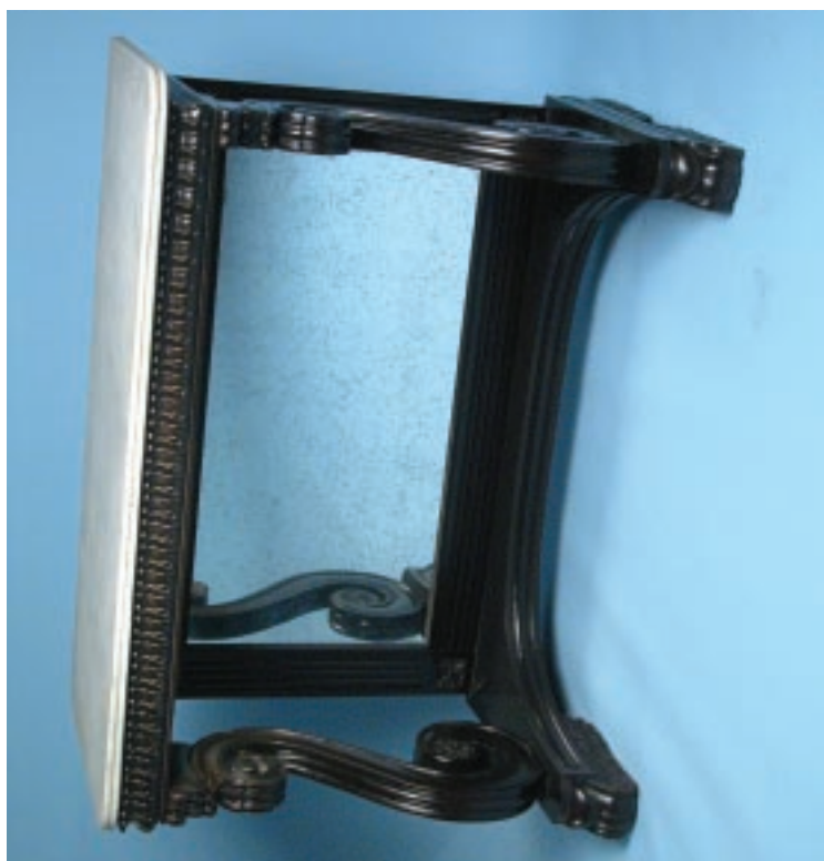
108. FINE AND RARE MATCHED PAIR OF ANGLO-INDIAN CARVED ROSEWOOD PIER TABLES, circa 1820, with white marble tops and double reeded edges, mirrored backs. Height 33 in. Width 44 ½ in. Depth 19 in.