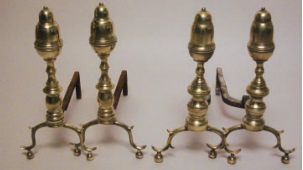
104b. PAIR OF ACORN-TOP BRASS ANDIRONS, circa 1800. Height 20 in.