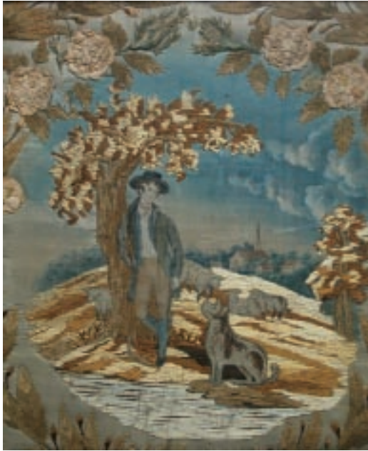
88d. ENGLISH NEEDLEWORK PORTRAIT OF A SHEPHERD BOY, circa 1820 , silk floral surround with fabric rosettes and watercolor on silk of shepherd, flock, dog, and landscape. 15 ¼ in. x 13 in.