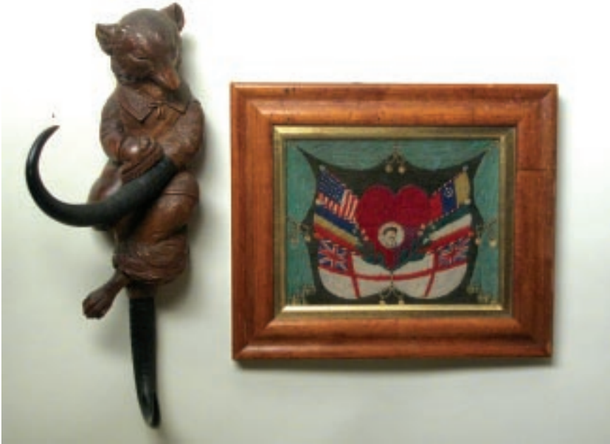
100. BLACK FOREST CARVED WALNUT AND HORN HANGING FOX BRIDLE HOOK, circa 1880. Length 13 ½ in.