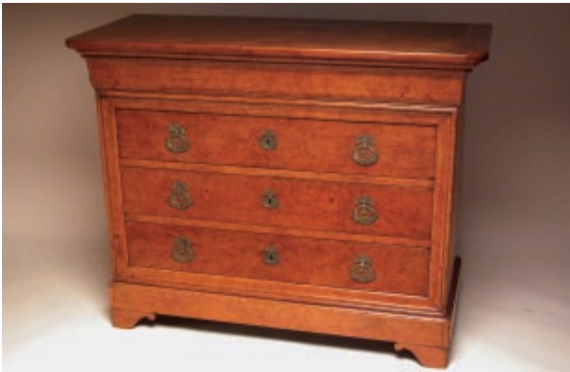
97. LOUIS PHILIPPE BURL WALNUT CHEST OF DRAWERS, circa 1870. Height 37 ½ in. Width 47 in. Depth 20 ¼ in.