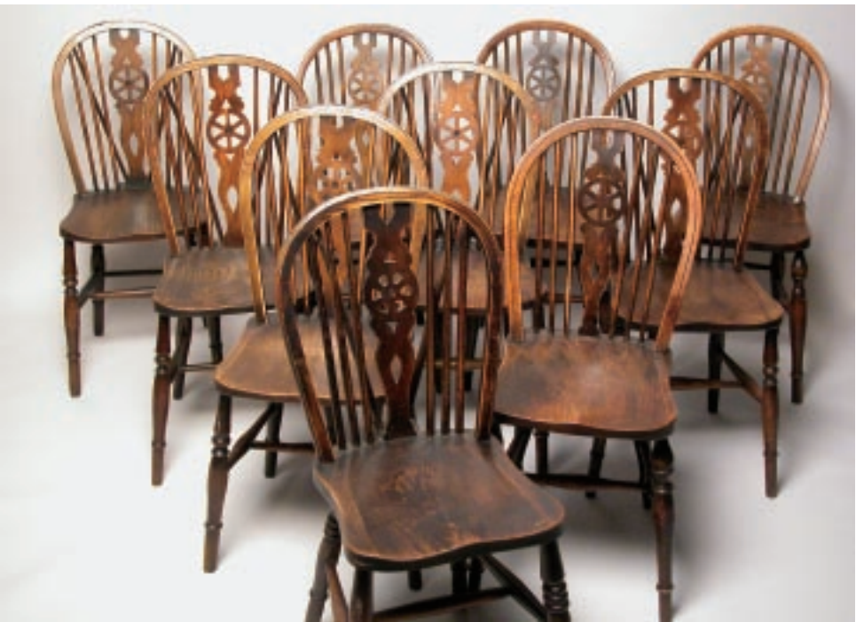
104d. ASSEMBLED SET OF TEN ENGLISH ELM WHEEL-BACK DINING CHAIRS, 19th Century.