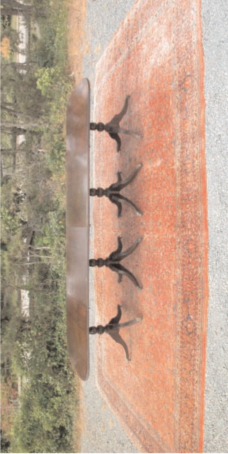
104e. ENGLISH REGENCY FOUR-PEDESTAL MAHOAGANY DINING TABLE WITH BURL-WALNUT BAND REEDED EDGE, early 19th Century, with vase turned pedestals, fluted swooping legs, terminating in bronze paw casters. Height 29 ½ in. Length 160 ½ in. Width 47 ¾ in.