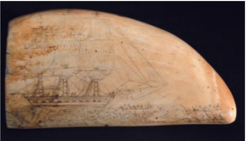
110. IMPORTANT ENGRAVED WHALE TOOTH, 19th Century , engraved with Starboard view of an American whaleship with two longboats engaged in battle with a sperm whale; the reverse with port view of the same ship and two longboats amongst several sperm whales, circa 1830. Length 6 ¾ in. Width 3 ⅝ in.