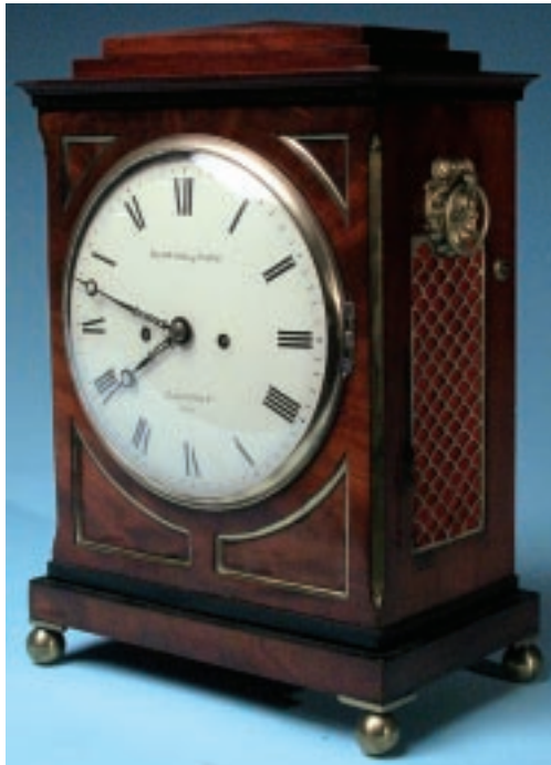
88e. ENGLISH REGENCY STEPPED TOP BRACKET CLOCK BY BARWISE & SONS, LONDON (1819-1823) . Height 16 in. Width 11 ¼ in. Depth 7 in.