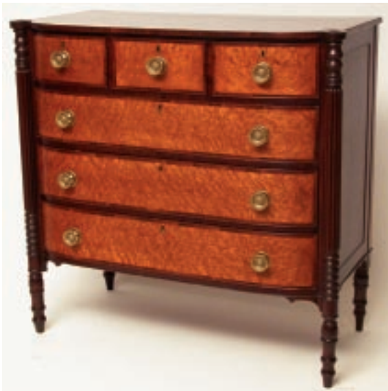
90. AMERICAN SHERATON BOWFRONT MAHOGANY CHEST OF DRAWERS, circa 1820, with bird's-eye-maple drawer fronts and cookie corners. Height 40 ½ in. Width 42 in. Depth 20 ½ in.