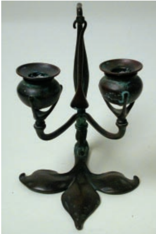
104i. TIFFANY STUDIOS FLEUR-DE-LIS GREEN PATINA DOUBLE CANDLESTICK , with snuffer, inscribed on base Tiffany Studios, New York 1232. Height 8 \frac{3}{4} in.