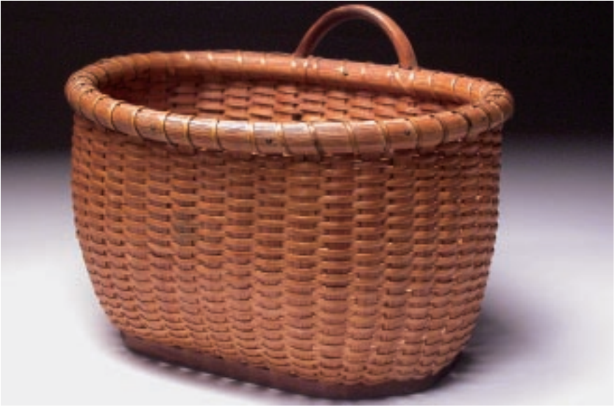
104h. RARE JOSE FORMOSO REYES MAIL BASKET , with single carved wood handle.