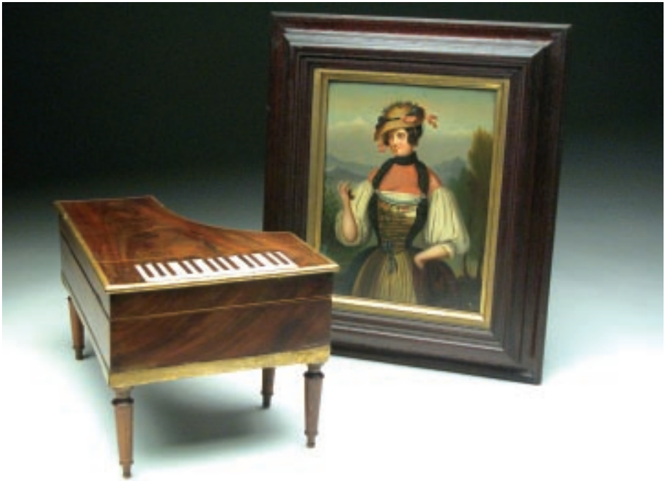
95. EUROPEAN MAHOGANY AND IVORY PIANO FORM BOX, circa 1830. Height 6 ½ in. Length 11 ½ in. Depth 7 ¼ in.