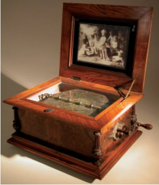
141. GERMAN BURLWOOD CARVED AND INLAID SYMPHONION , circa 1880, Schutz-Marke double comb music box playing 12" discs, housed in a burlwood and walnut box, complete with 12 extra discs. Height 10 in. Width 19 ¼ in. Depth 16 in.