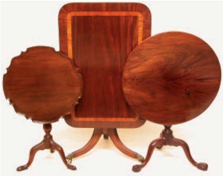
127. GEORGE III MAHOGANY TEA TABLE, circa 1820, two board mirrored mahogany tilt top. Height 28 in. Diameter 31 ½ in.