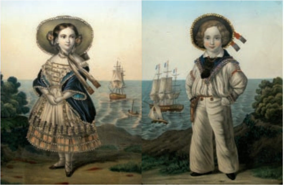
144. PAIR OF CONTINENTAL DECOUPAGE HANDCOLORED LITHOGRAPHS, 19th Century , depicting sailor boy and young girl by seaside titled “Feodora” and “Derkleine Matrose” in period reverse painted glass and carved wood gilt frames. 12 in. x 9 in.