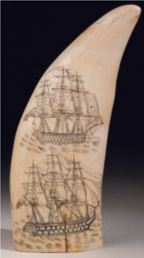
132. ENGRAVED WHALE TOOTH, 19th Century , depicting two frigates in full sail, circa 1845. Height 5 ½ in.

Provenance: Barbara Johnson Whaling Collection: Part II, Lot #489