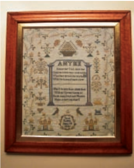
136. ENGLISH SAMPLER , Sarah Rappel, her work at the age of 14, 1841, in period maple frame. 17 ¼ in. x 14 ½ in.