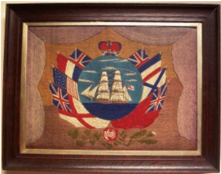
145. ENGLISH SAILOR WOOLIE, circa 1870 , eight flags flanking a ship cameo within a curtain swag. 13 ½ in. x 18 ½ in.