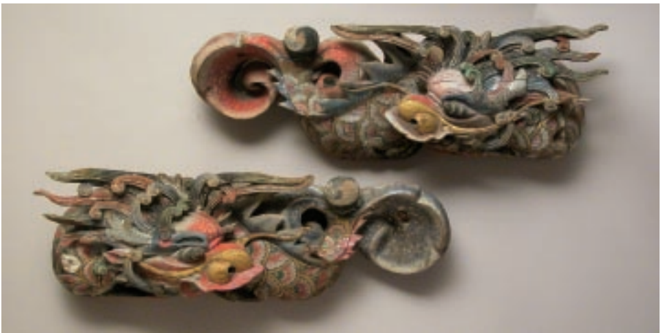
139. PAIR OF MING DYNASTY CARVED AND POLYCHROMED SEA DRAGON TEMPLE FIGURES, circa 1600. Height 11 ½ in. Length 39 in. Depth 8 in.