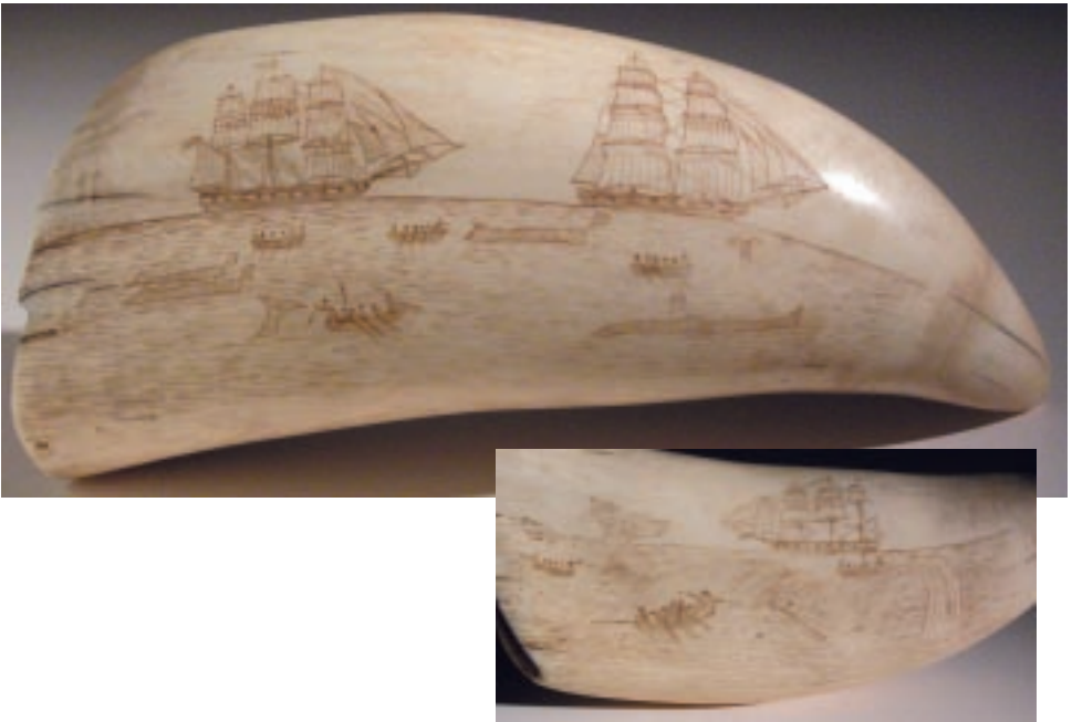
112. ENGRAVED WHALE TOOTH, 19th Century, two clipper ships and four longboats and a pod of whales; the reverse engraved with clipper ship and longboat with a group of whalers cutting into a spouting whale. Length 7 ¼ in.