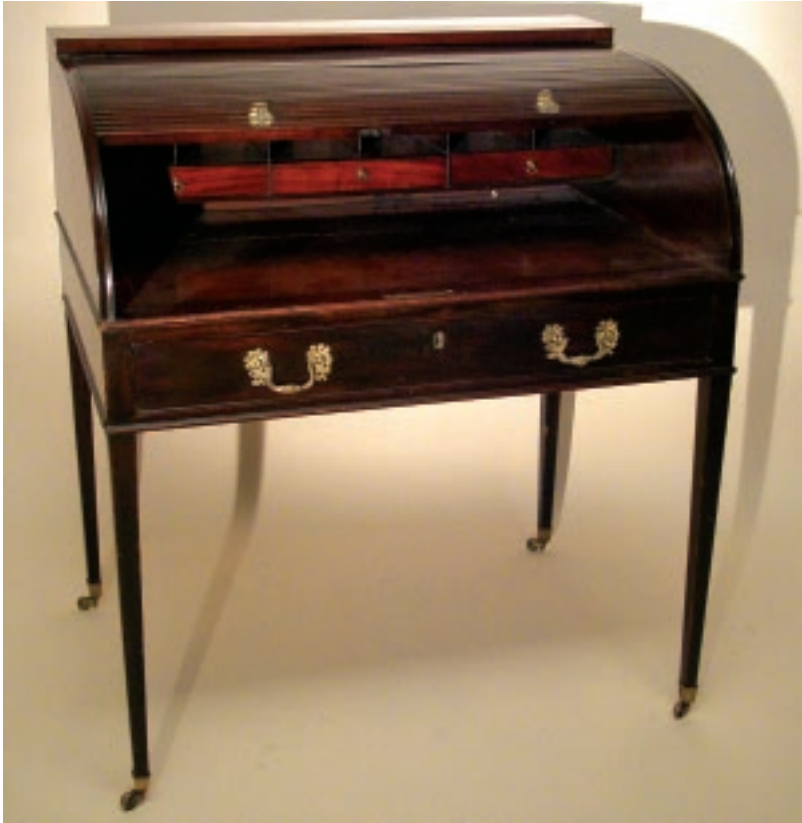
138. GEORGE III CARVED MAHOGANY TAMBOUR TOP WRITING DESK, circa 1790-1800, with fitted interior, raised on square tapering legs with brass cup casters. Height 41 in. Width 36 in. Depth 26 in.