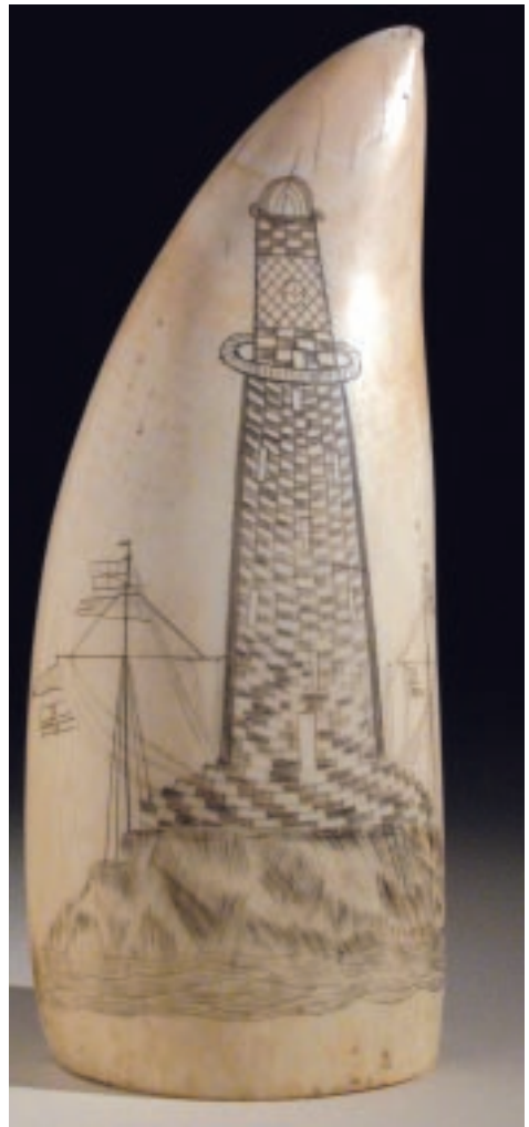
133. ENGRAVED WHALE TOOTH, 19th Century , depicting the Eddystone Lighthouse off the coast of Plymouth, England; The masts of two whaling ships in background; the sea wraps around side of tooth and reverse has stern view of English whaling ship. Height 6 ½ in.

Provenance: Barbara Johnson Whaling Collection: Part II, Lot #489