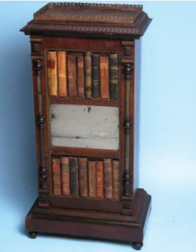
125. FAUX BOOK DOOR SIDE TABLE, 19th Century. Height 40 in. Width 20 in., Depth 11 ½ in.