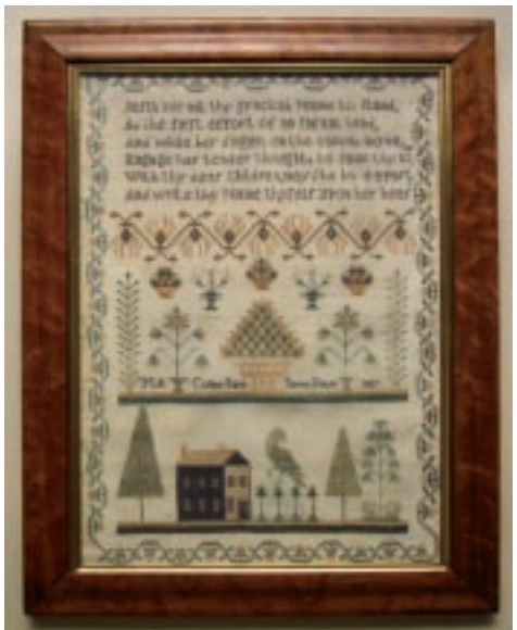
137. ENGLISH SAMPLER , M.A. Colley, her work at the age of 7, 1807, in period bird's eye maple frame. 15 ½ in. x 11 ½ in.