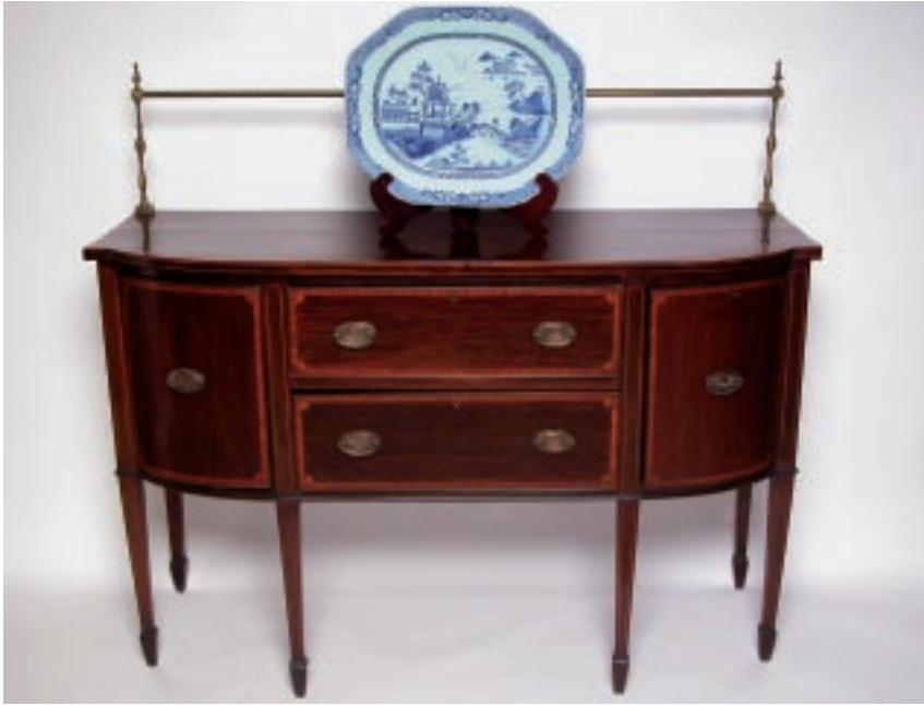
118. ENGLISH GEORGIAN STYLE MAHOGANY BOWFRONT SIDEBOARD, 19th Century, with quarter-fan inlay and brass linen rail. Height 39 in. Width 60 in. Depth 22 ½ in.