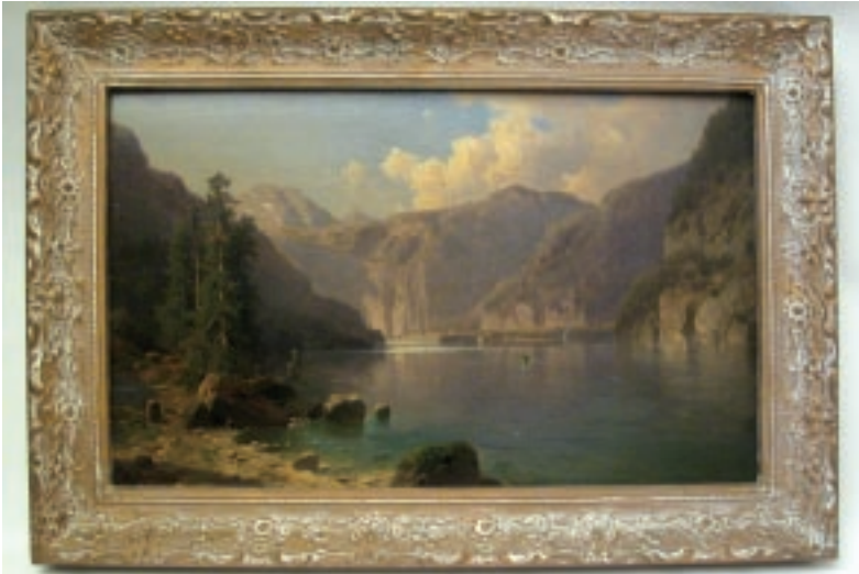
142. PAINTING, AUSTRIAN LAKE SCENE , late 19th Century, signed lower left A. Chuala. 11 ½ in. x 18 ½ in.