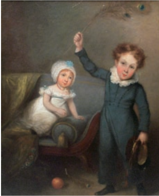
120. PAINTING, YOUNG BOY WITH PEACOCK FEATHER AMUSING HIS YOUNG SISTER , mid 19th Century, in period gilt frame. 18 ¼ in. x 14 ¾ in.