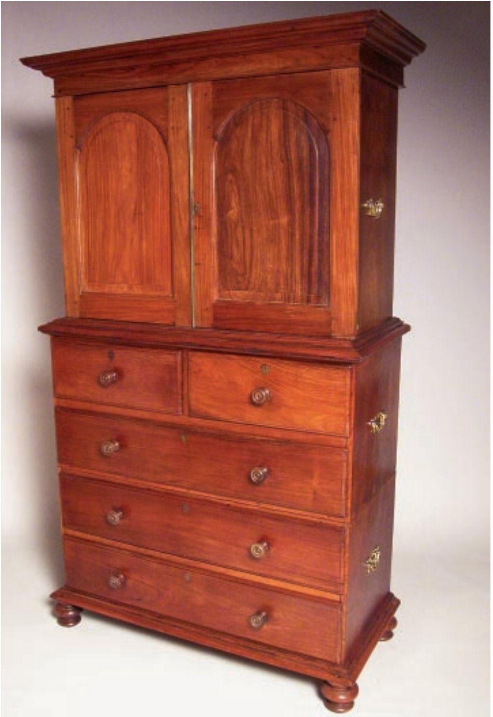
143. ANGLO-INDIAN CAMPHORWOOD GARMENT CHEST, 19th Century , in three sections with two interior cupboard drawers and shelf. Height 85 ½ in. Width 48 ½ in. Depth 22 in.