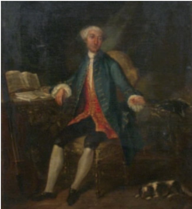
117. PAINTING, COMPOSER AND HIS DOG , 18th Century, oil on canvas in period gilt frame. 24 ½ in. x 19 ¼ in.