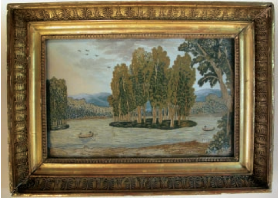
140. PAIR OF EXCEEDINGLY FINE FRENCH NEEDLEWORK AND PAINTED RIVERSCAPES, circa 1820, in period gilt frames. 8 ¼ in. x 12 ¼ in.