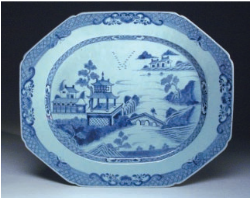
119. CHINESE EXPORT BLUE AND WHITE MEAT PLATTER, circa 1790. 19 ¾ in. x 16 ½ in.