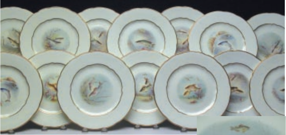
124. SET OF FOURTEEN COPELAND SPODE CHINA FISH PLATES , each plate with hand decorated cameos of different fish species and underwater foliage, all signed by artist J. Fenn. Diameter 9 ½ in.