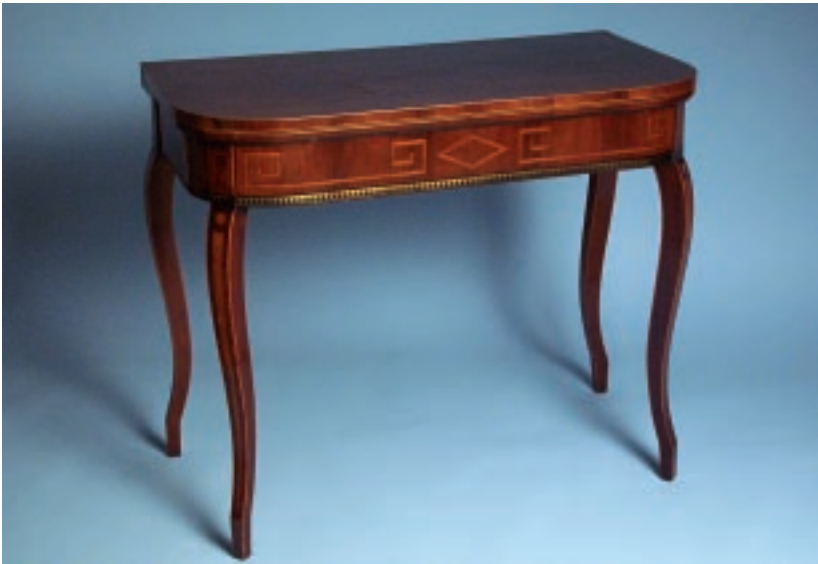
121. WILLIAM IV BRASS AND WOOD INLAID GAME TABLE, circa 1840, with felt interior surface. Height 29 ½ in. Width 35 in. Depth 17 ¾ in.