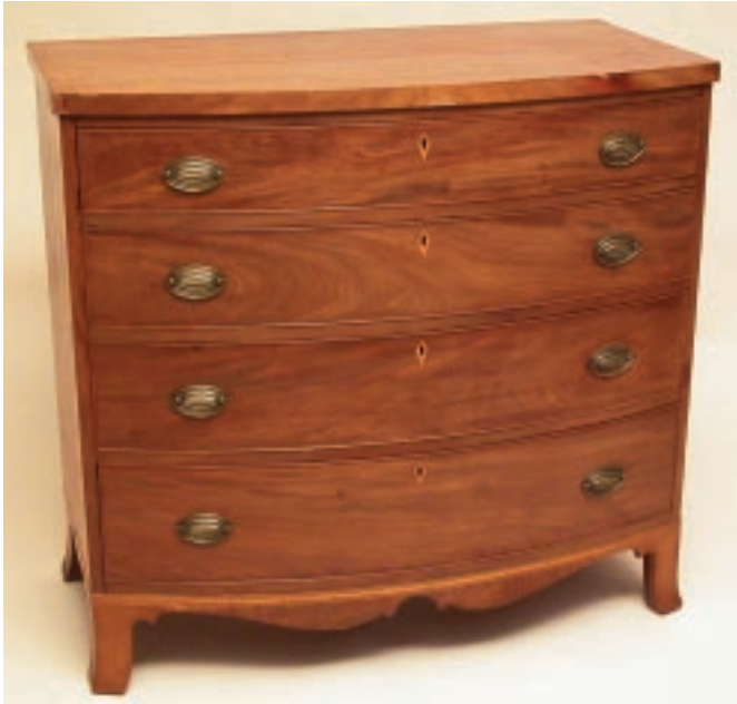
116. AMERICAN HEPPLERWHITE MAHOGANY BOWFRONT CHEST OF DRAWERS , circa 1790, with satinwood inlay. Height 38 ½ in. Width 41 ½ in. Depth 23 ½ in.