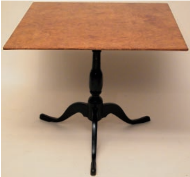
123. SWEDISH BURL WOOD TEA TABLE, circa 1820-30 , square top hinged to an ebonized snake foot tripod stand. Height 30 in. Width 35 ¼ in. Width 34 in.