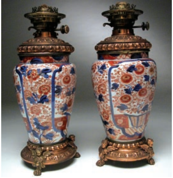
114. PAIR OF IMARI LAMP BASES, 19th Century. Height 17 in.