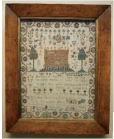
135. ENGLISH SAMPLER , Jemima Wadham, her work at the age of 6, 1810, in period bird's eye maple frame. 16 ¼ in. x 12 ¼ in.