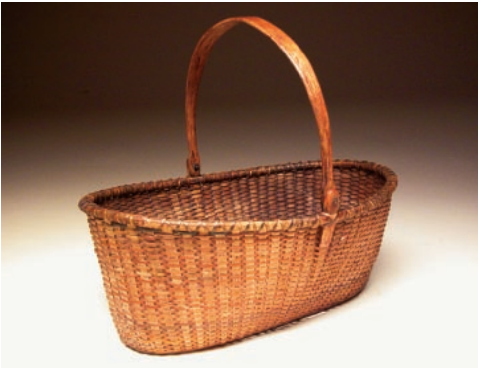
131. RARE FREE-FORM NANTUCKET LIGHTSHIP BASKET, circa 1860-1880, rectangular flaring form and carved wood ears. Height 6 ¼ in. Length 15 ½ in. Width 10 ¾ in.