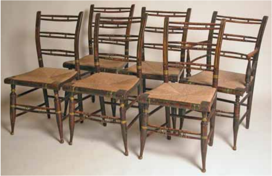
113. SET OF SIX AMERICAN SHERATON FANCY CARVED AND DECORATED DINING CHAIRS, circa 1820, rush seats.