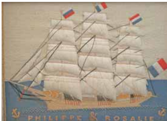
79. FRENCH SAILOR MADE WOOLIE, 19 th Century, depicting the "Philippe" and "Rosalie" with trapunto sails, in shadowbox frame. 17 in. x 22 \frac{1}{2} in.