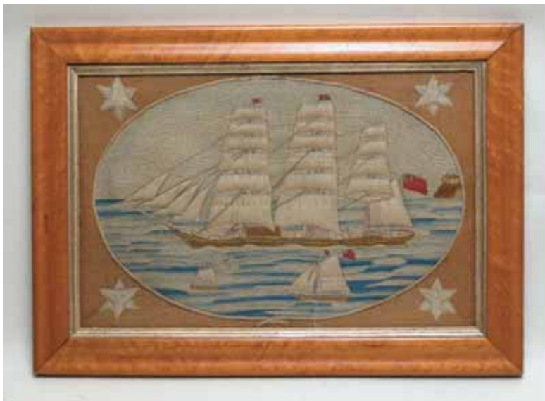
71. SAILOR MADE WOOLIE, 19 th Century, British clipper ship and two smaller vessels in an oval surround with stars, in bird's eye maple frame. 12 ½ in. x 19 ½ in.