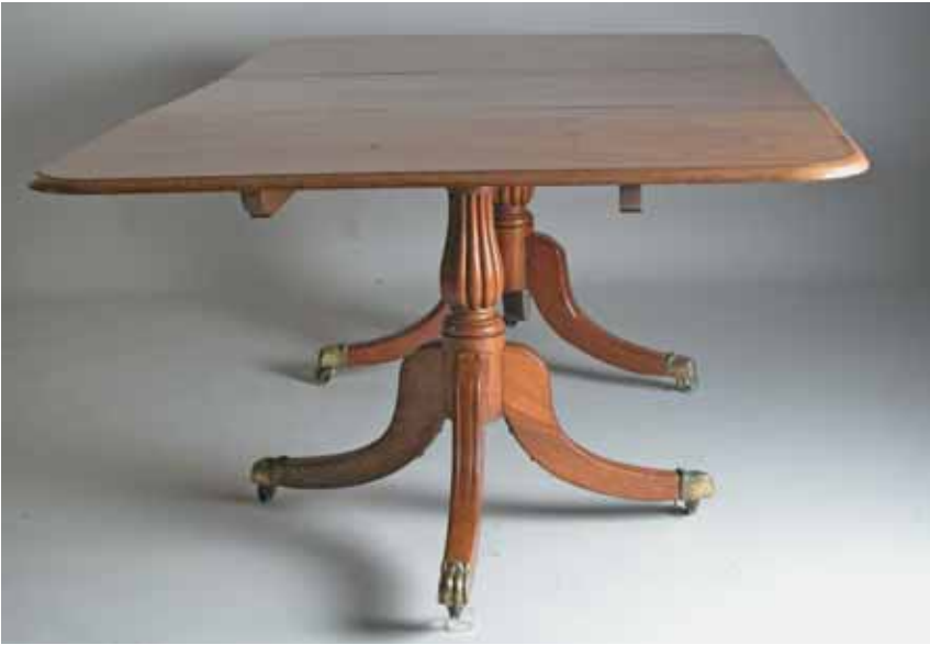
105. MAHOGANY CARVED DOUBLE PEDESTAL DINING TABLE, early 19 th Century, with one leaf. Height 28 \frac{3}{4} in. Length 70 in. (with one leaf) Width 47 in.