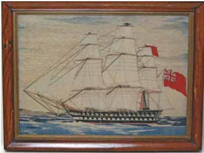
110. SAILOR MADE WOOLIE, 19 th Century, British Man-O-War flying the British flag, in rosewood and gilt frame. 17 ½ in. x 24 ½ in.