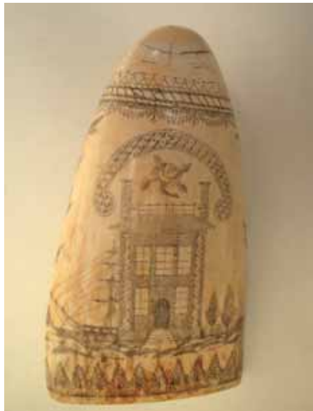
97. FINE BANK NOTE ENGRAVER'S SCRIMSHAW WHALE TOOTH , circa 1850, a formally dressed whaling Captain and companion on one side, the reverse engraved with Captain's mansion and ship with banner and single rose, possibly symbolizing the ship "Rose". All encompassed by elaborate upper and lower bands. Height 5 ¼ in.