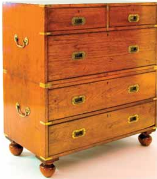
111. ENGLISH MAHOGANY CAMPAIGN CHEST OF DRAWERS, circa 1880, Army & Navy C.S.L. Makers, brass straps, corners and recessed pulls. Height 40 in. Width 39 in. Depth 18 in.