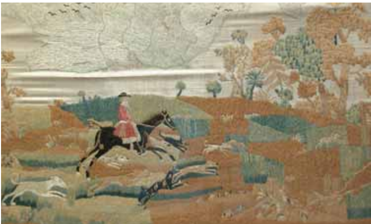
86. ENGLISH SILK EQUESTRIAN EMBROIDERY "MARY SHARMAN" HUNT SCENE, APRIL 4, 1787. 10 in. x 16 in.