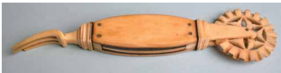
98. WHALE IVORY EAGLE PIE CRIMPER , circa 1850, Greek Key spoked wheel with opposing three-tine fork. Length 7 ½ in. Ex-collection: Norman E. Flayderman. Illustrated: " Scrimshaw and Scrimshanders, Whales and Whalers " p. 182.