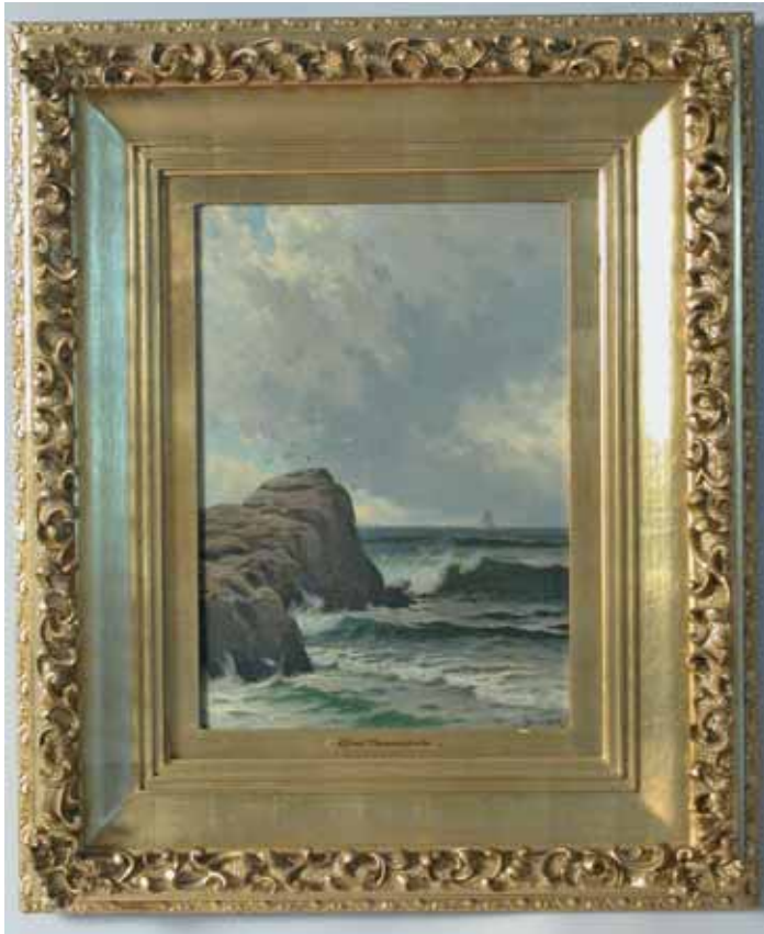
104. PAINTING, ALFRED THOMPSON BRICHER (AMERICAN 1837-1908) "ROCKY COASTLINE", oil on board, signed lower right A.T. Bricher. 13 \frac{3}{4} in. x 9 \frac{1}{2} in.