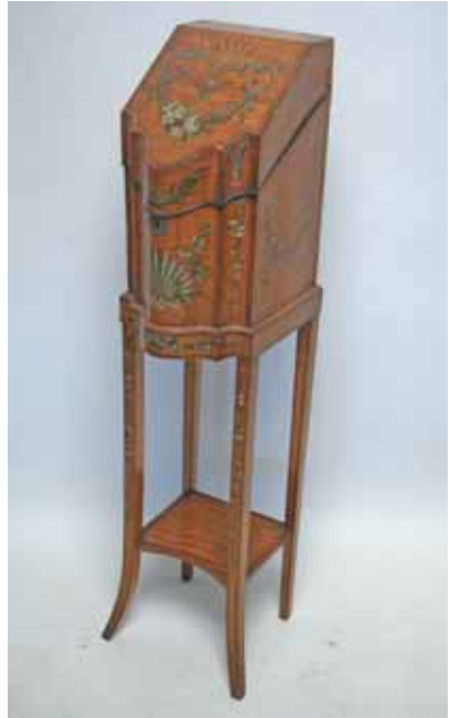
75. HEPPLEWHITE INLAID MAHOGANY SALESMAN'S SAMPLE CHEST OF DRAWERS, circa 1800, with ivory shield escutcheon and turned pulls. Height 10 \frac{3}{4} in. Width 13 \frac{1}{2} in. Depth 8 \frac{1}{2} in.