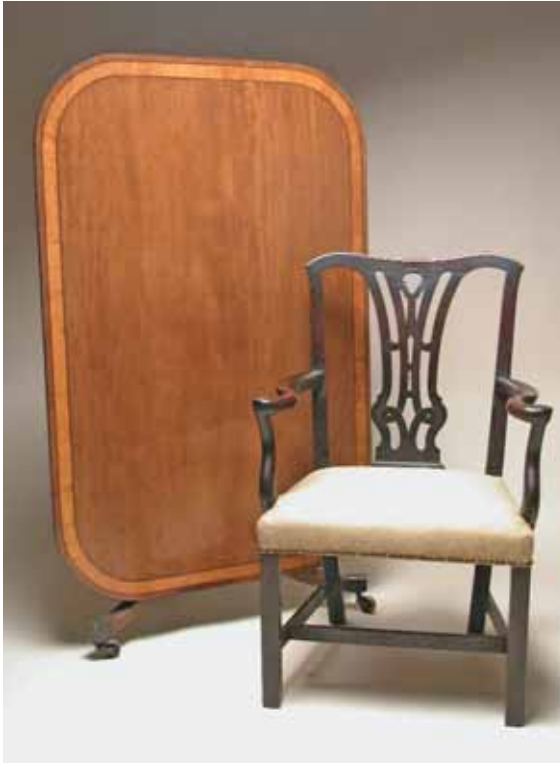
84. ENGLISH REGENCY BREAKFAST TABLE, circa 1820, rectangular mahogany top inlaid and cross-banded, reeded edge. Height 28 \frac{1}{4} in. Width 54 \frac{1}{2} in. Depth 36 in.