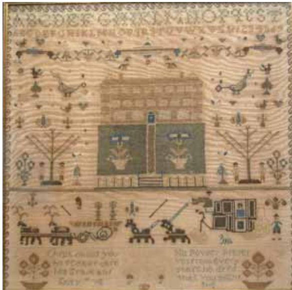
74. ENGLISH NEEDLEWORK SAMPLER , 1826, with school, house, carriage and figures. 20 in. x 20 in.