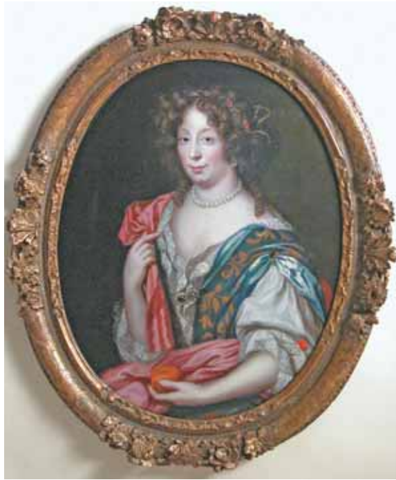
82. PAINTING, CONTINENTAL OVAL PORTRAIT OF A SEATED WOMAN , 18 th Century, oil on canvas of a woman wearing fancy clothes and pearls in floral gilt period frame. 40 in. x 33 in.