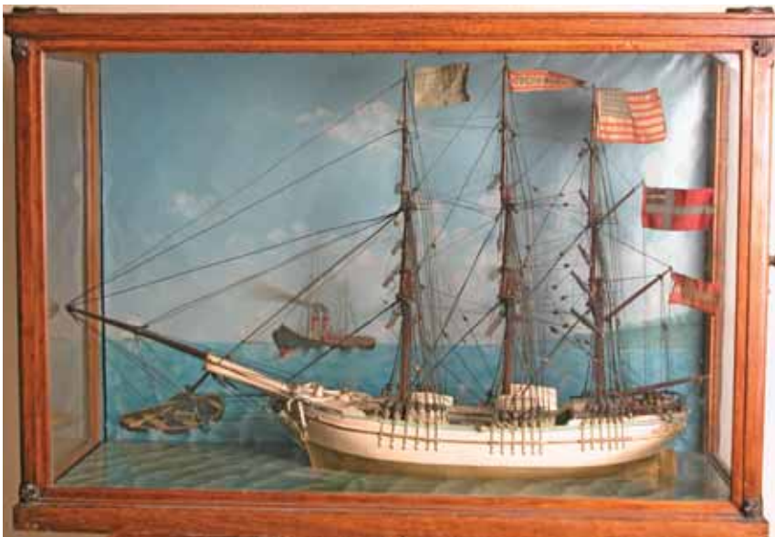
112. CASED FOLK ART MODEL OF THE "GOLDEN CLOUD", circa 1880, three masted waterline model on painted sea in front of active harbor scene. The oak case embellished with carved star rosettes at the corners. Height 27 in. Width 39 in. Depth 14 ½ in.