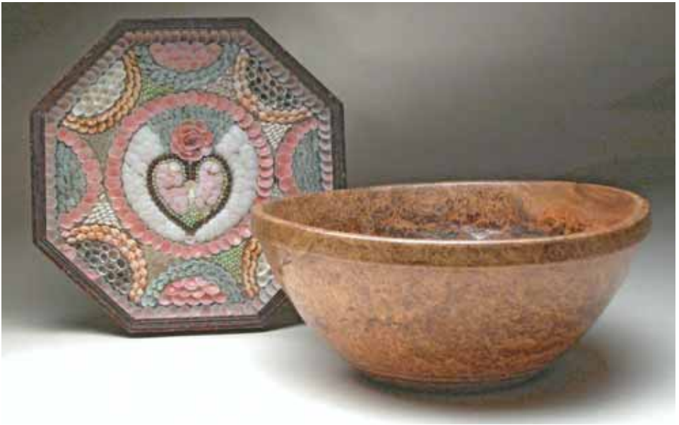
102. SAILOR'S VALENTINE, 2 nd half of the 19 th Century, shell collage with heart and flower motif. 14 in.