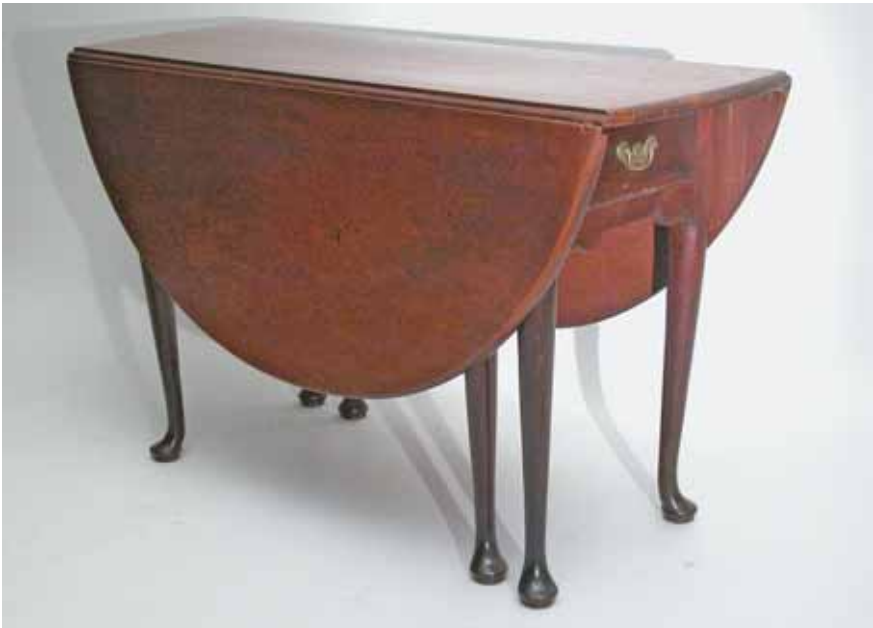
94. AMERICAN QUEEN ANNE DROP LEAF PETITE DINING TABLE, mid 18 th Century, with one drawer. Height 29 ½ in. Width 47 ¼ in. Depth 19 in.