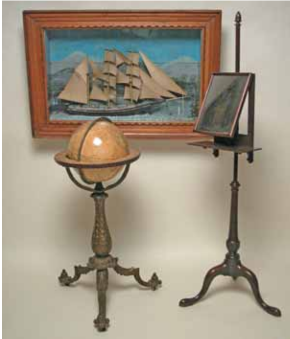
107. JOSLIN'S TERRESTRIAL FLOOR GLOBE, circa 1870, Boston, on fitted cast iron tripod stand. Height 39 in.