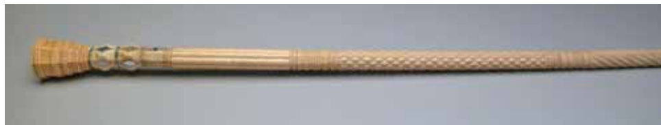
99. FINE WHALE IVORY AND WHALEBONE CAPTAIN'S WALKING STICK , circa 1850, carved ivory octagonal paneled and reeded reverse bell knob, above two carved ivory sections with mother of pearl and silver diamond inlays and spacers, on a tapering bone shaft with eight carving variations.