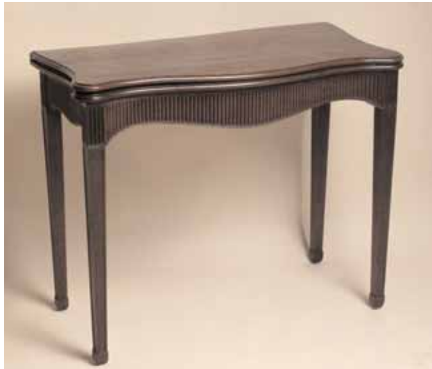
83. GEORGE III DIMINUTIVE CARVED MAHOGANY SERPENTINE GAME TABLE, circa 1780-85. Height 27 ½ in. Width 33 in. Depth 16 in.