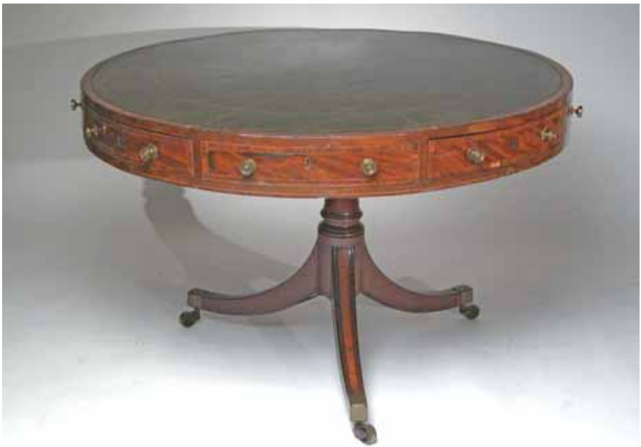
81. ENGLISH MAHOGANY DRUM TABLE, circa 1820. Height 30 in. Diameter 45 ½ in.