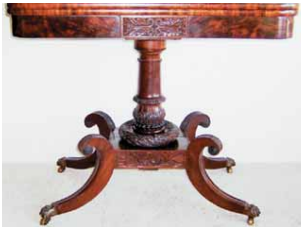
104A. PHILADELPHIA CARVED MAHOGANY GAME TABLE, circa 1820, Height 29 in. Width 36 in. Depth 18 in.