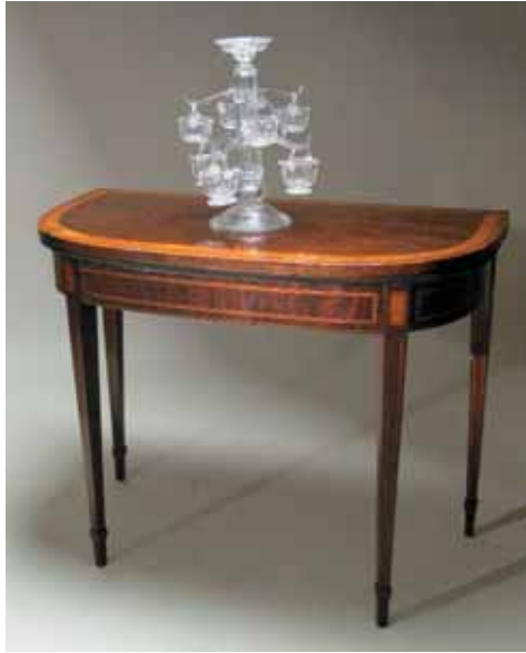
72. BLOWN GLASS SWEET MEAT TREE , circa 1820, eight branches and seven hanging baskets. Height 14 in.