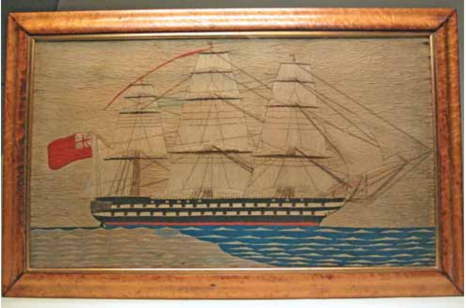
93. ENGLISH SAILOR'S WOOLIE, 19 th Century, British Man-O-War on dark blue sea. 18 in. x 31 in.