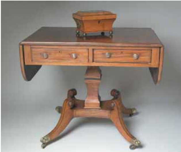
146. REGENCY PANELED SEWING BOX , circa 1820.