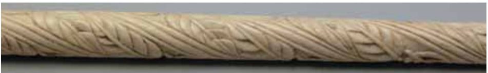
150. CARVED WHALE IVORY AND WHALEBONE WALKING STICK, 19 th Century, with carved leaf whalebone shaft. Length 34 ½ in.