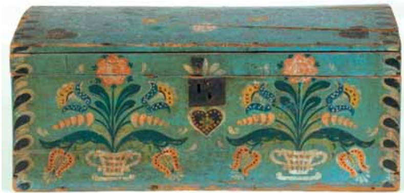
123. PENNSYLVANIA HAND PAINTED DOME TOP CHEST, 19 th Century, decorated with tulips. Height 14 in. Width 31 in. Depth 16 in.