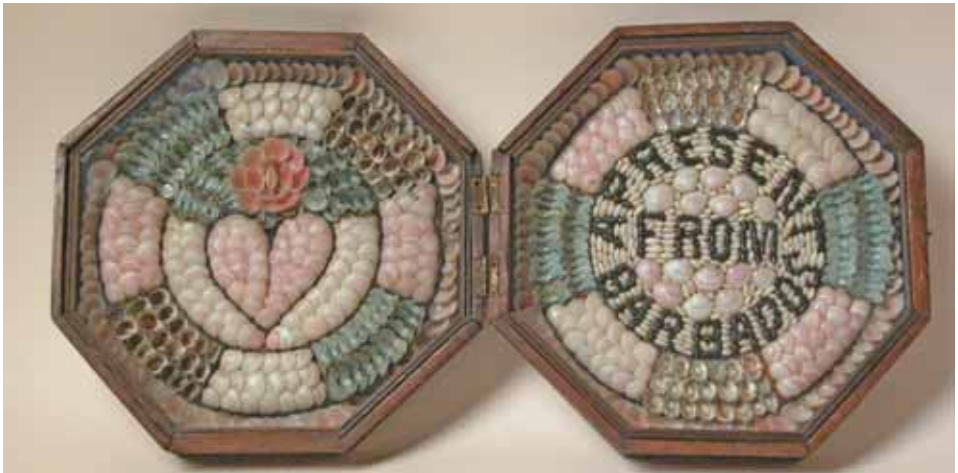
118. DOUBLE SAILOR'S VALENTINE, 2 nd half of the 19 th Century, shell collage "Present from Barbados" and heart motif in double hinged octagonal case. 9 in. x 9 in.