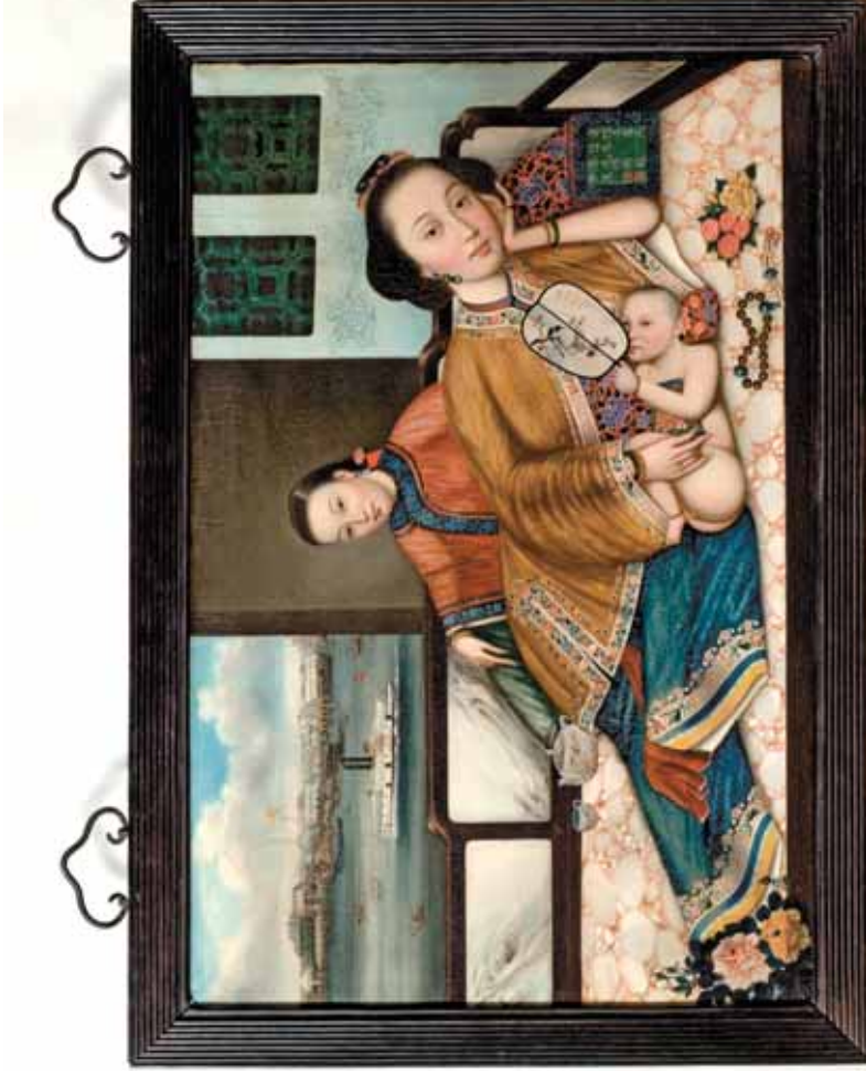
120. PAINTING, CHINESE EXPORT "INTERIOR GENRE SCENE WITH VIEW OF THE HONGS BEYOND", mid 19th Century, oil on canvas in original frame. 25 in. x 38 in.

Translation of script on pillow: "The clouds wish they can be the patterns on fine garments, and flowers wish to look their best. The spring breeze brushed the doorway, brings out its splendor and its beauty".