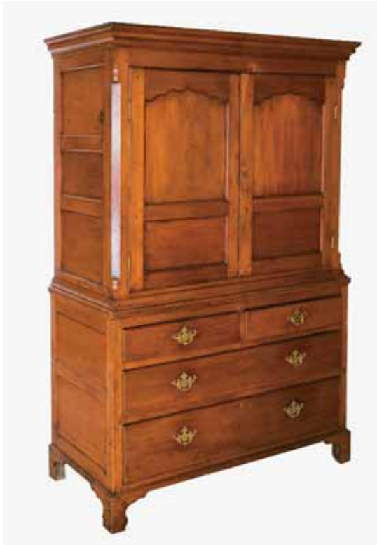
117. AMERICAN COUNTRY PINE LINEN PRESS, 18 th Century, in two sections, fielded tombstone paneled doors with lamb's tongue canted corners. Height 73 in. Width 49 in. Depth 20 ½ in.