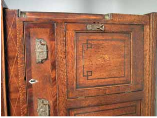
134. WELSH OAK DRESSER, circa 1800-1820, in two sections, embellished with mahogany veneers, ebony and nautilus door inlays, diamond and checker line inlays, bone escutcheons and brass repousse hardware. Height 85 in. Width 75 in. Depth 18 ½ in.