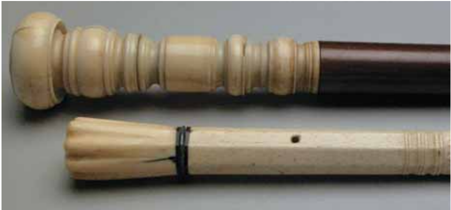
149. CARVED WHALE IVORY MULTI-TURNED KNOB WALKING STICK, 19 th Century, on hardwood shaft, abalone inlay on knob. Length 36 ½ in.