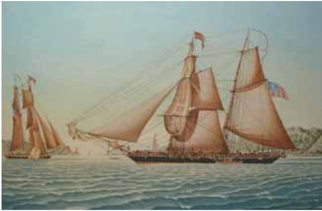
122. PAINTING, "PORTRAIT OF THE PRIVATEER RAMBLER IN THE PEARL RIVER, CHINA" , watercolor on paper, signed lower right Wreford. 17 ½ in. x 27 in.