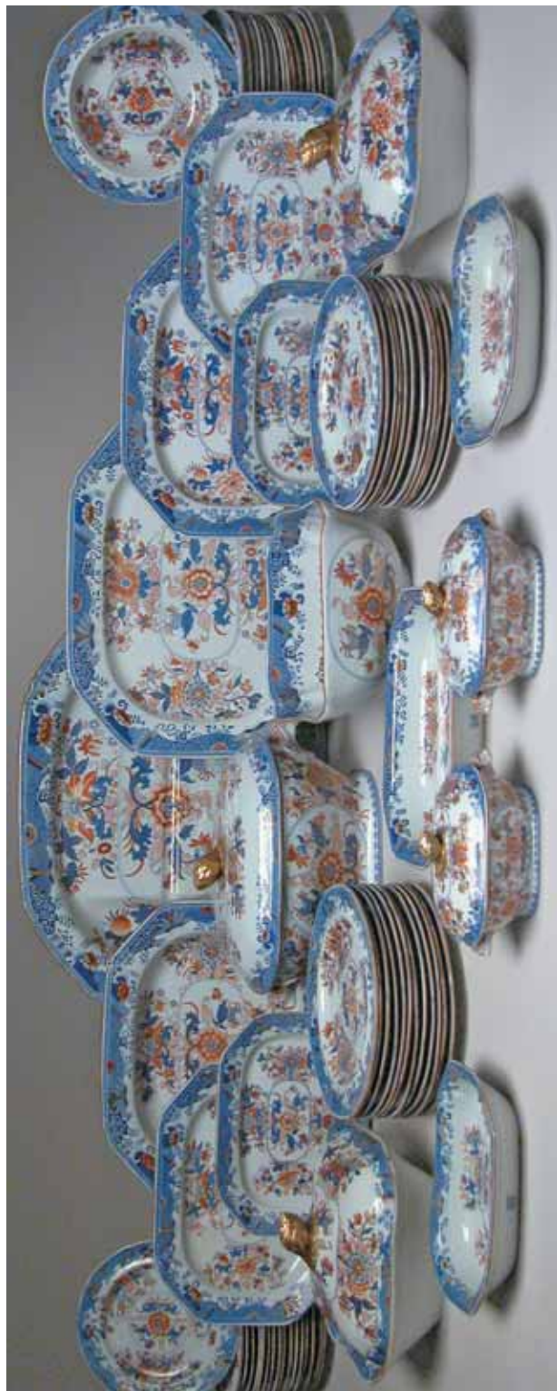
141. FINE ENGLISH SPODE DINNER SERVICE, circa 1820-1830, comprising twenty-four dinner plates, sixteen luncheon plates, sixteen soup bowls, salad bowl, seven serving platters, three open vegetable bowls, soup tureen with cover and under-platter, pair of square covered vegetable serving tureens, two covered sauce tureens.