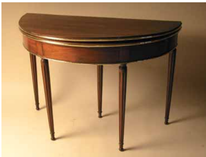
153. FRENCH DIRECTOIRE GAME TABLE, 19 th century, mahogany demilune form with brass trim. Height 29 ½ in. Width 42 ½ in. Depth 21 ½ in.