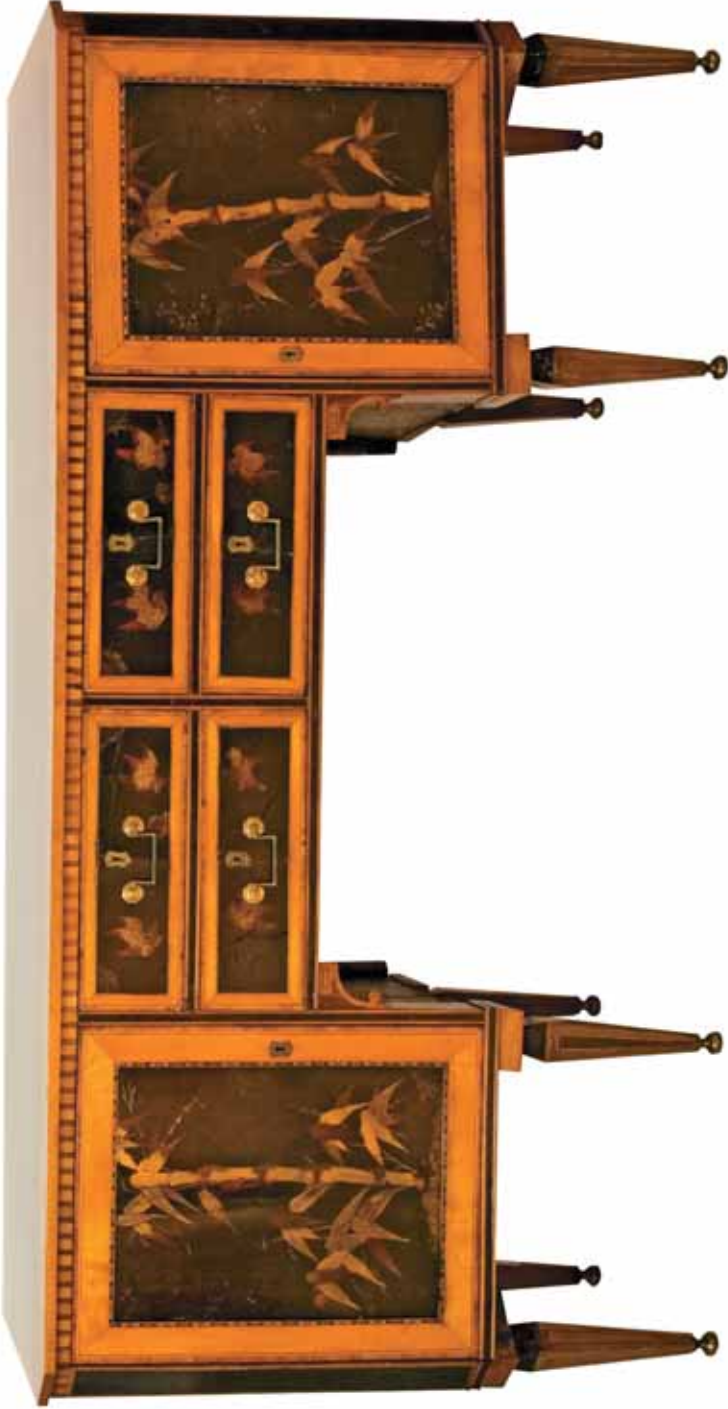
142. ENGLISH JAPANNEED SIDEBOARD, 18 th Century, mahogany and satinwood. Height 38 in. Length 76 in. Depth 22 ½ in.