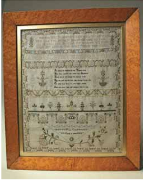
135. ENGLISH NEEDLEWORK SAMPLER BY ELIZABETH DAVIES, 1816, in period bird's eye maple frame. 18 ½ in. x 12 in.