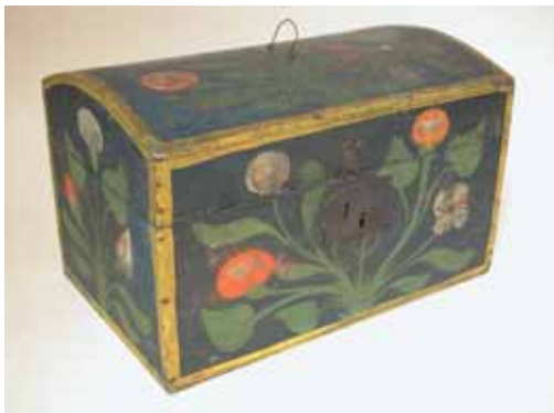
124. PENNSYLVANIA HAND PAINTED DOME TOP STORAGE BOX, early 19 th Century, wire hinges, tulips and bird decoration. Height 9 ¾ in. Width 13 in. Depth 10 in.