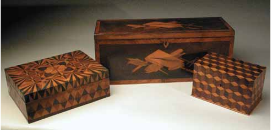
143. AMERICAN SAILOR MADE INLAID BOX , circa 1850, rosewood, maple, cherry, fans, stars, shields, diamonds and half rounds. Height 4 in. Length 11 \frac{1}{4} in. Depth 8 \frac{1}{2} in.