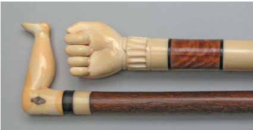
131. CARVED WHALE IVORY NAUGHTY LEG WALKING STICK, 19 th Century, with ebony band and hardwood shaft. Length 33 ¾ in.