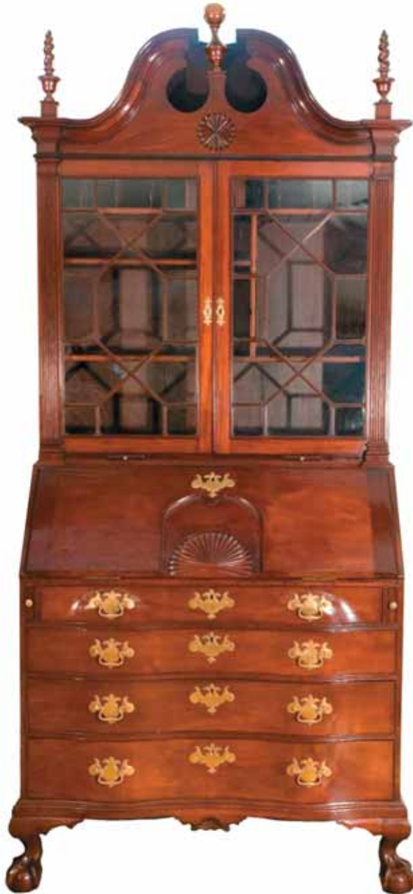
161. FINE CHIPPENDALE CARVED MAHOGANY SERPENTINE SLANT-FRONT SECRETARY BOOKCASE , circa 1770, bonnet top with two glazed doors revealing eight pigeon holes and book shelves, the shell carved slant lid reveals eight pigeon holes and drawers and central carved door above four graduated drawers, terminating in ball and claw feet. Height 99 in. Width 44 in. Depth 22 in.