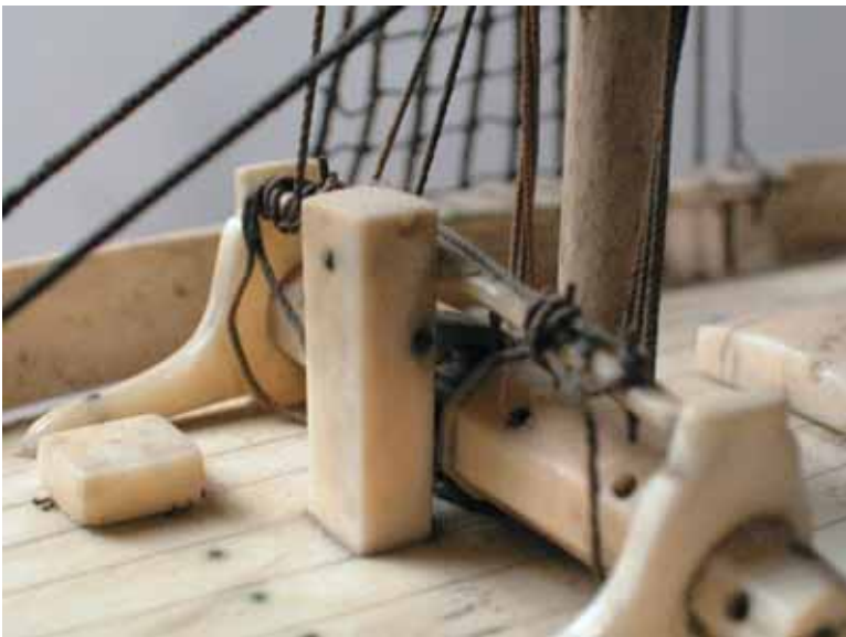
Detail of some of the whale ivory deck elements and scrimshaw deck plank lines.