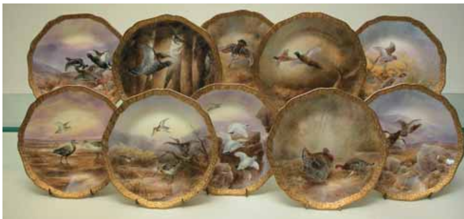
173. SET OF TEN CAULDEN, ENGLAND FINELY HAND PAINTED GAME PLATES , circa 1915, featuring ten bird species in their habitat. The American Golden Plover, Pheasant, Snipe, Red Grouse, Ptarmigan, Woodcock, Capercaillie, Black Game, American Turkey, and Partridge , each signed by the artist J. Birbeck, Sen. Retailer by Davis Callamore & Co. 5 th Avenue & 37 th Street, New York. Diameter 9 1/2 in.