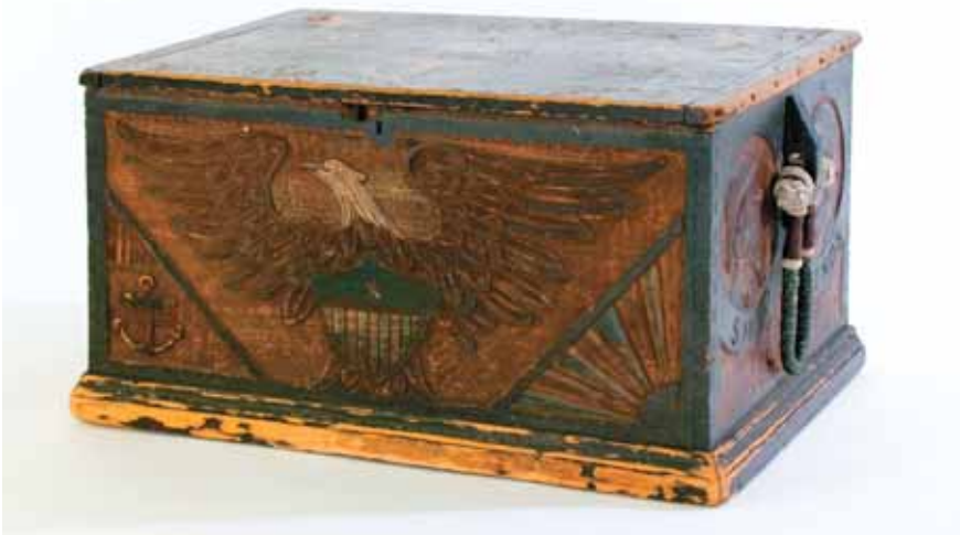
165. NANCY HANK NAUTICAL CARVED SEA CHEST, 19 th Century, carved with eagle and two gents, facing one another " Ship Friends ", rope beckets. Height 17 in. Width 31 in. Depth 20 in.