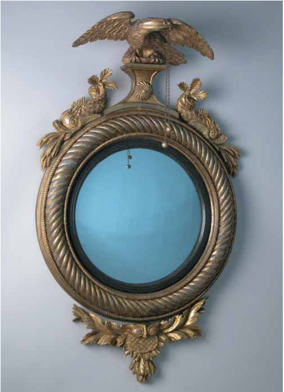
160. RARE LARGE SIZE REGENCY CARVED AND GILDED CONVEX MIRROR, circa 1810-1815, with eagle surmounted on a conical plinth, flanking dolphins with sprays, shell and leafage carved base ornament. Height 55 in. Width 32 in.