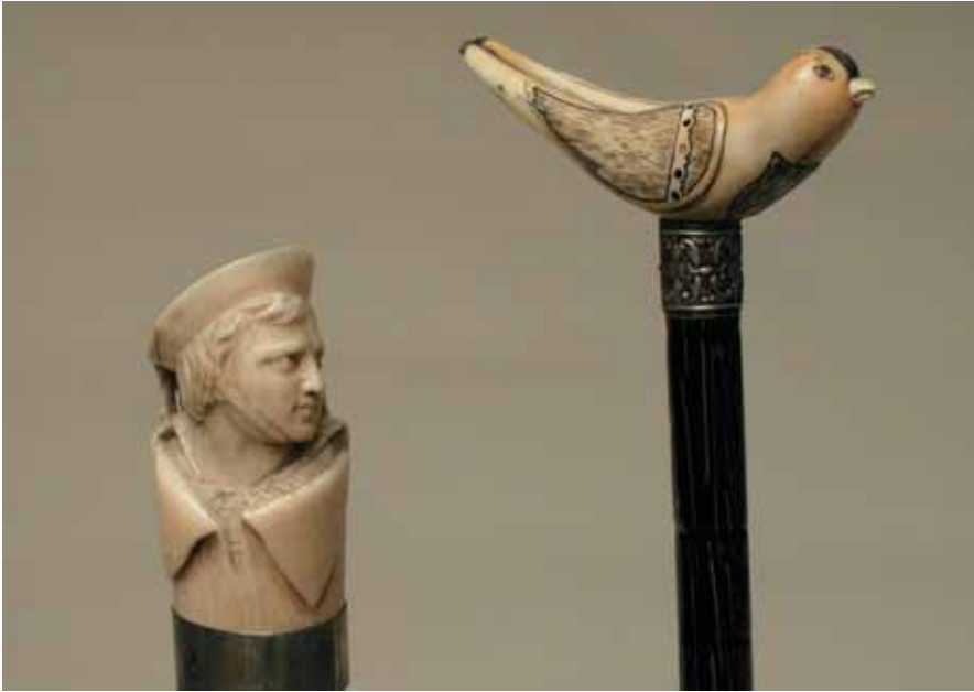
157. CARVED IVORY SAILOR BUST WALKING STICK, 19 th Century, with hardwood shaft. Length 36 ½ in.