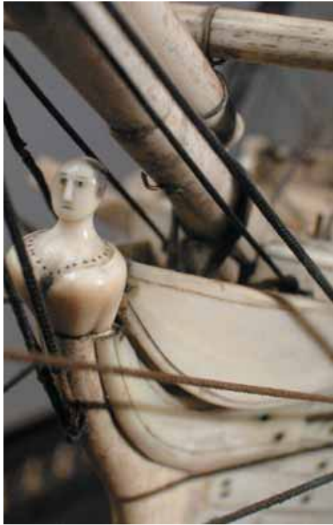
Detail of rare whale ivory scrimshaw figurehead.