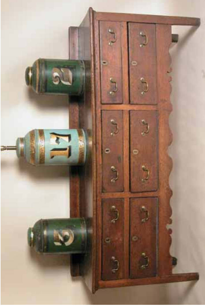
170. TWO 19 TH CENTURY DECORATED TEA CANISTERS, #2 AND #3. Height 16 in.