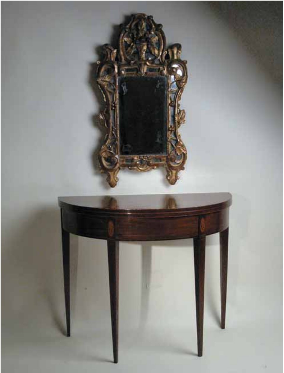
154. CONTINENTAL CARVED AND GILT MIRROR, circa 1790, fruit basket and leaves within scrolls. 36 in. x 19 in.