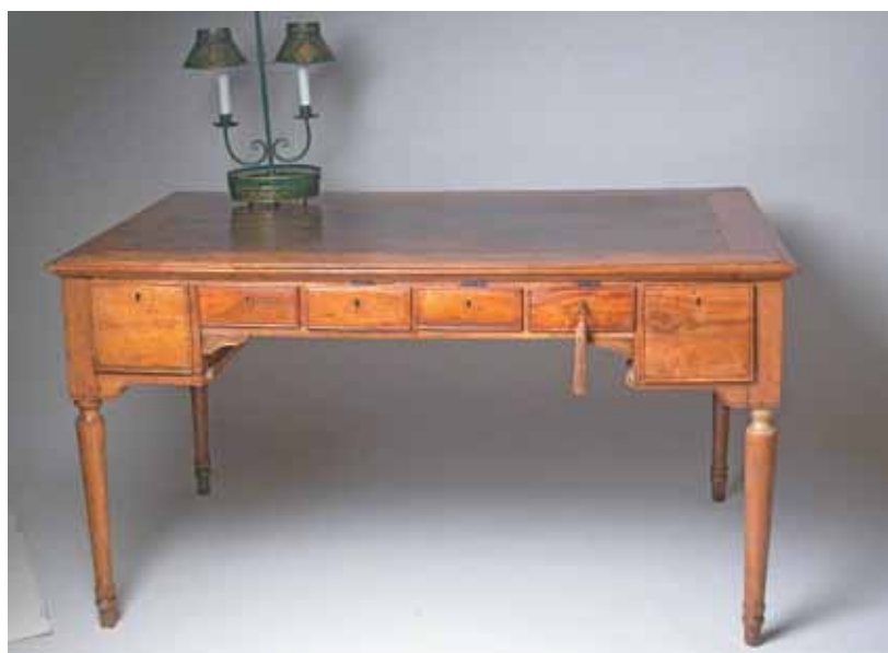
174. COUNTRY FRENCH FRUITWOOD BUREAU PLATTE , circa 1820, double work sides, the front with cut frieze and six drawers, the opposing side with eight drawers. Height 33 1/2 in. Length 58 3/4 in. Width 37 1/4 in.