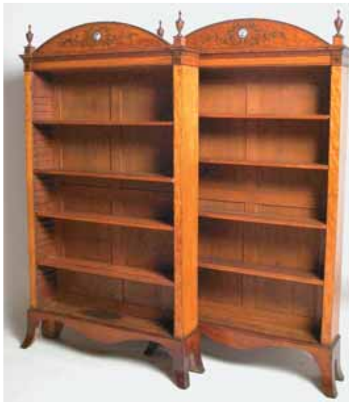
156A. FINE AND RARE MATCHED PAIR OF SHERATON DECORATED SATINWOOD BOOKCASES, circa 1810-1820, arched with inset battersea figural plaques, graduated shelves, inlaid stiles, flaring French bracket feet. Height 68 \frac{1}{2} in. Width 37 \frac{3}{4} in. Depth 7 in.