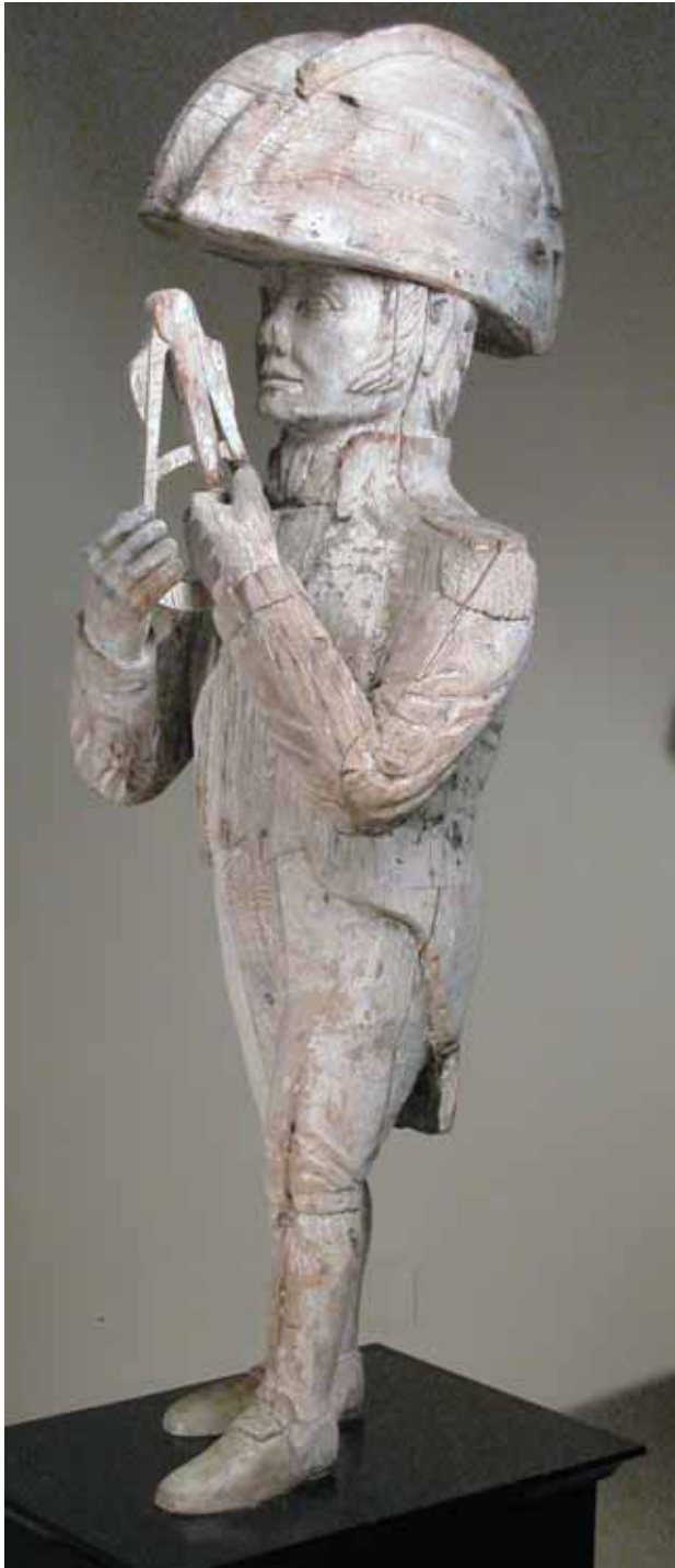
166. AMERICAN FOLK ART PINE TRADE SIGN FIGURE, circa 1820-30, on black painted custom plinth. Height 47 in. Overall Height 67 ½ in.