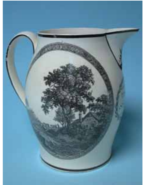
167. VERY RARE LIVERPOOL PITCHER, THOMAS STARBUCK, NANTUCKET (b. 22 October 1742, d. 13 December 1830), "The Farmer's Arms. Height 7 ½ in.