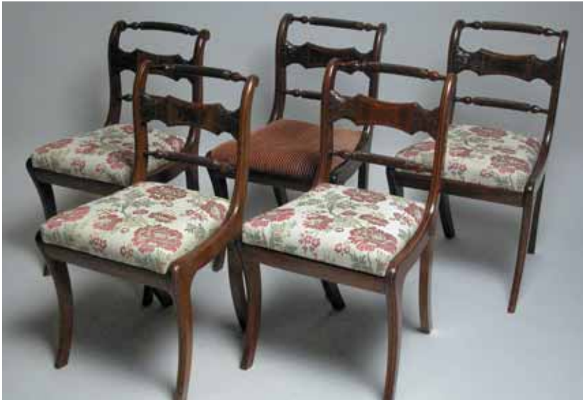
159. SET OF FIVE ENGLISH REGENCY CARVED MAHOGANY DINING CHAIRS.