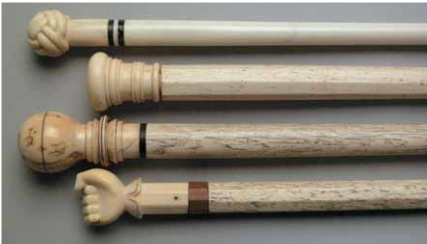
195. CARVED WHALE IVORY TURK'S HEAD KNOT WALKING STICK, 19 th Century, with two ebony spacers on carved whalebone shaft, brass ferrule. Length 36 ¼ in.