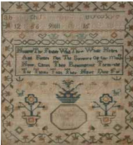
190. ENGLISH NEEDLEWORK SAMPLER WORKED BY "MARY HORLEY, MAY THE 12 TH , 1820", in bird's eye maple frame. 12 in. x 11 ½ in.