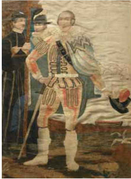
184. SILK EMBROIDERY AND HAND PAINTED SILK OF CHRISTOPHER COLUMBUS AND TWO ATTENDANTS, 18 th Century. 21 ½ in. x 15 ½ in.