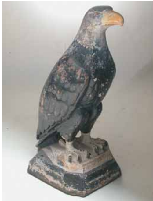
209. VINTAGE CAST IRON PAINTED FILLING STATION DECORATIVE EAGLE. Height 35 in.