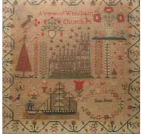
189. ENGLISH NEEDLEWORK SAMPLER "A VIEW OF WREXHAM CHURCH" with ship by Sinai James, circa 1825, in period bird's eye maple frame. 21 in. x 21 in.