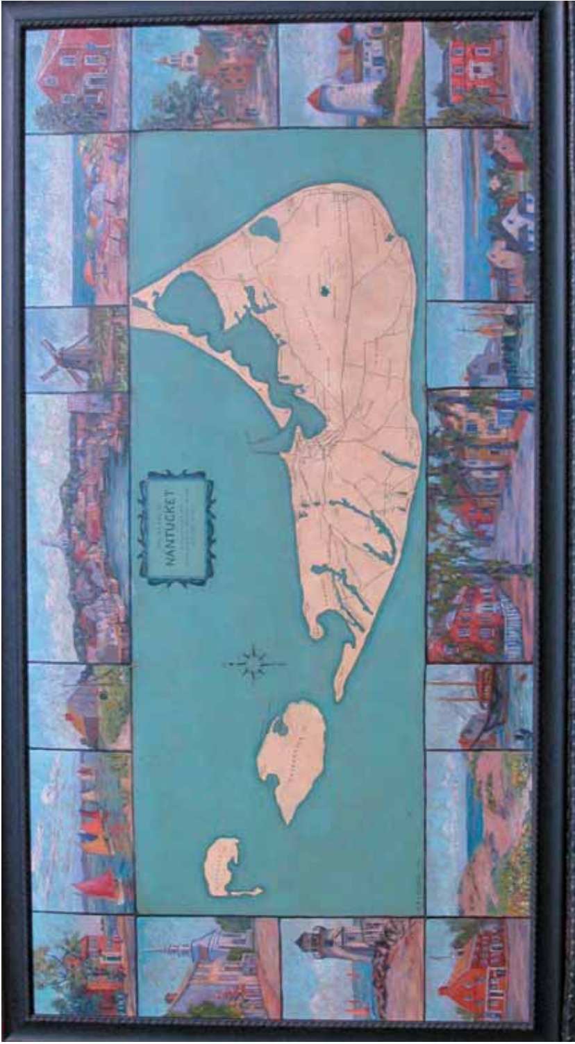
211. PAINTING, "NANTUCKET COLLAGE MAP", circa 1946, oil on panel depicting the map of the island with various historic vignettes surround, signed lower left E.C. Labaree, 1946. 30 in. x 59 in.