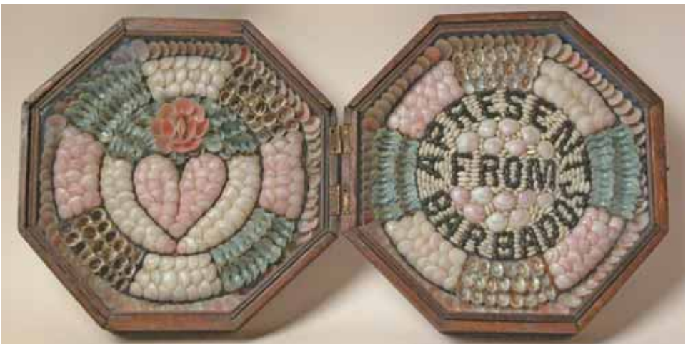
200. DOUBLE SAILOR'S VALENTINE, 2 nd half of the 19 th Century, shell collage " A Present From Barbados " in double hinged octagonal case. 9 ¼ in. x 9 ¼ in.