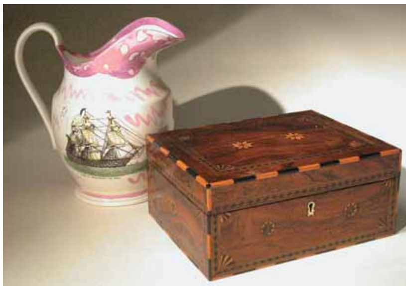
181. SUTHERLAND DECORATED WATER PITCHER, 19 th Century, portrait of the gun ship " Duke of Wellington " and the steam-ship " Great Eastern ". Height 8 \frac{3}{4} in.