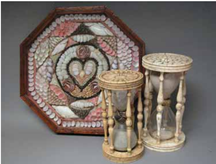
185. SAILOR'S VALENTINE, 2 nd half of the 19 th Century, shell collage with heart and flower motif. 13 ½ in.