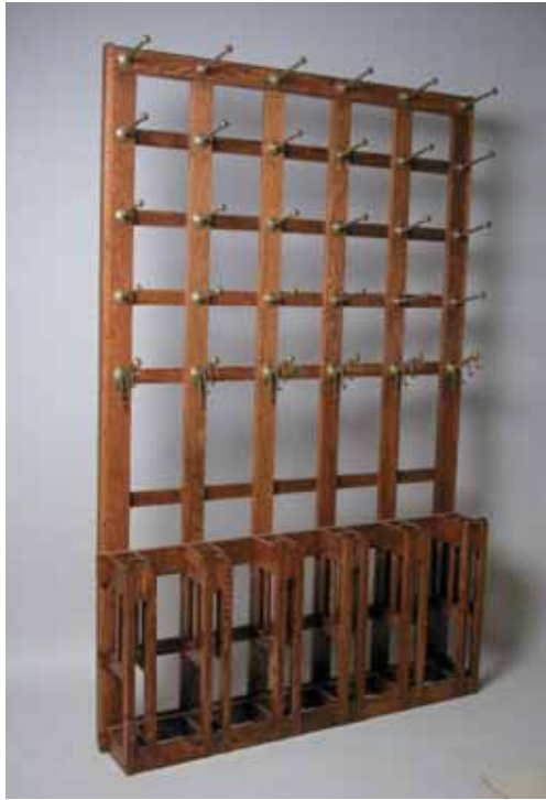
199. NEW YORK ARTS AND CRAFTS OAK AND BRASS EQUESTRIAN HAT, BRIDLE, RIDING CAP HALL RACK, circa 1902, labeled " Philip Strobel & Sons, Ltd.; 53 & 55 Elizabeth Street, New York; Patented Dec. 9, 1902 ". Height 91 in. Width 48 in. Depth 10 in.