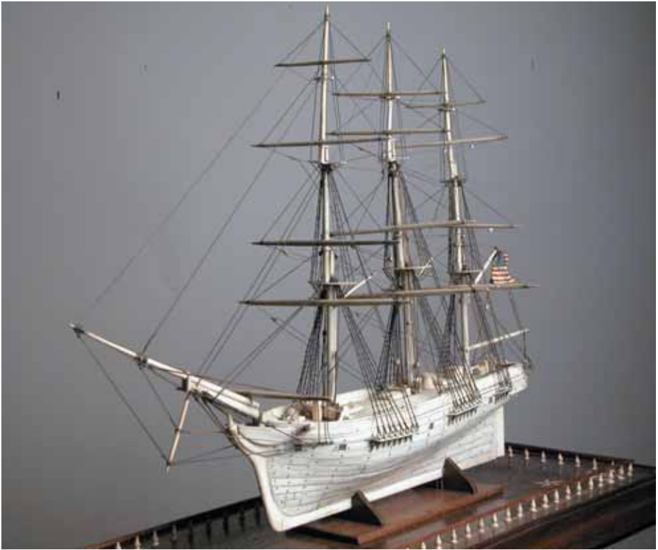
177. VERY RARE AMERICAN WHALE IVORY AND WHALEBONE MODEL OF A MERCHANT SHIP, circa 1840-1860. This fine model has a whalebone keel, bow, masts, spars, blocks, bowsprit, stern, rudder, blocks, raised bulwarks. The deck is scrimshawed with plank lines on a solid piece of pan bone. The whale ivory carved elements are lead by an exquisite scrimshawed figurehead of a large breasted woman with a low cut dress, pulled back hair and bead necklace. There are eighteen baleen inlaid faux gun port squares along the hull. The anchor cats, windlass, capstun, various deckhouses, trailboards, bulkhead and twenty-one deadeyes are all carved of ivory. The original mahogany base is mounted on a contemporary base which is inlaid with five stars and quarter fans of ebony, maple and satin, encompassed by a bone baluster rail, wood and glass case with ivory finials (not shown). Dimensions of model without base: Height 26 in. Length 34 in. Width 11 ½ in.