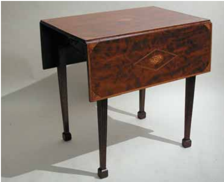
204. ENGLISH MAHOGANY INLAID PEMBROKE TABLE, circa 1790, quarter fan inlays at all corners with satin and tulip wood shell inlaid center. Height 30 in. Width 30 in. Depth 22 in.