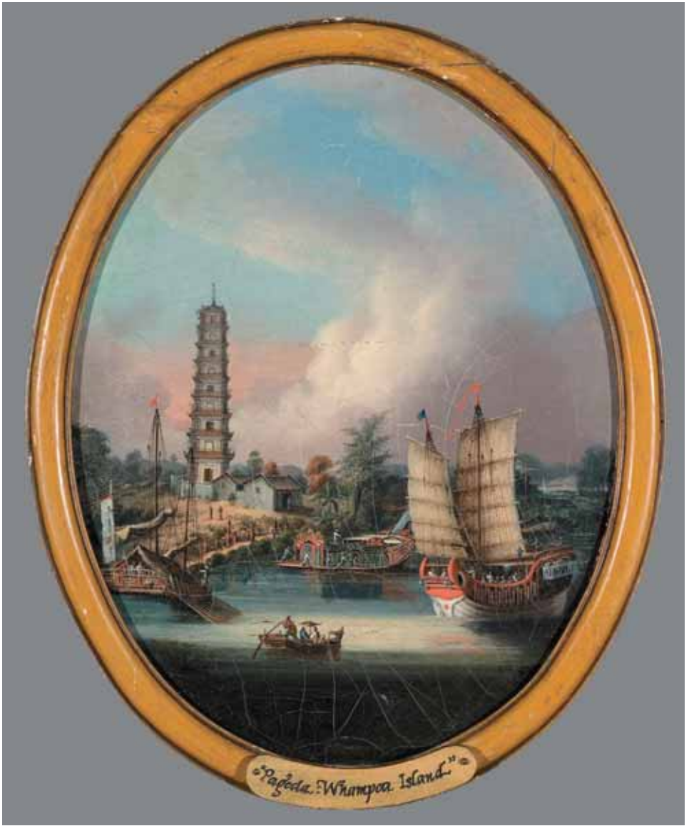
"PAGODA WHAMPOA ISLAND"