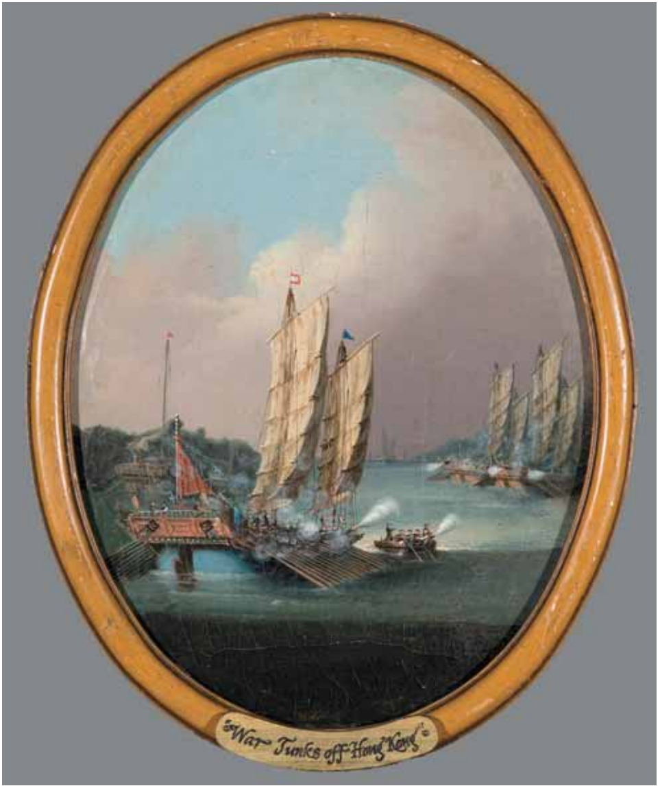
"WAR JUNKS OFF HONG KONG"

178. PAINTINGS, PAIR OF CHINESE EXPORT VIEWS, oils on canvas, circa 1850-1880. 13 ½ in. x 10 ½ in.