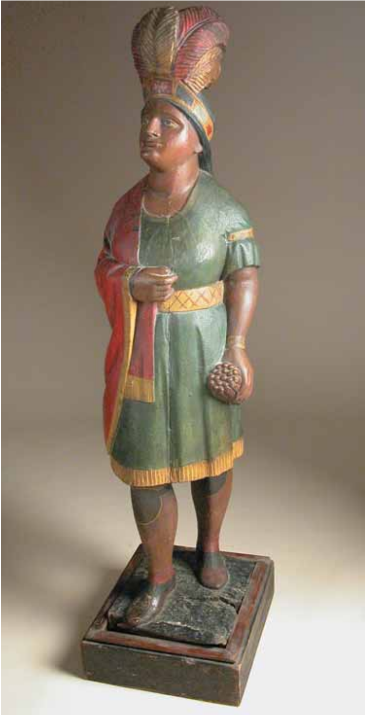
210. AMERICAN CARVED AND PAINTED CIGAR STORE INDIAN TRADE SIGN, circa 1870. Height 56 in.