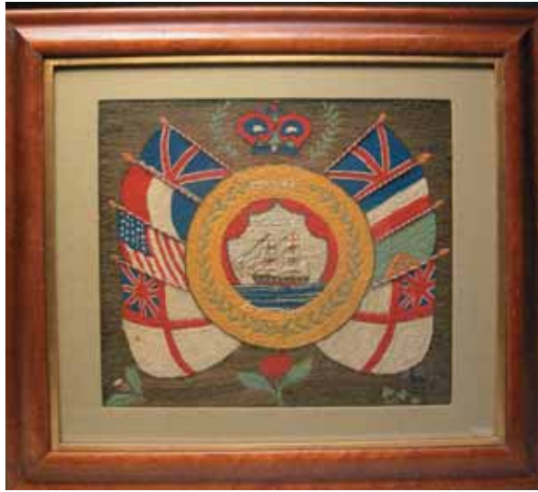
203. SAILOR MADE WOOLIE "FORGET ME NOT", 19 th Century, cameo of a ship with American, English, Irish and French Flags. 15 in. x 17 ½ in.