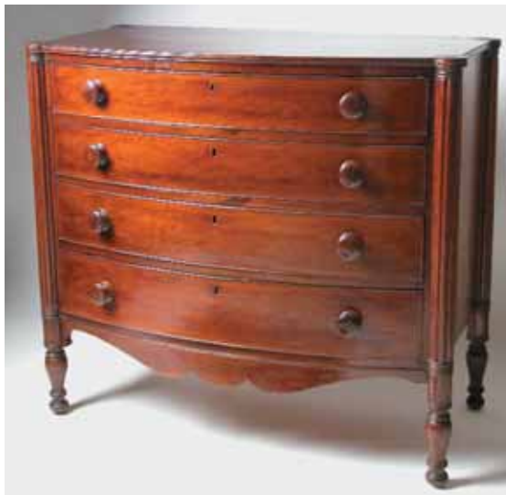
234. AMERICAN MAHOGANY SHERATON CHEST OF DRAWERS, circa 1820. Height 40 ½ in. Width 45 in. Depth 22 ½ in.