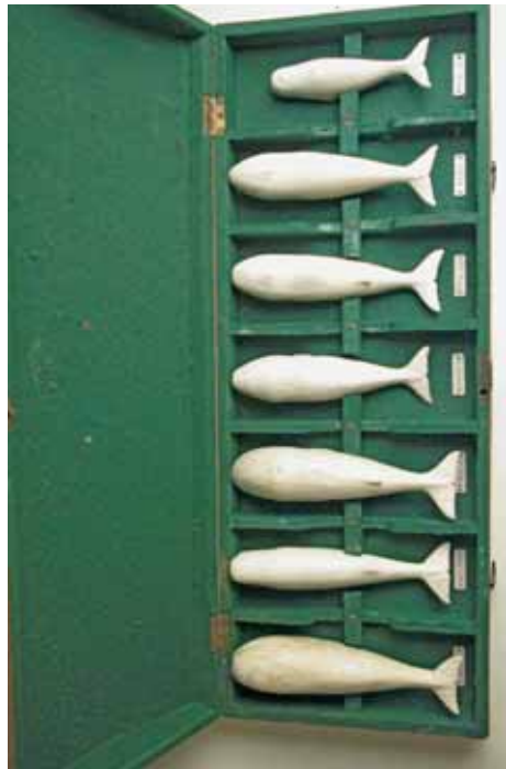
245. CARVED WHALE IVORY AND WHALEBONE CANE, circa 1850, eel handle with wood and baleen spacers on a turned tapering shaft.