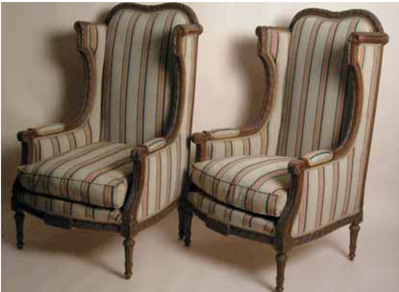
238. PAIR OF CARVED AND UPHOLSTERED LOUIS XV STYLE HIGH-BACK WING CHAIRS. Height 51 ½ in.