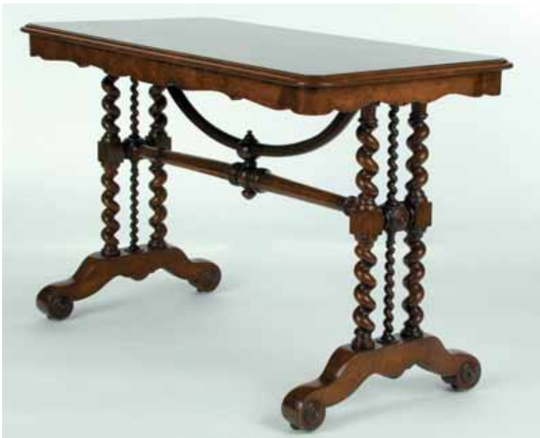
240. GEORGE IV BURLWOOD LIBRARY TABLE, circa 1830. Height 27 ½ in. Length 42 in. Depth 23 in.