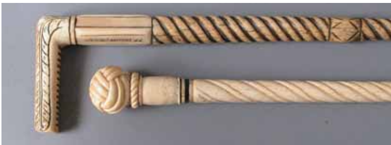
231. CARVED WHALE IVORY AND WHALEBONE TURK'S KNOT CANE, circa 1840, with carved twisted whalebone shaft.