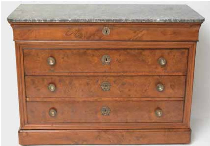
243. LOUIS PHILLIPE FRENCH BURLWOOD BUREAU WITH GREY MARBLE TOP, circa 1800. Height 27 in. Width 51 in. Depth 24 in.