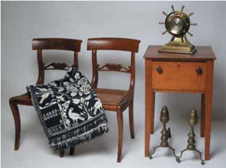
226. PAIR OF AMERICAN TIGER MAPLE SIDE CHAIRS, circa 1830, with scroll and floral carved splats.