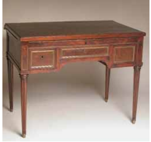
219. FRENCH MAHOGANY AND BRONZE INLAID DESSERT SERVER, early 19 th Century, with mirror, marble top, and hinged work surface. Height 28 ½ in. Width 36 in. Depth 23 in.