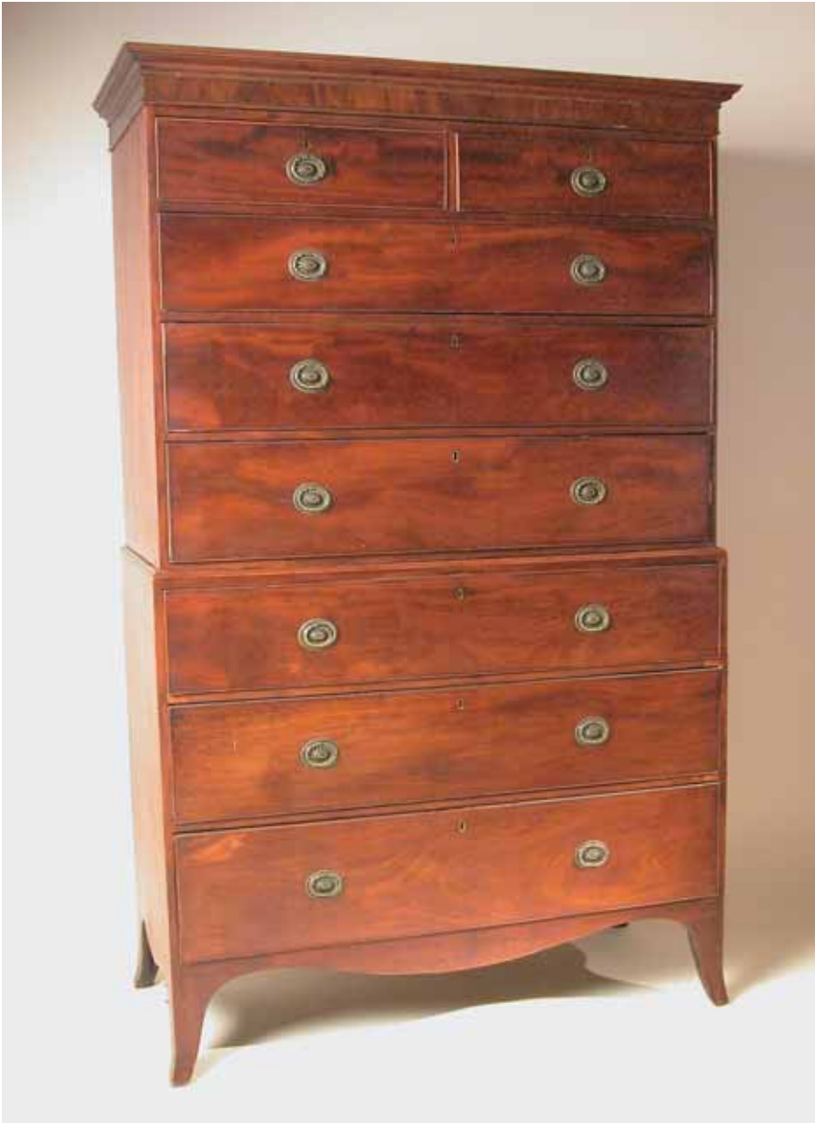
217. ENGLISH HEPPLERWHITE MAHOGANY CHEST ON CHEST, circa 1790, eight drawers on French flared feet. Height 78 in. Width 48 in. Depth 22 in.