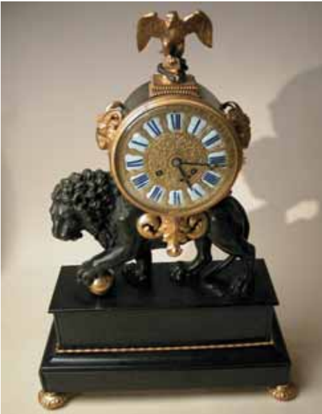
241. PATINA BRONZE LION SCULPTURE CLOCK WITH GILT EAGLE, 19 th Century. Height 25 in. Width 18 in.