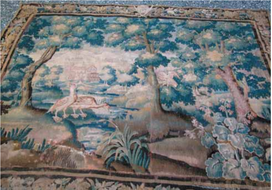
239. HAND WOVEN BELGIAN TAPESTRY, 18 th Century.