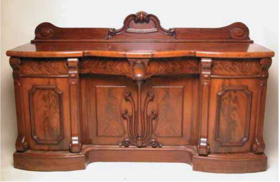
237. ENGLISH CARVED MAHOGANY SIDEBOARD, 19 th Century, left side: drawer and two linen slides; right side: drawer and decanter drawer. Height 47 ½ in. Width 78 ½ in. Depth 28 in.