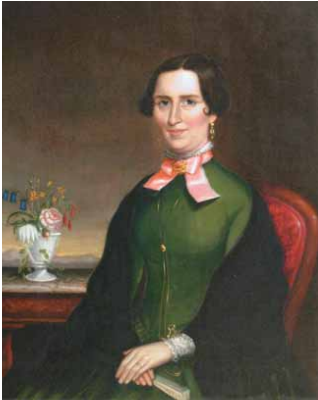
233. PAINTING, " AMERICAN PORTRAIT OF A LADY ", circa 1840, oil on New York canvas. 36 in. x 29 in.