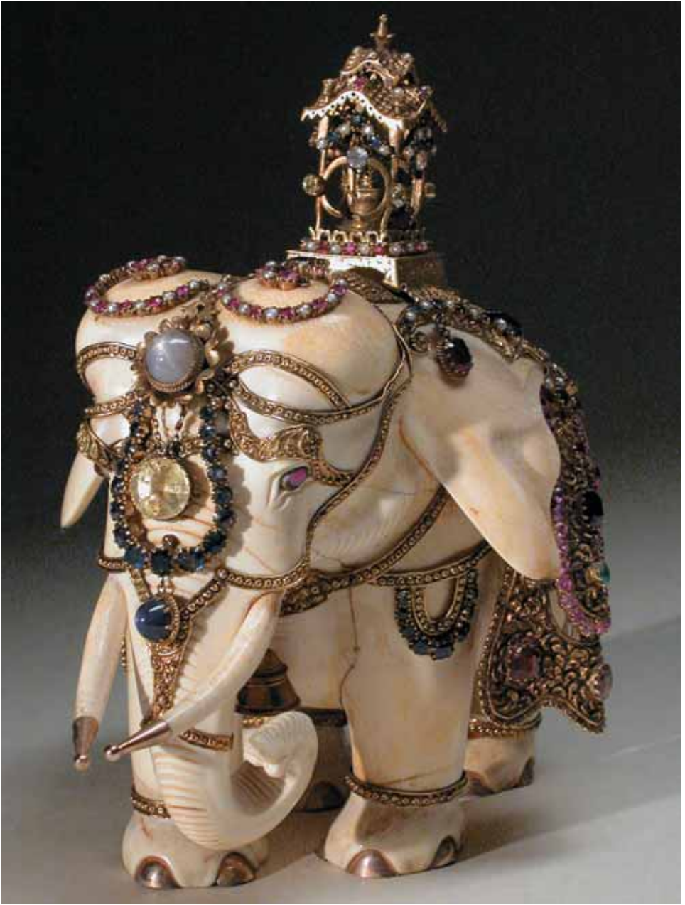
244. FINE CARVED IVORY JEWELED AND GOLD MOUNTED ELEPHANT, comprising: 69 pearls, 109 rubies, 76 sapphires, 3 emeralds, 8 garnets, 3 star sapphires, 11 amethysts, 6 topaz, 3 peridot, and 17 clear topaz in a fitted mahogany felt lined case.