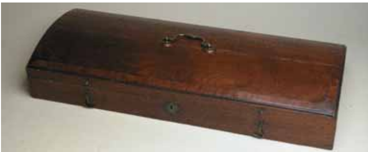
249. GROUPING OF SEVEN CARVED BONE WHALES, in 19 th Century mahogany felt lined box, Right, Sperm, Humpback, Bowhead, Finback, Grey and White. Ranging in lengths 9 3 / 4 in. to 7 in.