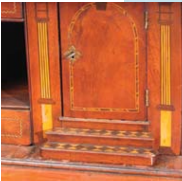
311. GEORGE III FIGURED MAHOGANY SLANT FRONT DESK, 18 th Century , finely fitted interior with herringbone inlaid drawer fronts and removable secret compartment. Height 42 in. Width 42 in. Depth 23 ½ in.