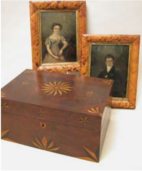
327. PAINTINGS, PAIR OF MINIATURE PORTRAITS, circa 1840, oil on wood panel, in period bird's eye maple frames. 7 ½ in. x 5 in.