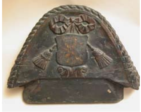
325. CARVED WOOD DUTCH SHIP ORNAMENTAL FRAGMENT, 19 th Century.