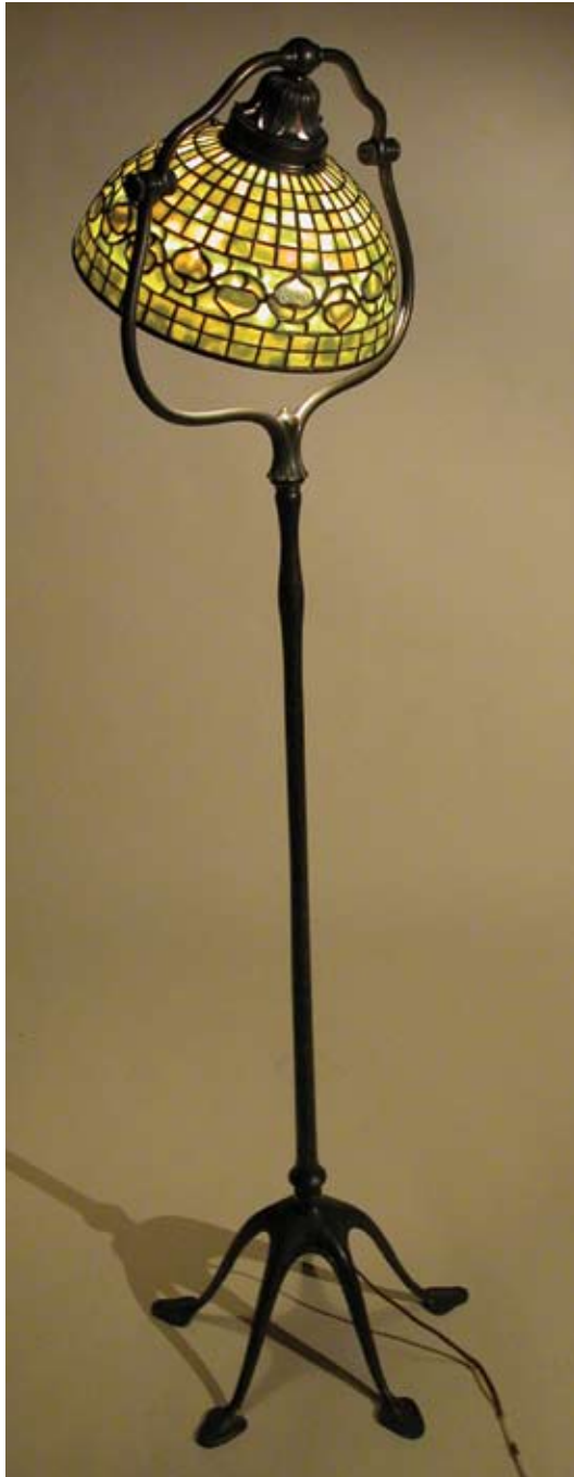
310. TIFFANY STUDIOS NEW YORK PATINA BRONZE FLOOR LAMP #423, with green leaded glass acorn shade marked " Tiffany Studios, New York 1410 ", mounted on bronze five footed base marked " Tiffany Studios New York 423 ". Lamp Height 58 in.; Diameter of Shade 12 in.