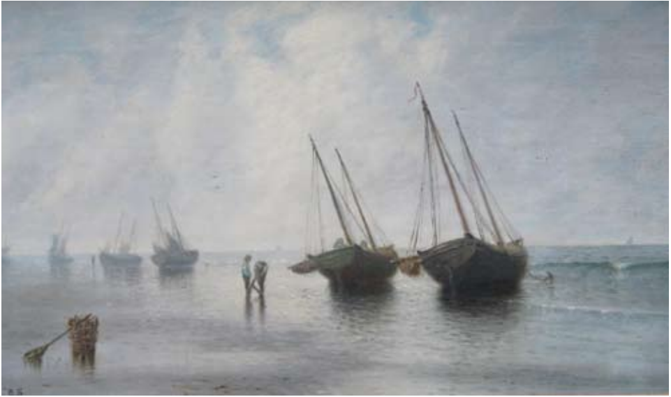
316. PAINTING, HARRY SUNTER (AMERICAN B. 1850) “Clamming at Low Tide”, possibly Nantucket, oil on canvas, dated ‘85. 16 in. x 30 in.