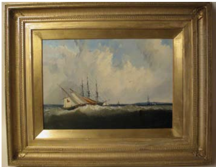
330. PAINTING, EMILE F. BEAULIEU (19 th Century) “New York Harbor Scene” oil on canvas, signed lower right Beaulieu, New York, '59. 13 ½ in. x 20 in.