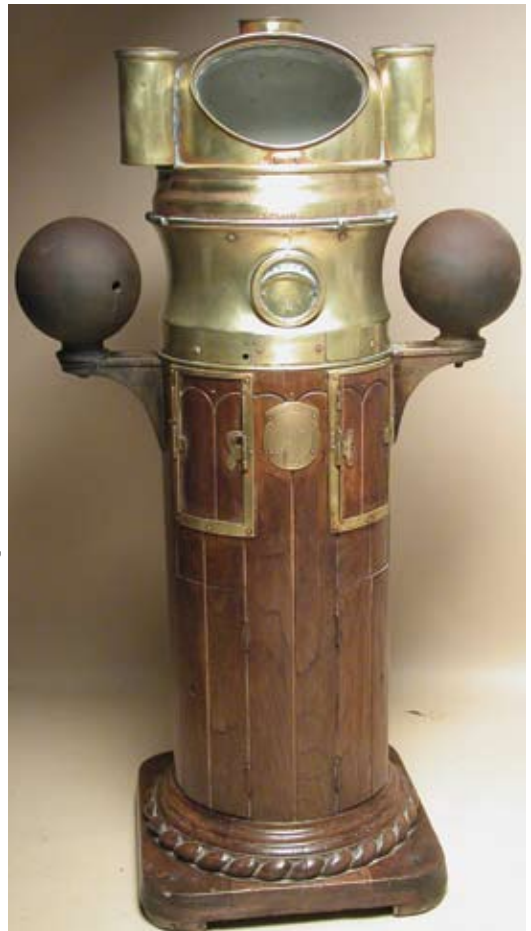
329. LORD KELVIN AND JAMES WHITE LTD. BINNACLE COMPASS, 16 Cambridge St. Glasgow, Patent 1908.