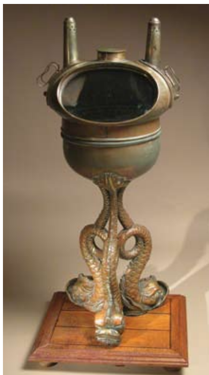
331. RARE SAN FRANCISCO BRASS BINNACLE COMPASS , manufactured by W.W. Delano, Maker N. 20 Spear Street, San Francisco, on unusual tri-dolphin base. Height 47 in.