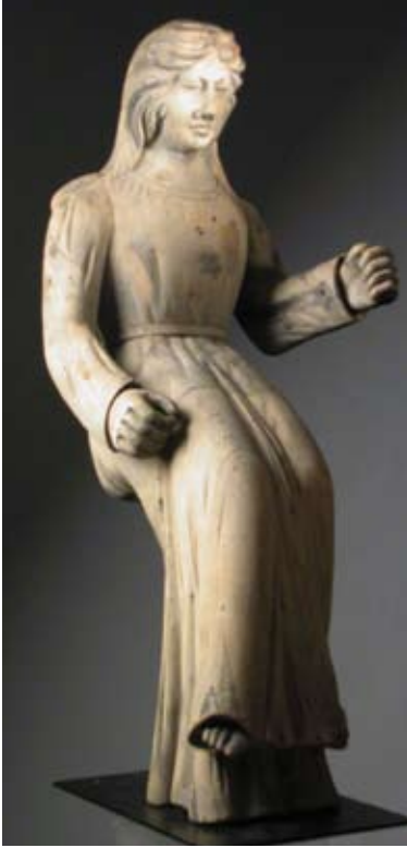
313. CARVED FOLK ART TRADE STORE FIGURE, mid 19 th Century , seated female figure with long dress which exposes her feet, long flowing hair and extended arms hold an element. Height 46 in.