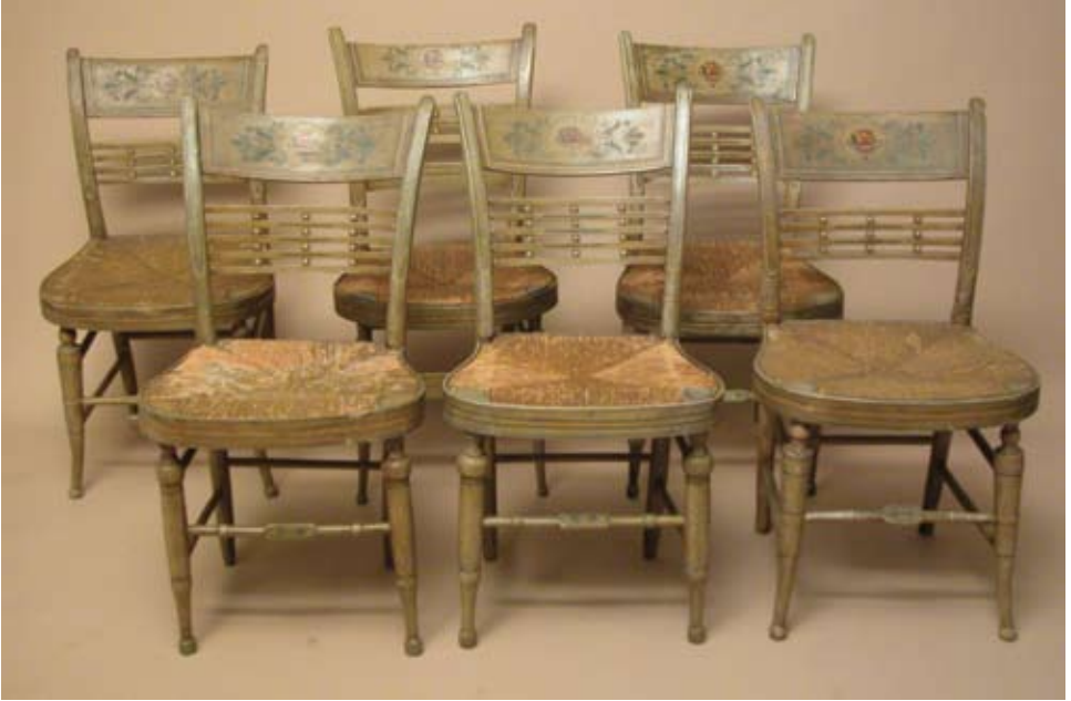
318. SET OF SIX SHERATON FANCY DECORATED DINING CHAIRS, 1st quarter of the 19 th Century, rush seat and fruit basket decorations.