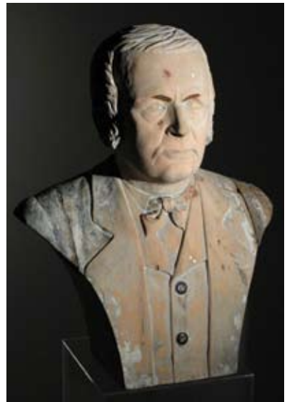
312. CARVED PINE BUST OF A MERCHANT, 19 th Century , a bust portrait carved in the round, signed. Height 21 in.