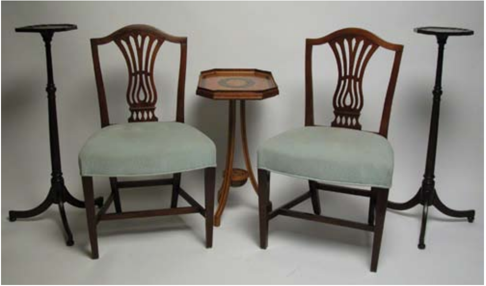
332. PAIR OF GEORGE III CARVED MAHOGANY TORCHÉRES, circa 1790. Height 36 ½ in.