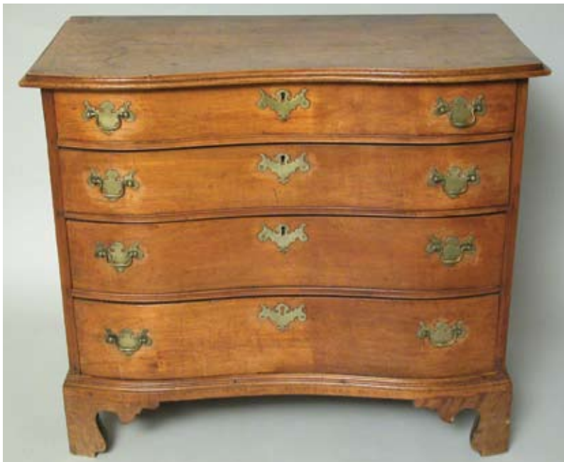
317. NEW ENGLAND CHIPPENDALE SERPENTINE FRONT CHEST OF DRAWERS, 18 th Century. Height 33 ½ in. Width 38 ½ in. Depth 20 ½ in.