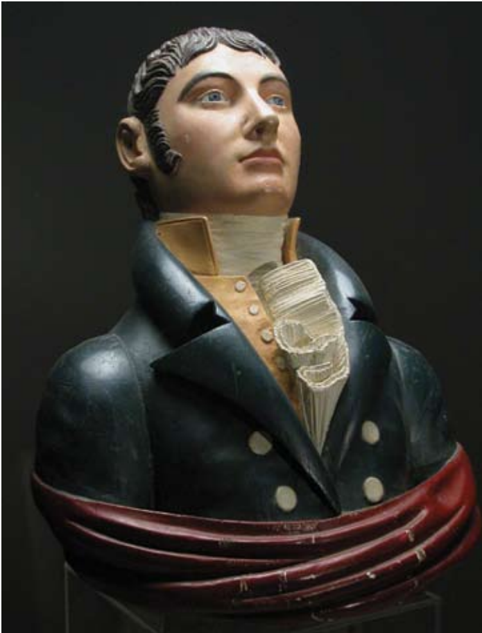
326. CARVED FIGUREHEAD BUST OF A GENTLEMAN, in blue coat, yellow vest, white ascot, possibly Robert Burns. Height 20 in.