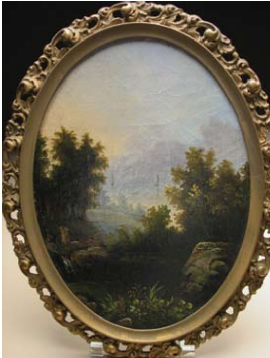
319. PAINTING, “Hudson River School Landscape”, mid 19 th Century, oval oil on artist's board. 12 in. x 9 in.