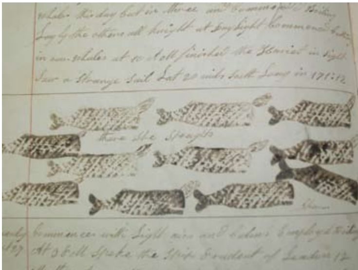
241. WHALING LOG BOOK: “ Journal of a Voyage from New Bedford to the North and South Pacific Oceans on board the Ship “Minerva Smyth” Commenced August the 29th 1824, Terminated in the Year of our Lord One Thousand Eight Hundred Twenty Seven ” 159 whale stamps; Monday Sept. 26 1825 took 11 whales alongside “There She Blows”.