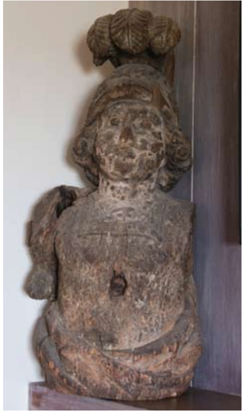
234. CARVED FIGUREHEAD OF A ROMAN WARRIOR, late 18 th to early 19 th Century , in traditional costume with large and impressive plumed and feathered helmet, Northern European or possibly French, with evidence of a polychrome paint scheme on hardwood. Height 31 in. Width 15 in. Depth 11 in.