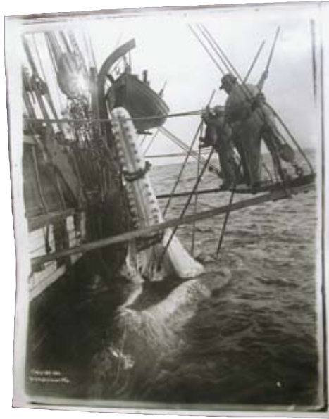
238. PHOTO ALBUM: "CUTTING IN A WHALE" , a series of 25 photographs taken onboard the Bark California , copyrighted 1903 by H.S. Hutchinson & Co., New Bedford, Massachusetts. Each photo 10 in. x 8 in.