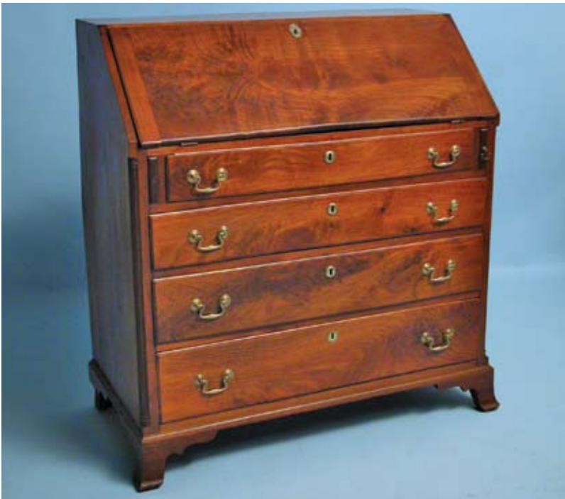
243. PHILADELPHIA MAHOGANY SLANT FRONT DESK, circa 1790, eight pigeon holes and six drawers flank a central door behind the slanted lid, above four graduating drawers flanked by carved quarter columns on bracket feet. Height 43 in. Width 42 in. Depth 20 in.