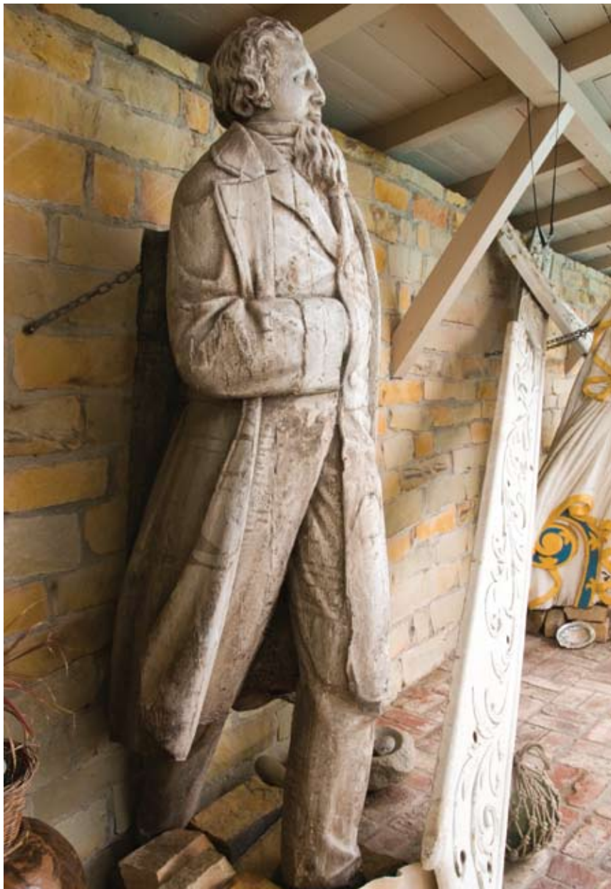
228. CARVED SHIP'S FIGUREHEAD OF A GENTLEMAN, mid 19 th Century, polychrome painted hardwood in allover white in the form of a full length portrait, possible Victorian West Coast ship owner or related business man, wearing two frock coats with his right hand tucked into the under frock and his left arm down on his side holding a scroll. This style of figurehead was popular in America throughout the last half of the 19 th Century, with a number of survivors in public collection in the United States. This figure would have originally stood on a large billet head scroll and could possibly originate from one of the leading New York or Boston workshops. Height 74 in. Width 27 in. Depth 25 in.