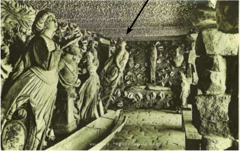
1900 View of the La Gauloise at Tresco