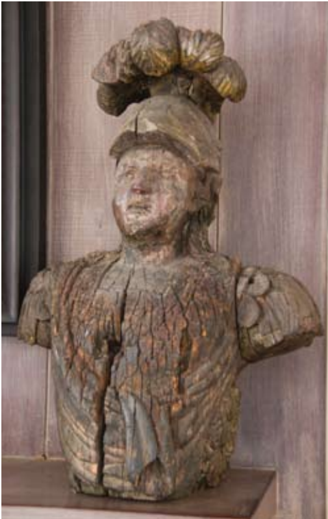
235. CARVED FIGUREHEAD OF A ROMAN WARRIOR, late 18 th to early 19 th Century , in traditional costume with large and impressive plumed and feathered helmet, Northern European or possibly French, with evidence of a polychrome paint scheme on hardwood. Height 26 in. Width 19 in. Depth 10 in.