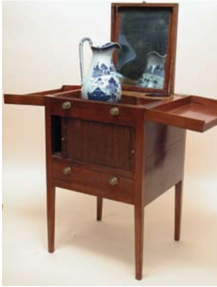
344. CANTON WATER PITCHER, circa 1850, repair to handle. Height 13 in.