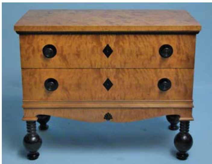
340. BIEDERMEIER TWO DRAWER CHEST, circa 1840, satinwood case with turned ebonized feet, drawer pulls and trim. Height 33 in. Width 40 in. Depth 19 ½ in.