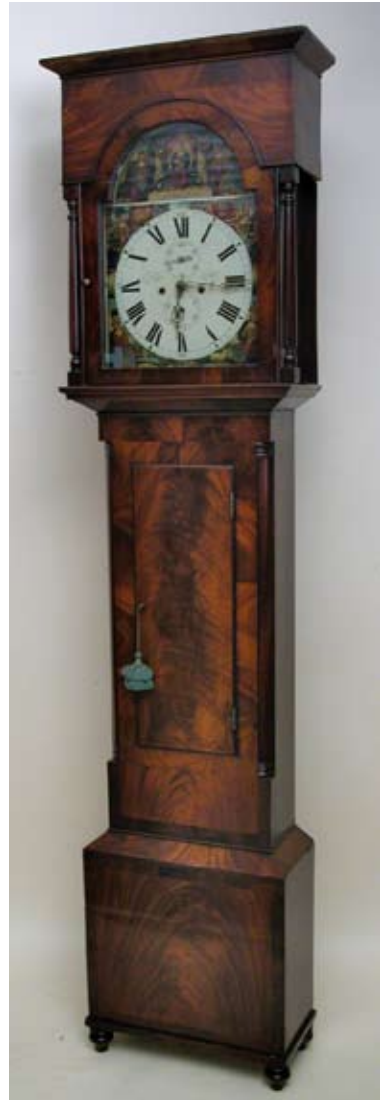
347. ENGLISH FLAME MAHOGANY TALL CASE CLOCK, circa 1840, with turned full columns and crossbanded case, face signed A.W. Miller Airdrie, Queen Victoria painted pediment, and female figures representing Scotland, England, Ireland, and Wales. Height 87 in. Width 20 in. Depth 9 ½ in.