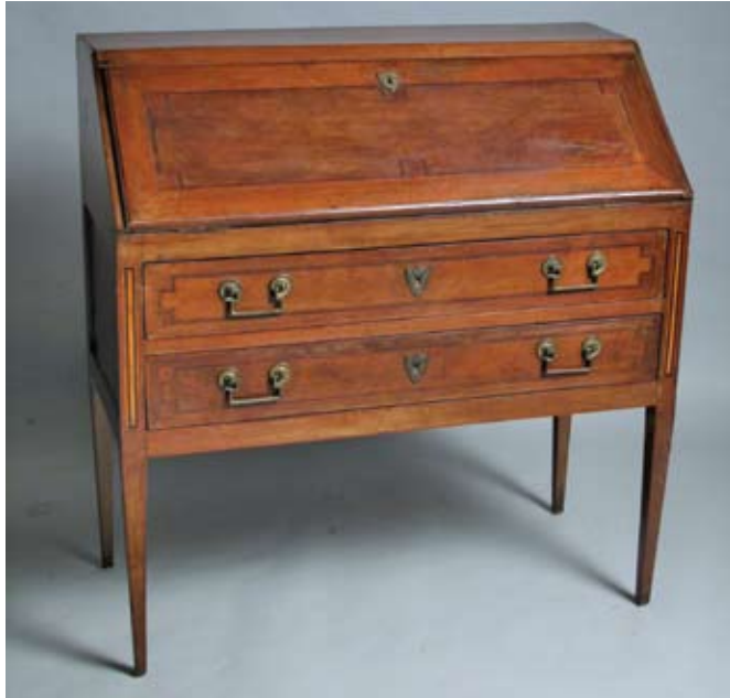
338. FRENCH DIRECTOIRE INLAID SLANT FRONT DESK, 18 th Century. Height 39 in. Width 37 in. Depth 17 ½ in.