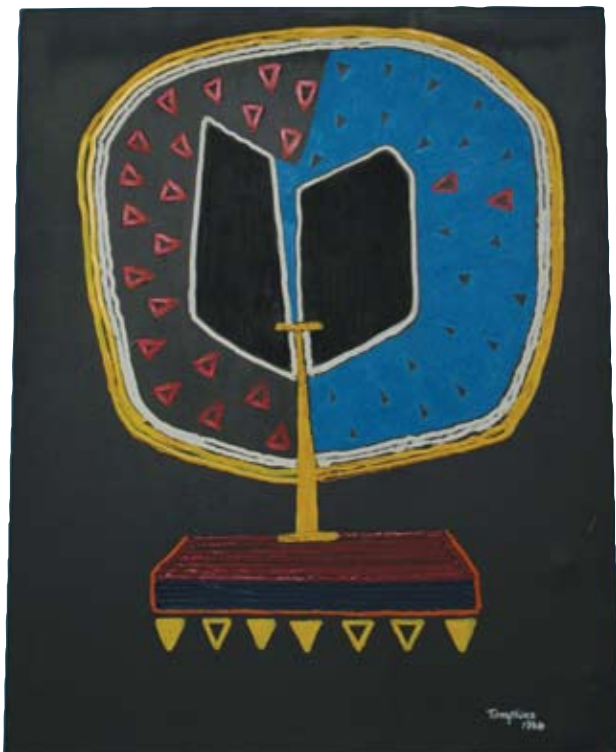
339. "THE TUBE", OIL ON CANVAS, signed lower right Tompkins, 1966. 50 in. x 40 in.