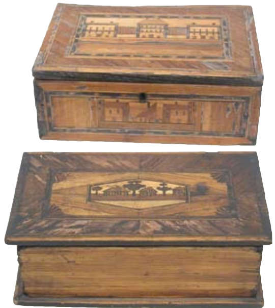
342. NAPOLEONIC PRISONER OF WAR STRAW WORK BOX, circa 1800 , interior with 4 even, open compartments. 3 in. x 8 in. x 5 ½ in.