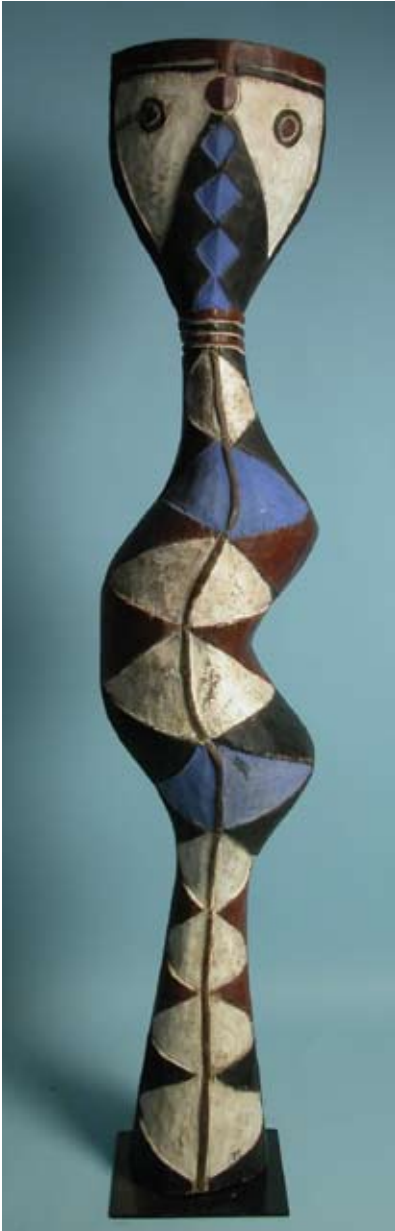
341. CARVED AND PAINTED BAGA SNAKE FROM IVORY COAST, AFRICA, 20 th Century , a symbol of fertility unifying water and earth, this statue embodies the spirit that guards the Bansonyi secret society initiation ceremonies. It is brought out before dances to purify the area. Height 78 in.