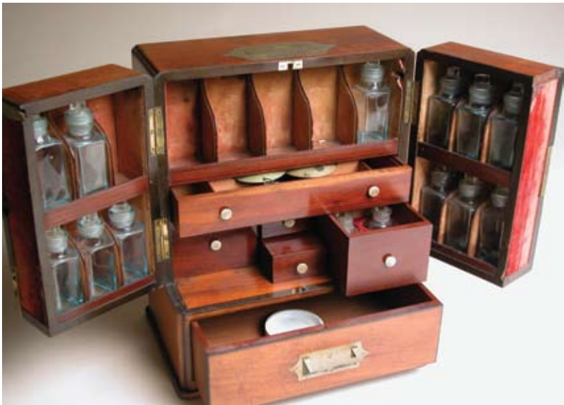
346. MAHOGANY AND EBONY TRAVELING APOTHECARY BOX, circa 1840, with concealed compartment. Height 14 ½ in. Width 12 in. Depth 7 ½ in.