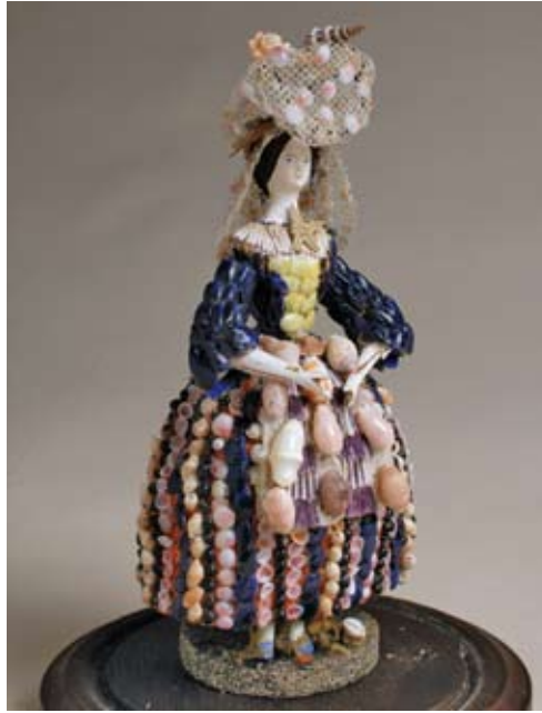
337. FRENCH COQUE FIGURE OF A WOMAN, early 19 th Century, carved and painted wood face, arms and legs. Height 9 in.