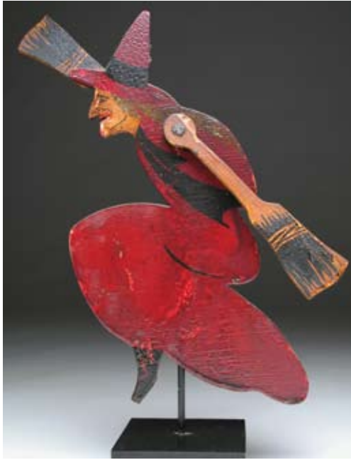
165. RARE LINCOLN COUNTY WITCH WHIRLIGIG. Height 15 in.