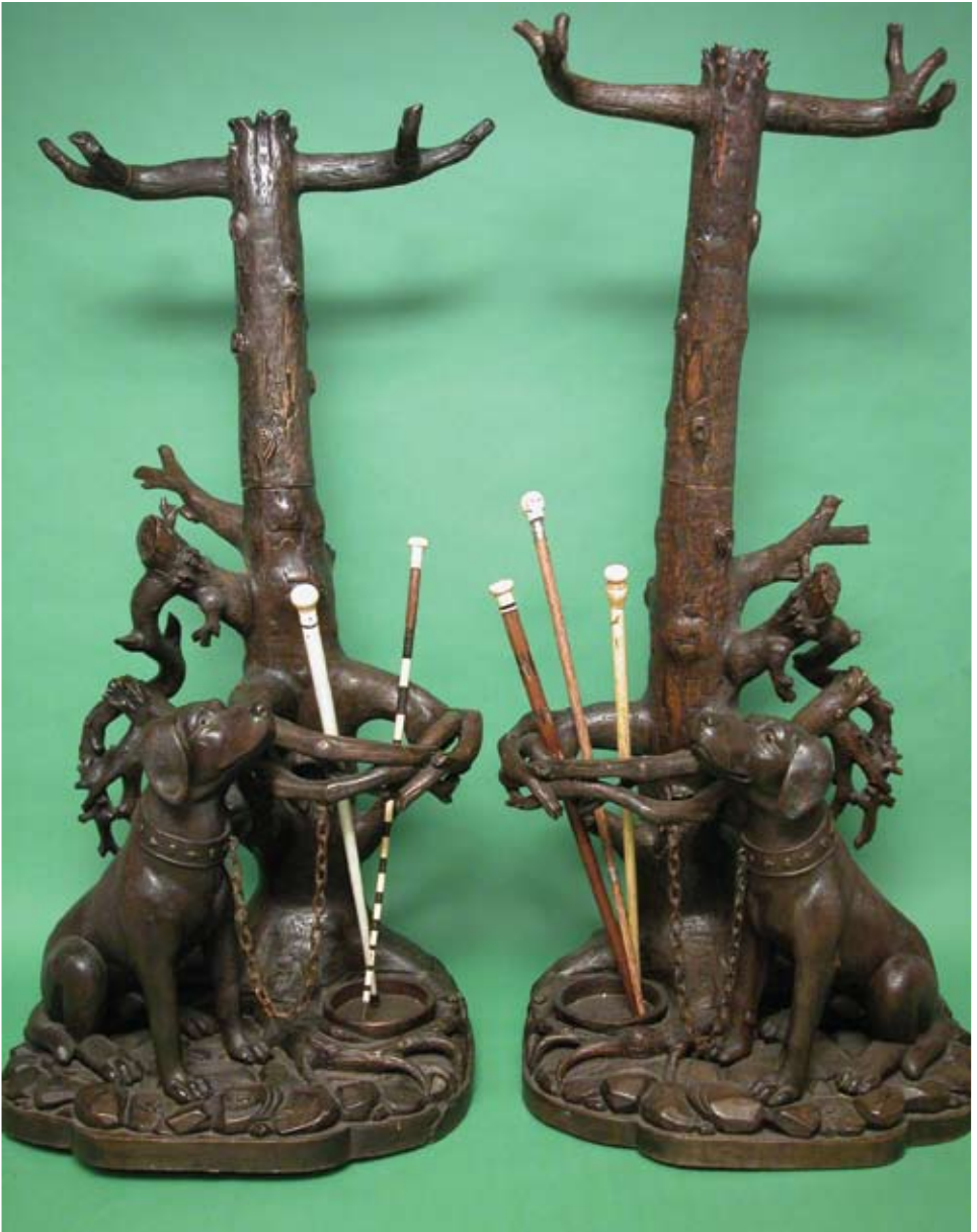
170. PAIR OF SCARCE BLACK FOREST HALL TREES, last quarter of the 19 th Century, depicting seated dogs in a rock formation in front of a tree. Height 6 ft. Width 34 in.