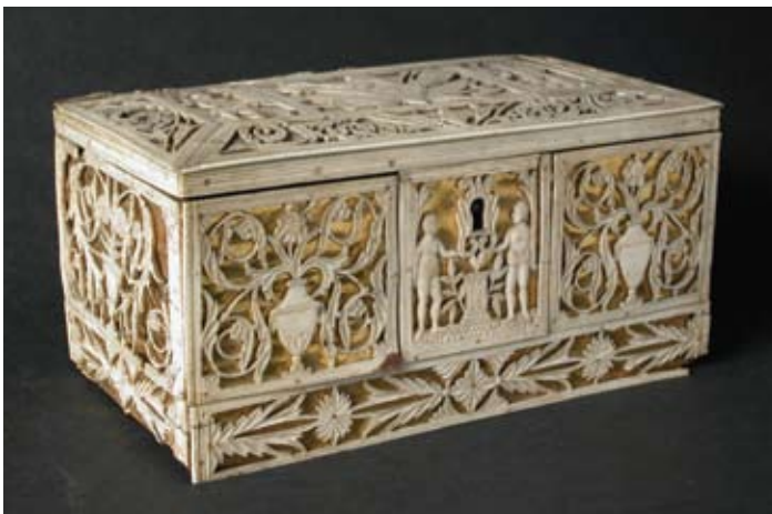
177. RUSSIAN TEA CADDY, circa 1800 , filigree cut bone panels of urns and foliage, figures, weapons, flags, shield and helmet; the interior with carved bone cover. Height 3 ¾ in. Length 7 ½ in. Depth 4 in.