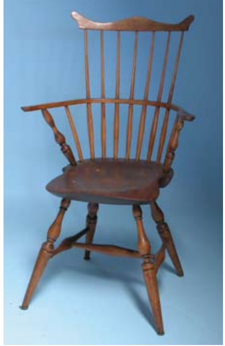
171. UNUSUAL SIZE AMERICAN COMB-BACK WINDSOR LADY'S ARMCHAIR, circa 1770. Seat Height 18 in.