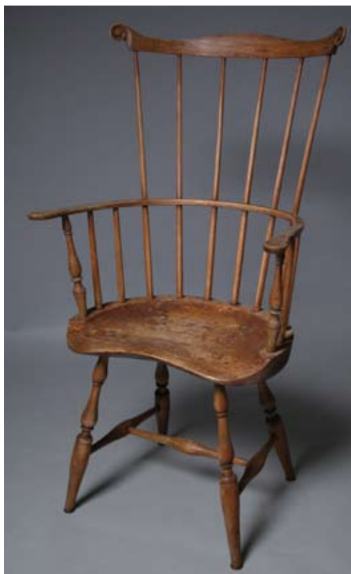
175. AMERICAN COMB-BACK WINDSOR ARMCHAIR, circa 1770, good carved ears and outward ramp with scrolled arms, good turnings on legs and arm supports. Seat Height 18 in.