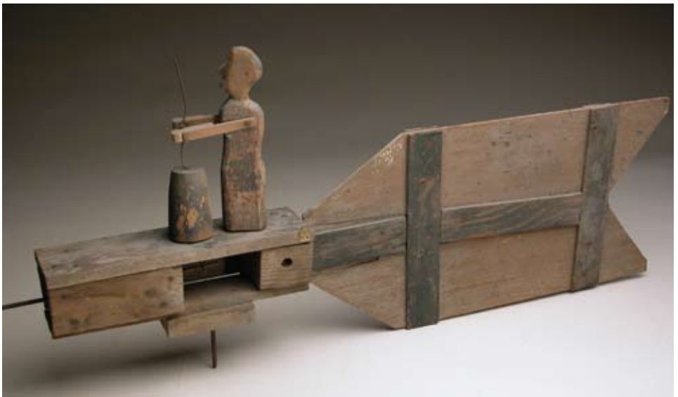
168. WOOD AND POLYCHROME WHIRLIGIG FRAGMENT OF WOMAN CHURNING BUTTER, turn of the Century. Height 12 in. Width 32 in. Illustrated: Country Home Magazine, April 1998.