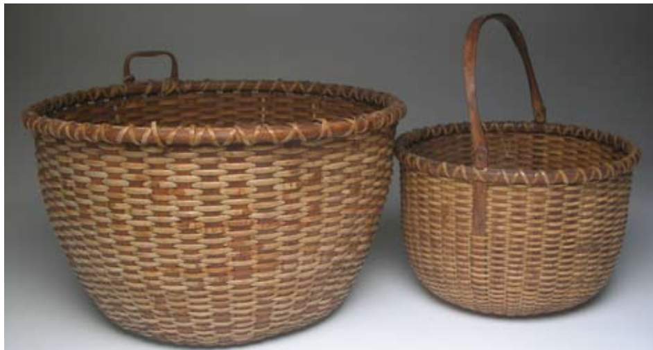
173. RARE NANTUCKET SINGLE HANDLE BUSHEL HARVEST BASKET, circa 1890, branded "G.C. Gardner". Height 13 in. Diameter 21 in.