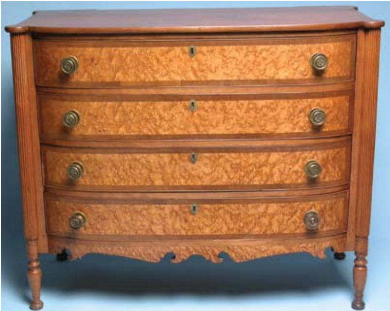
164. AMERICAN SHERATON CHEST OF DRAWERS , circa 1820, cherry, bird's-eye-maple and mahogany bow front chest with three-quarter outset reeded front legs and half-round reeded rear legs, cock-beaded drawers with thistle reposed brass pulls and escutcheons. Height 39 ½ in. Width 47 ½ in. Depth 22 in.