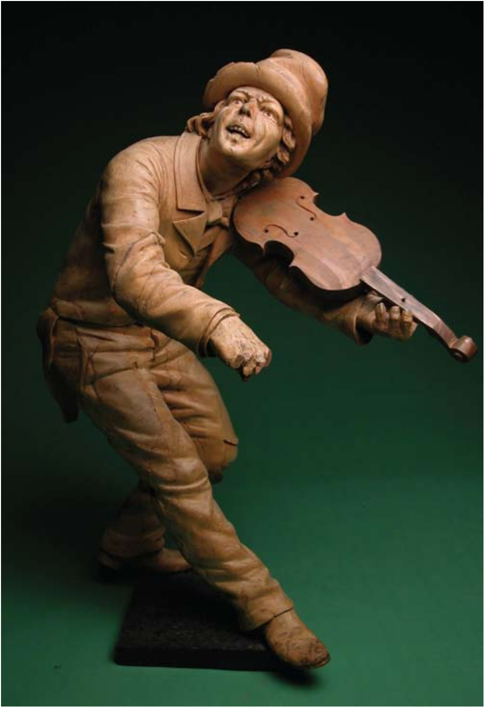
169. CARVED PINE FIDDLER TRADE SIGN, mid 19 th Century. Height 36 in.