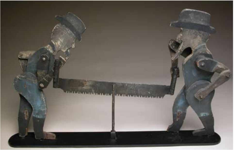
167. ARTICULATED FIGURES WITH SAW, turn of the Century, polychrome paint on wood, found in New York. Height 20 in. Width 30 in.