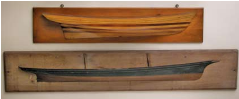
28. AMERICAN HALF HULL LAMINATED SCHOONER ON BOARD, circa 1890. 8 ½ in. x 40 ¼ in.