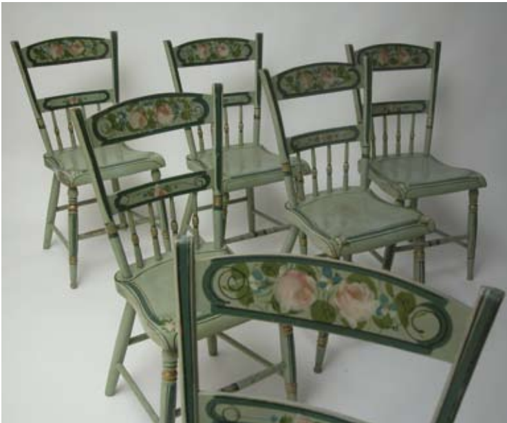
40. SET OF SIX TIOGA COUNTY, PENNSYLVANIA PLANK SEAT DINING CHAIRS, 19 th Century, pastel green half-spindle chairs with original floral rose and gilt decorations.