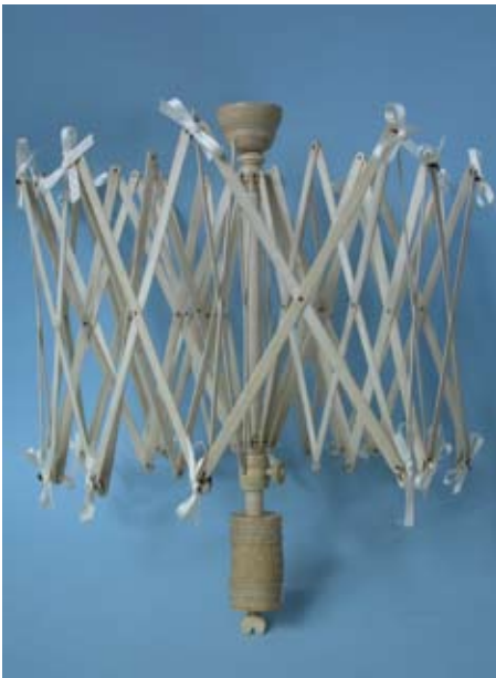
23. WHALEBONE AND WHALE IVORY SWIFT, circa 1850 , bone cage with turned ivory cup, barrel form clamp, and adjusting nut, in hardwood box. Height 14 in.