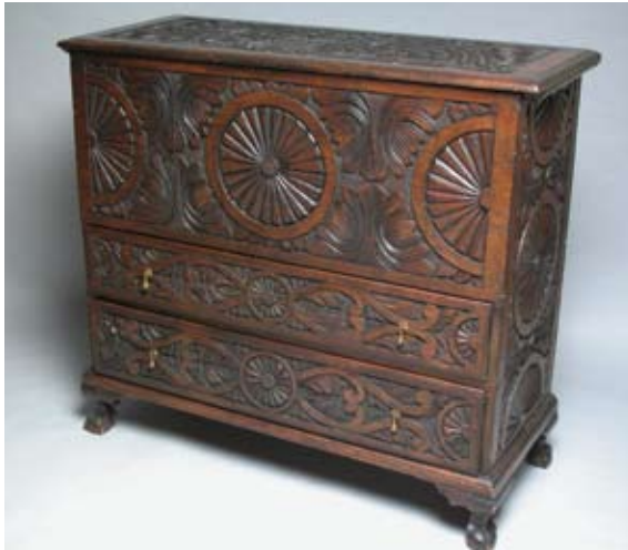
38. PHILADELPHIA OAK TWO DRAWER BLANKET CHEST, 18 th Century, with circa 1819 carvings, the hinged top carved with spread wing eagle on shield with 21 stars, the front and sides carved with wheels and leaf tips on claw and ball feet. Height 41 in. Width 46 in. Depth 19 in.