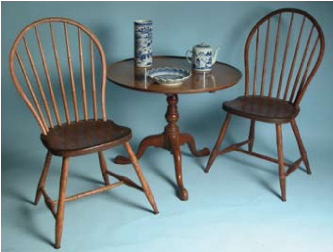
46. PAIR OF AMERICAN 7-SPINDLE BOWBACK WINDSOR SIDE CHAIRS, circa 1810, stamped G. Gaw. Seat Height 18 ½ in.