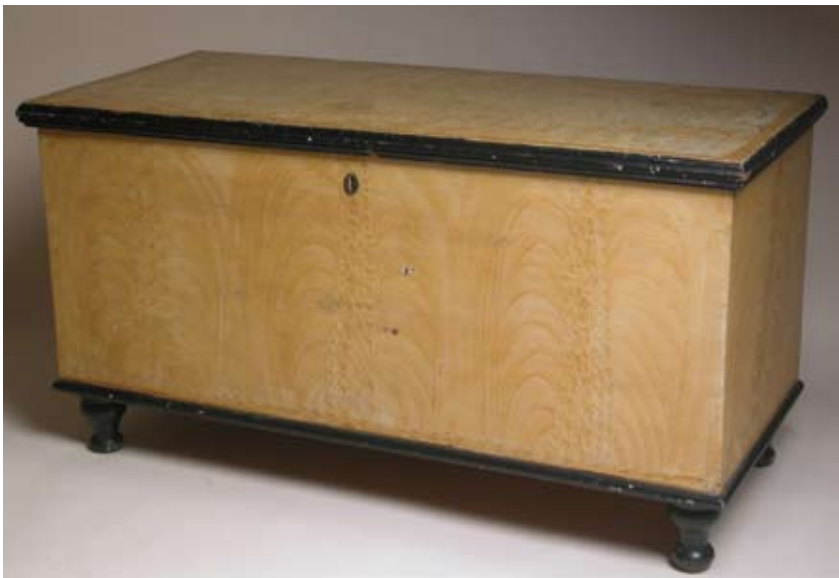
42. PENNSYLVANIA FAUX GRAIN DECORATED BLANKET CHEST, 19 th Century , with tree of life pattern. Height 26 in. Width 49 in. Depth 21 in.