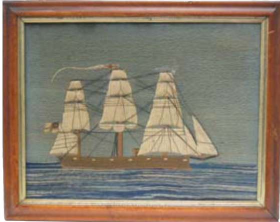
37. WOOLIE OF A BRITISH THREE-MAST BRITISH CLIPPERSHIP, 19 th Century, period maple frame. 15 in. x 20 in.