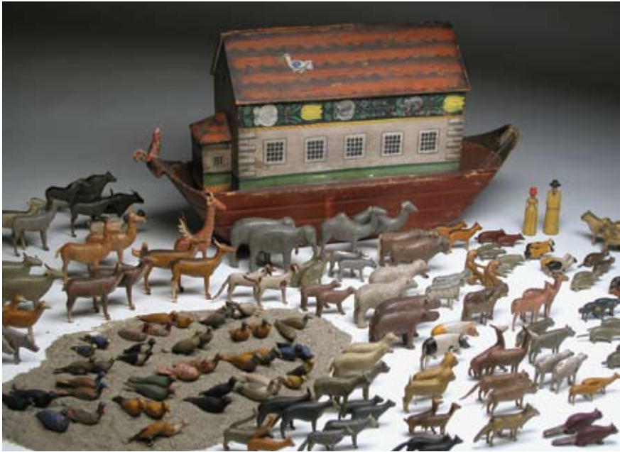
41. FOLK ART NOAH'S ARK, mid 19 th Century , in original paint, complete with 22 pairs of bird species, 61 animal pairs, one rooster and Noah and his wife. 169 pieces total.