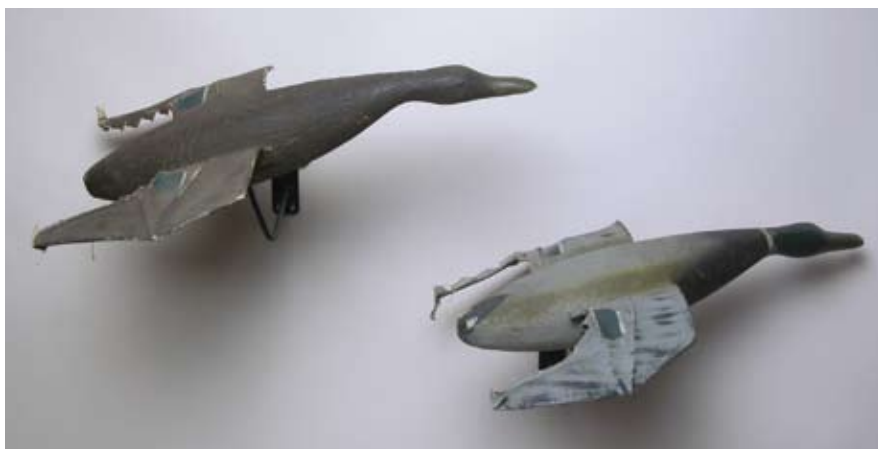
43. PAIR OF FLYING MALLARD DUCK DECOYS , wood and canvas, Tuveson Co., St. Paul Minnesota. Exhibited: Ward Museum of Wild Fowl Art, Salisbury, Maryland. Length 23 in.