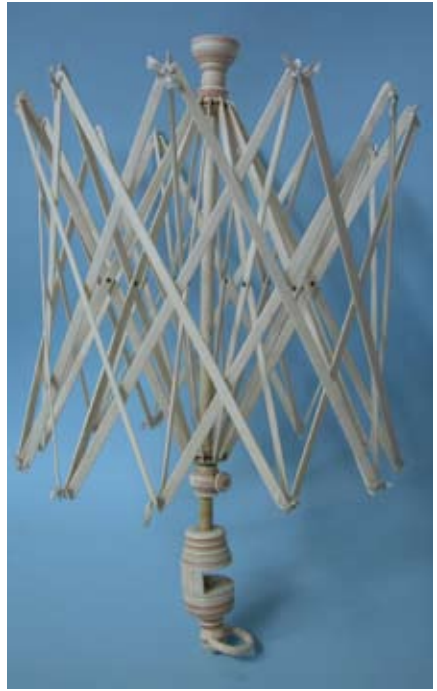
22. NANTUCKET WHALE IVORY AND WHALEBONE SWIFT, circa 1860 , bone cage with turned ivory and red scribe line cup, adjusting nut, and clamp with drop ring. Height 21 in.