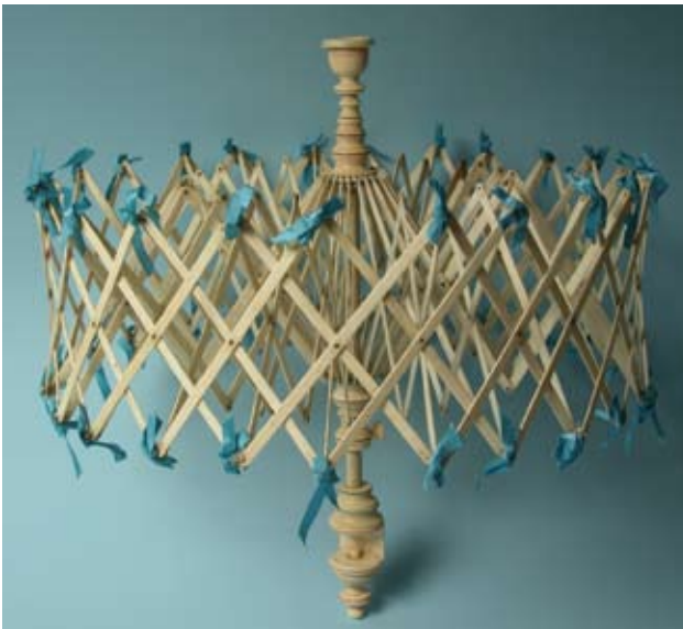
26. WHALE IVORY AND WHALEBONE SWIFT, circa 1860, twenty-four bone ribs and double cage, supported on turned ivory clamp and cup finial with three color scribe lines. Height 17 ½ in. Diameter opened 20 in.