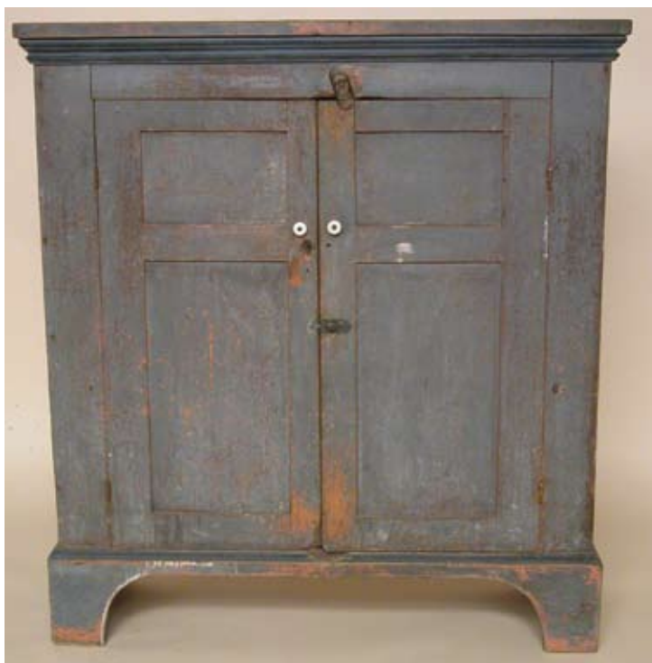
44. VERMONT JELLY CUPBOARD , mid 19th Century, old blue paint over original salmon paint. Height 49 in. Width 45 in. Depth 16 in.