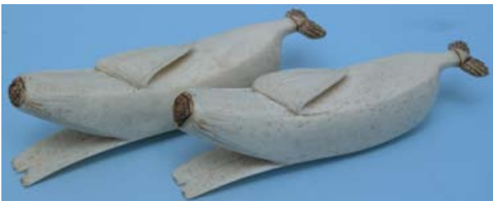
30. TWO UNIQUE WHALEBONE CARVINGS, circa 1850, depicting two partially peeled bananas with whale tails.