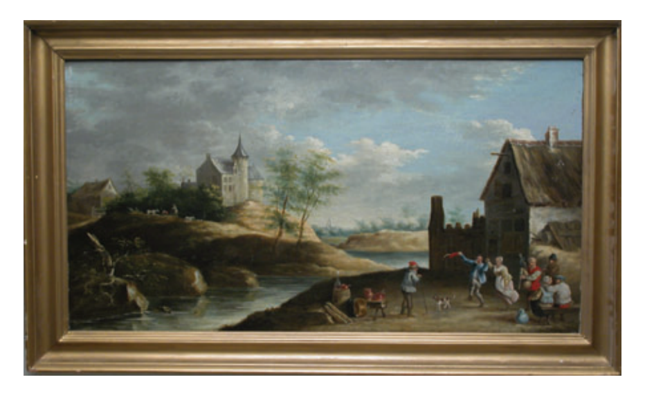
173. DUTCH SCHOOL OIL ON CANVAS " Lakeside Picnic Scene with Family Frolicking ", 18 <sup>th</sup> Century, monogrammed lower center. 18 in. x 35 in. Provenance: David Brooker, DB Fine Arts, Woodbury, Connecticut