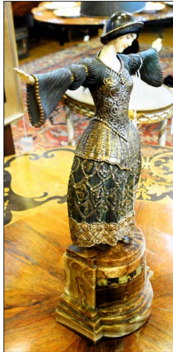
The Dimitri Chiparus patinated bronze and ivory sculpture did well at $25,520.

Review and Photos by Antiques and The Arts Weekly David S. Smith, Managing Editor