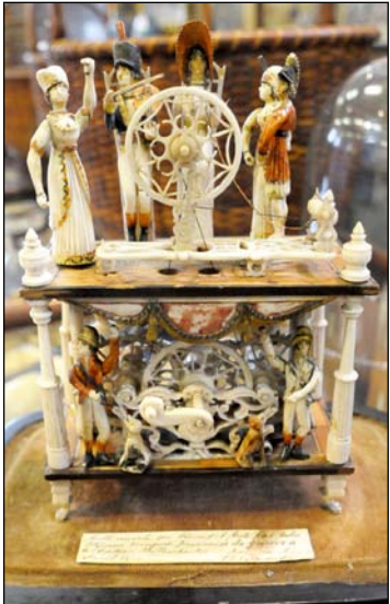
The polychromed French prisoner-of-war articulated "Spinning Jenny," 7 inches tall, hammered at $34,800.