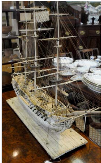
The French prisoner-of-war carved bone ship model, circa 1800, was one of the stars of the auction, selling at $52,200.

NANTUCKET, MASS. — Spirited bidding across the board was witnessed at Rafael Osona's Americana, fine arts and marine auction, August 4, as a stellar selection of materials crossed the auction block. Taking place in conjunction with the Nantucket Antiques Show, the event drew large crowds for preview and again on Saturday morning for the