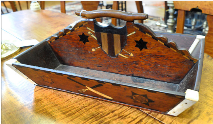
The rare sailor-made knife box with Norman Flayderman provenance was bid to $26,680.