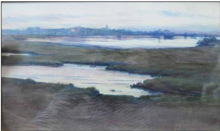
The Anne Ramsdell Congdon watercolor “Nantucket Town Skyline from the Creeks,” a rare early work, sold at $10,440.

Prices reported include the buyer’s premium. Osona will be conducting auctions on the island on September 1 and 15, October 6, November 24 and December 1. For information, www.Rafaelosonaauction.com , or 508-228-3942.