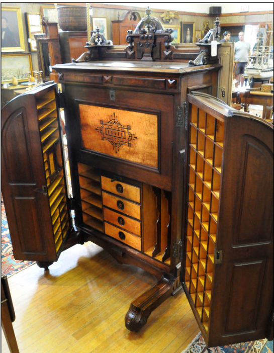
The Wooton desk did well, selling at $13,920.

While furniture has been bringing lackluster prices as of late, a rare Nantucket-made Windsor brace back armchair elicited strong bids, with the lot hammering down at $11,600.