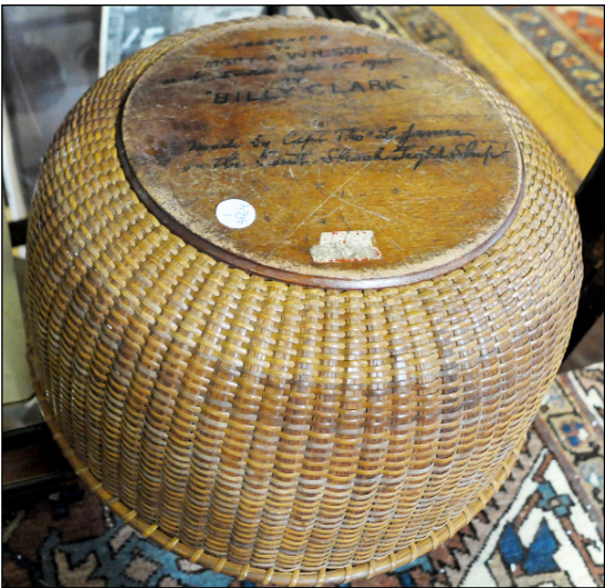
The Nantucket basket by Captain Thomas James with inscription on the wooden bottom sold at $6,960.

Prices reported include the buyer’s premium. Osona will be conducting auctions on the island on September 1 and 15, October 6, November 24 and December 1. For information, www.Rafaelosonaauction.com , or 508-228-3942.