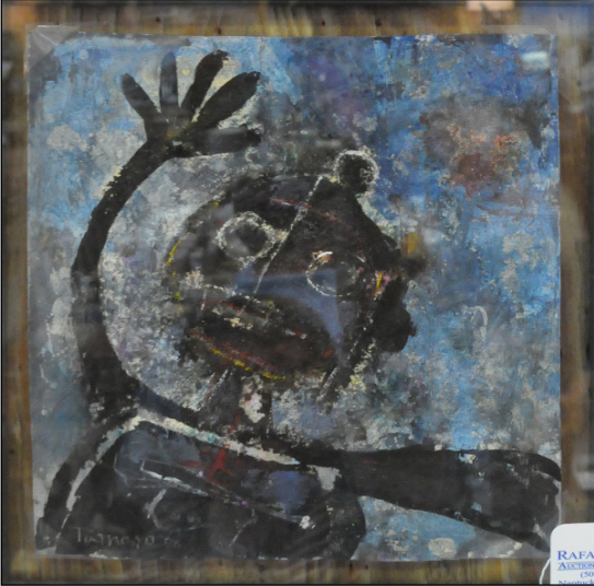
The Rufino Tamayo oil and sand painting "High Five" went out at $12,760.