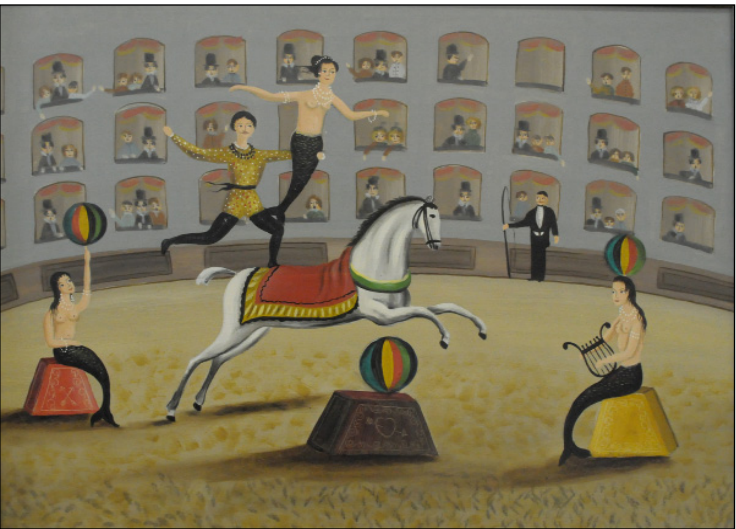
The Ralph Cahoon oil “Circus Horse Play” sold for $10,440.